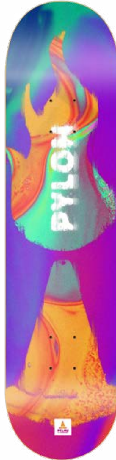
SWIRL 8.25" AVAILABLE IN 8.28" x 32" 14.5" WB