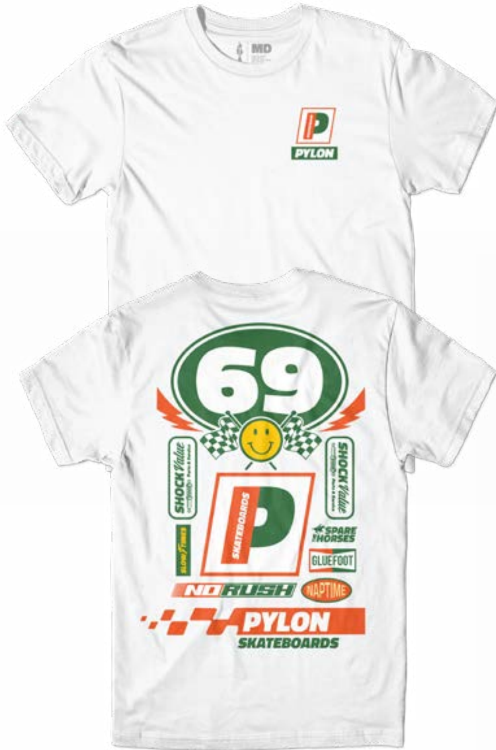
NO RUSH TEE 100% COTTON T-SHIRT COLOR: WHITE AVAILABLE SIZES: SMALL - XXL