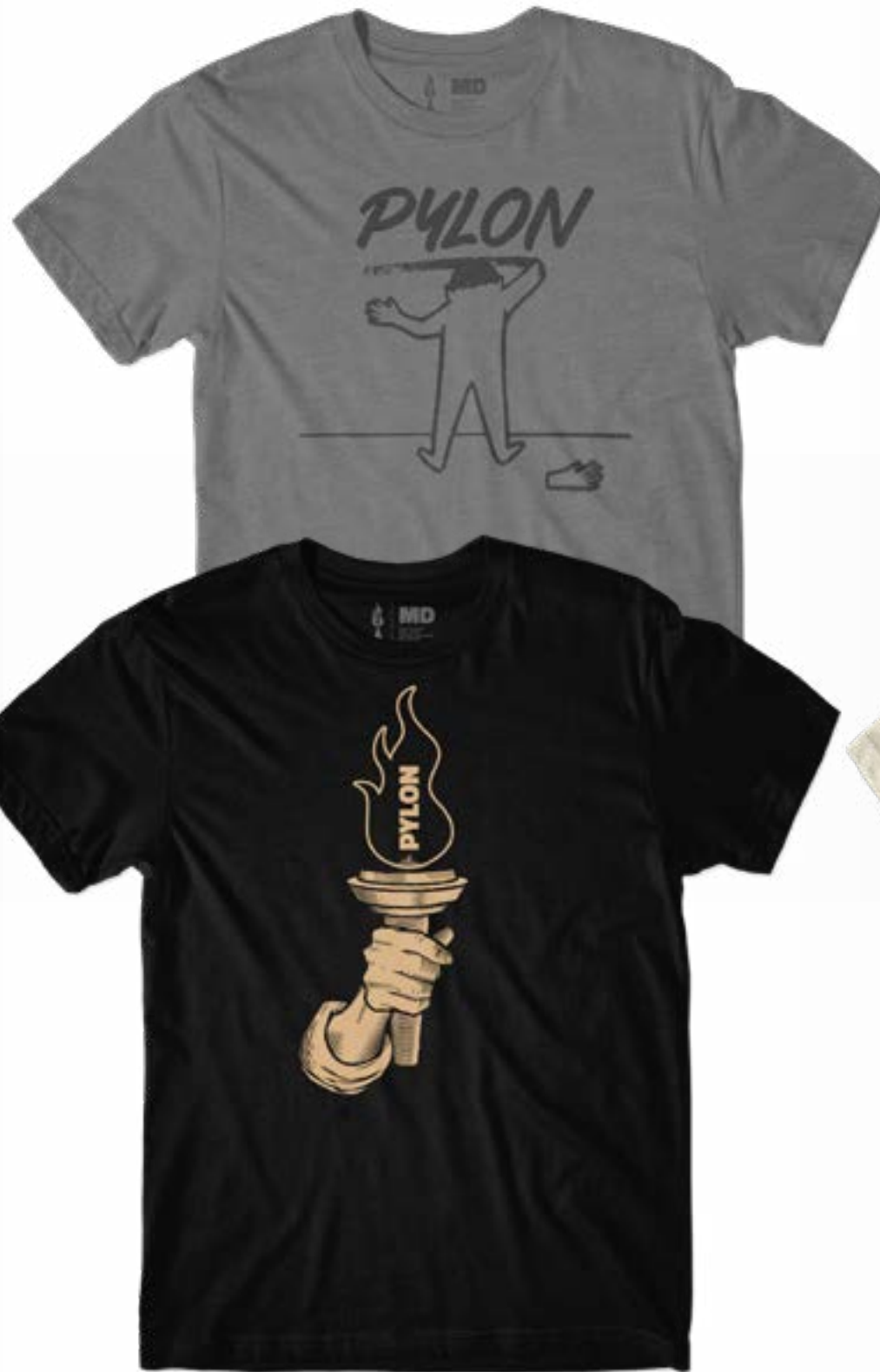
HELPING HAND TEE 100% COTTON T-SHIRT COLOR: GREY AVAILABLE SIZES: SMALL - XXL