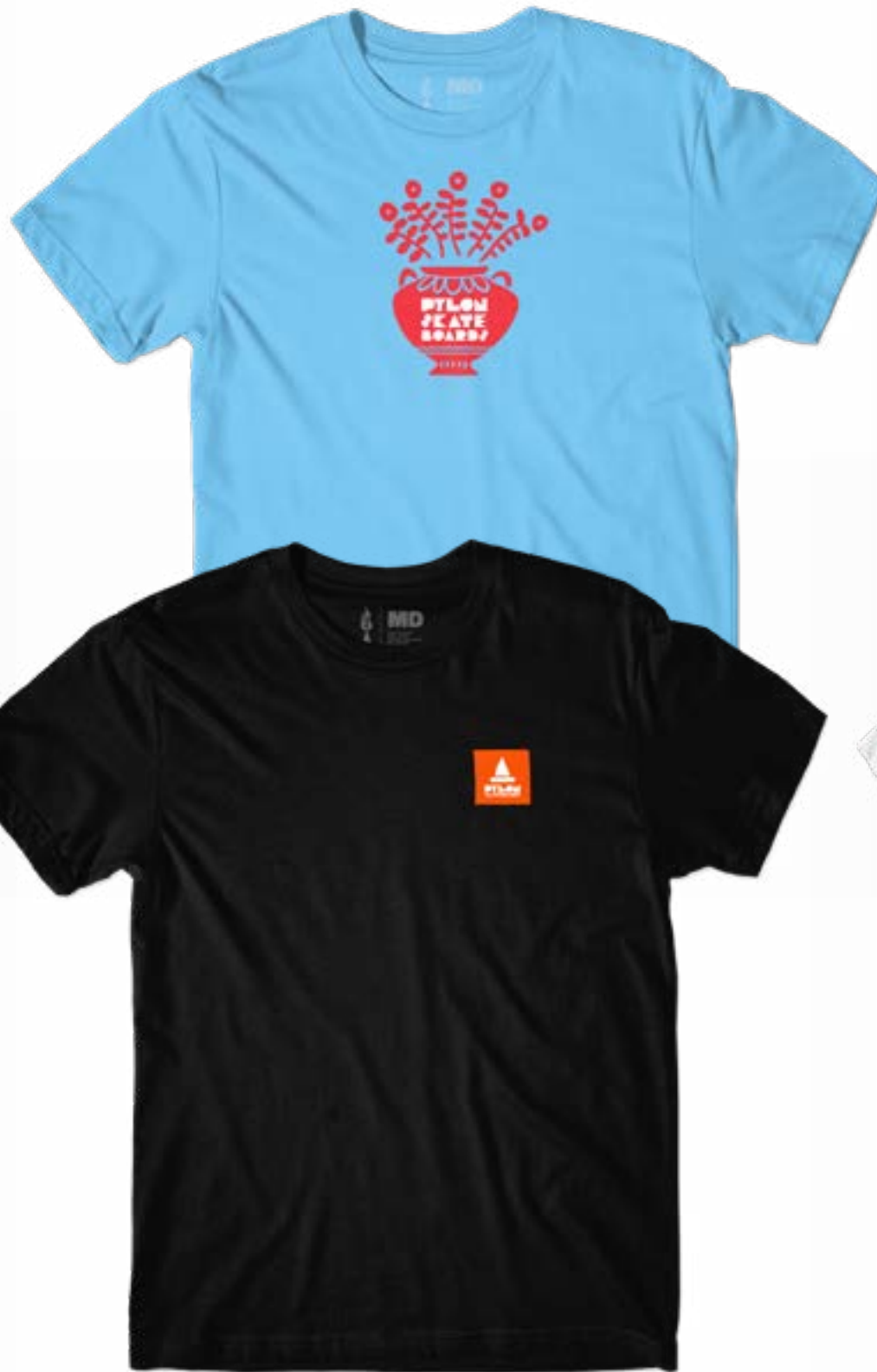
VASE TEE 100% COTTON T-SHIRT COLOR: POWDER BLUE AVAILABLE SIZES: SMALL - XXL