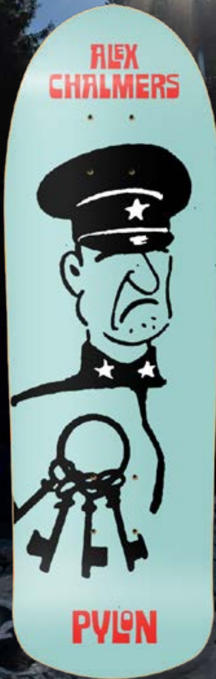
"THE WARDEN" CRUISER AVAILABLE IN 9.375" x 31.25" WB 14.5"