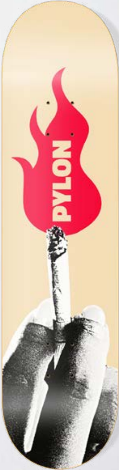
LIGHT AVAILABLE IN 8.38" x 32" 14.5" WB