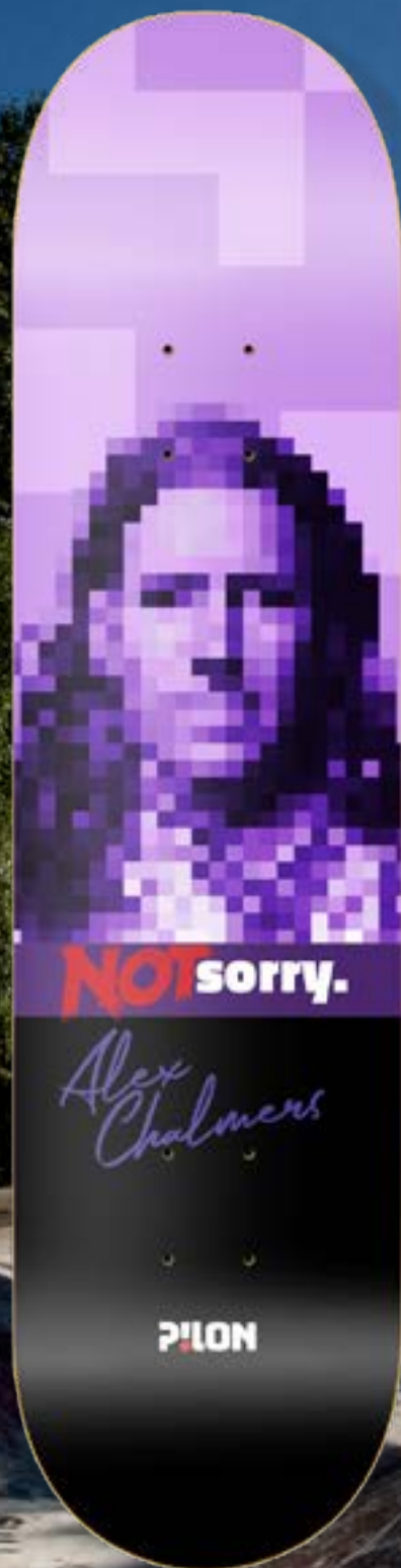
"NOT SORRY" AVAILABLE IN 8.5" x 32.5" 15" WB *Tapered shape