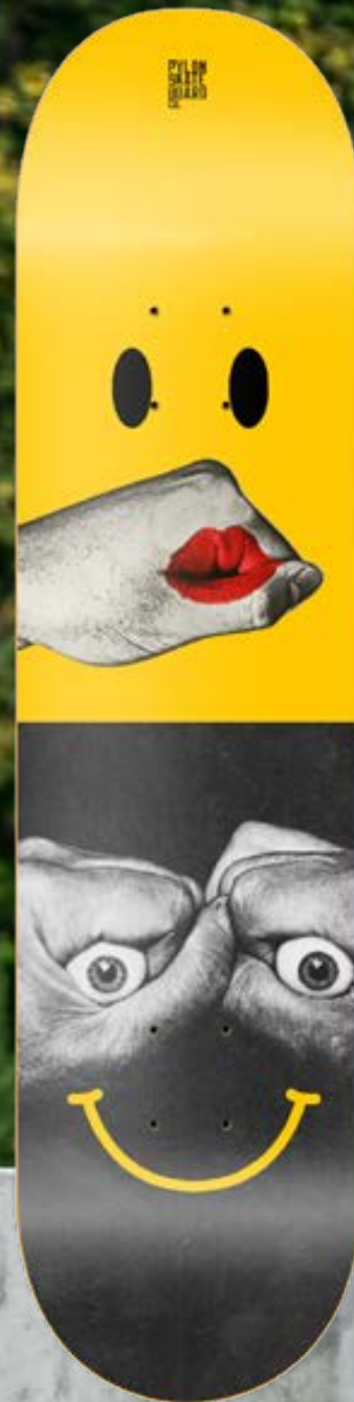
SMILE ON AVAILABLE IN 8" x 32" 14.5" WB