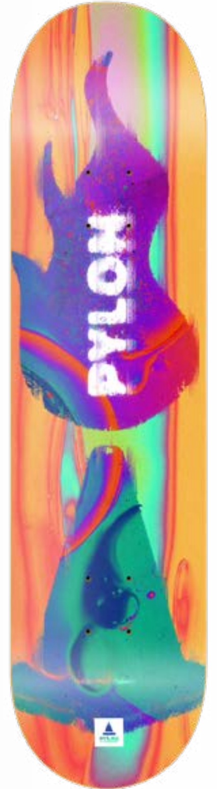
SWIRL 8.625" AVAILABLE IN 8.628" x 32" 14.5" WB