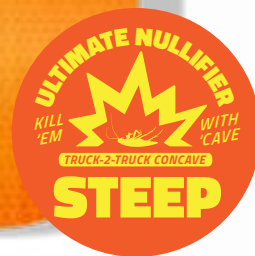
THE PICK AVAILABLE IN 9" x 33" 15" WB