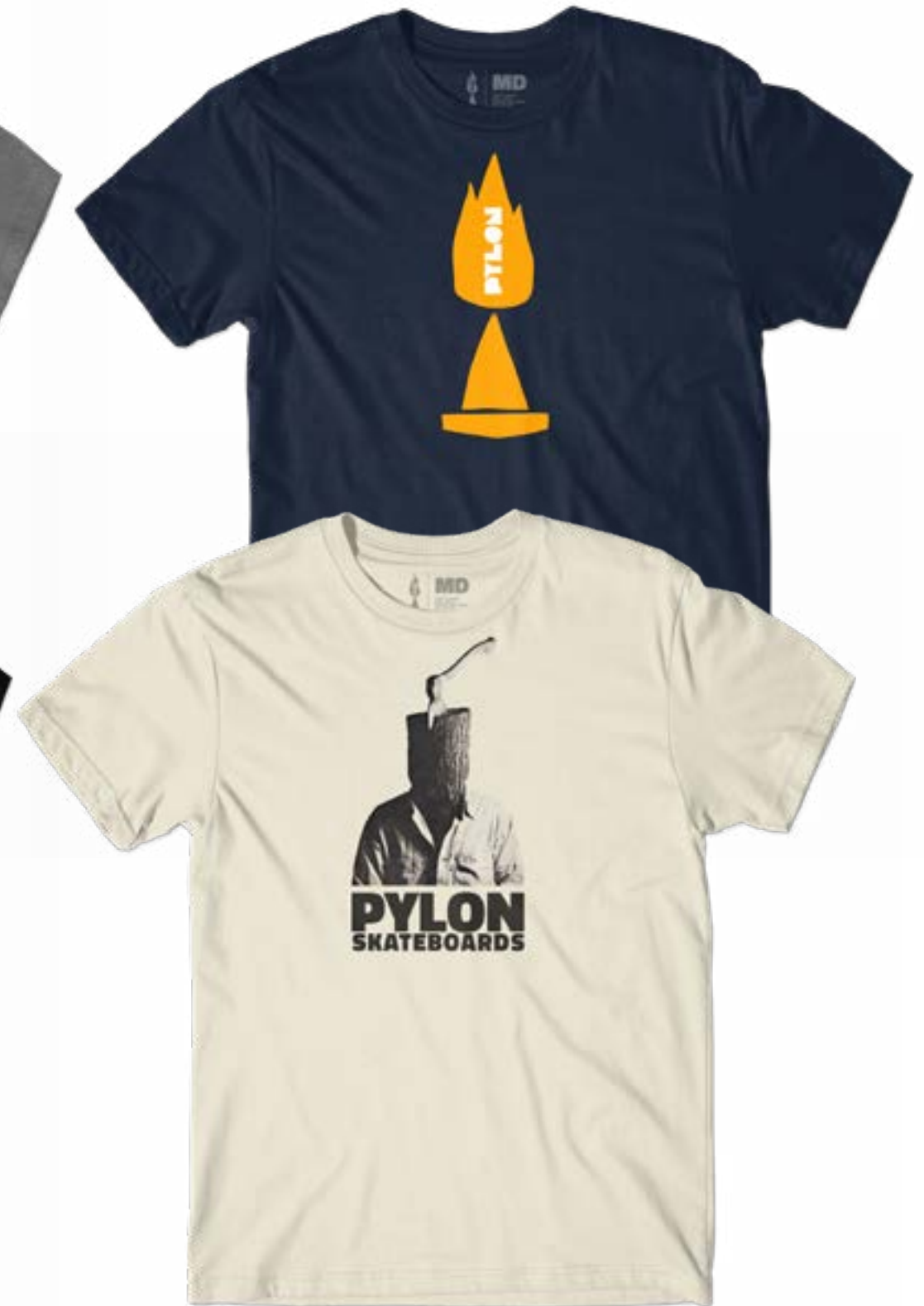
CHUNKY TEE 100% COTTON T-SHIRT COLOR: NAVY AVAILABLE SIZES: SMALL - XXL