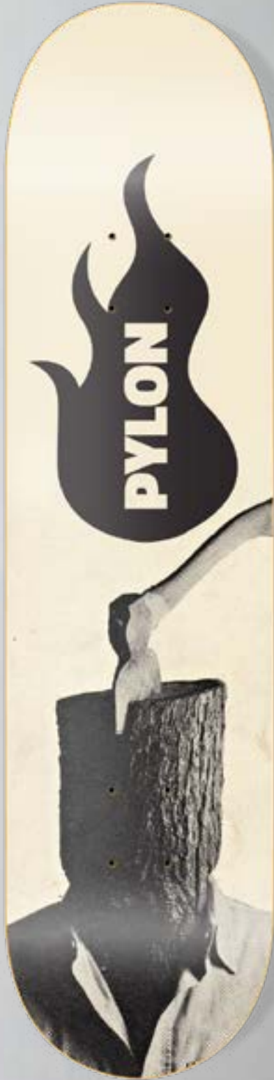
LOG AVAILABLE IN 8.75" x 32" 14.5" WB