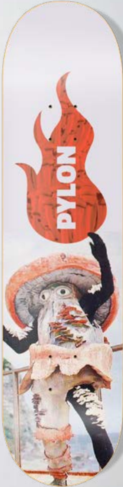
SHROOM AVAILABLE IN 8.5" x 32" 14.5" WB