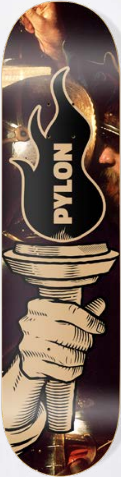
TORCH AVAILABLE IN 8.25" x 32" 14.5" WB