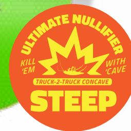
THE SICKLE AVAILABLE IN 8.5" - 8.625" - 8.75" x 32" 14.5" WB