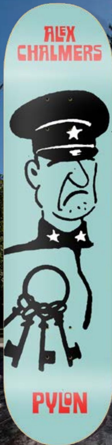
"THE WARDEN" AVAILABLE IN 8.25" x 32.375" 14.5" WB