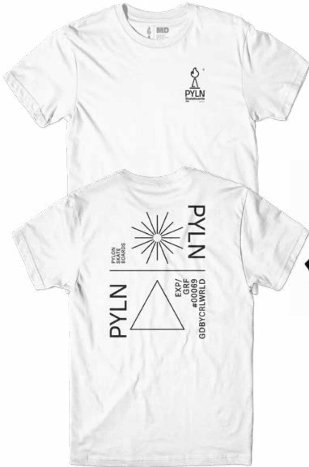
2BORING TEE 100% COTTON T-SHIRT COLOR: WHITE AVAILABLE SIZES: SMALL - XXL