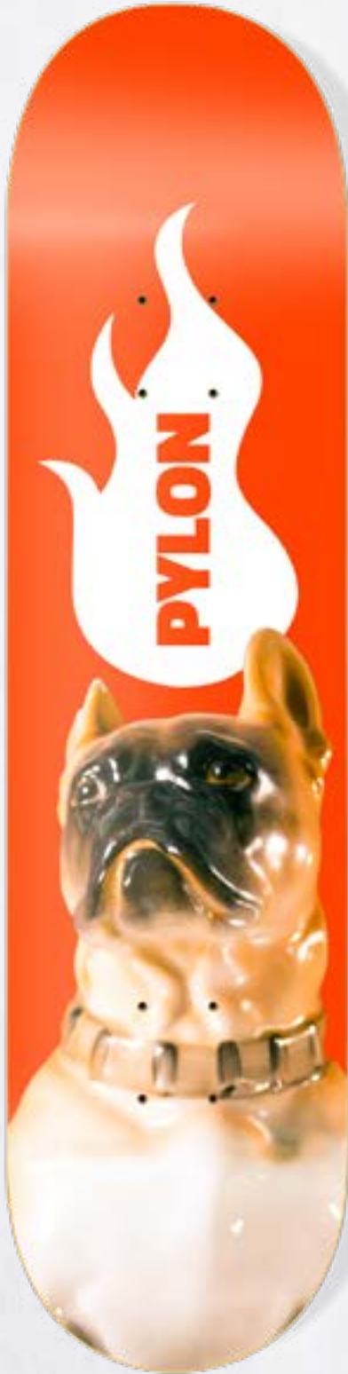
BULLY AVAILABLE IN 8.0" x 32" 14.5" WB