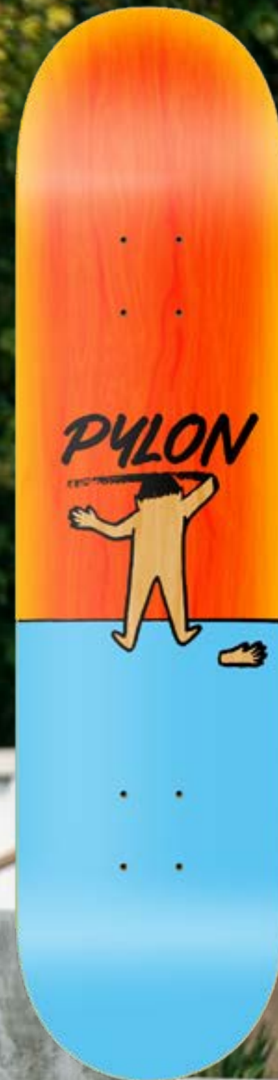
HELPING HAND AVAILABLE IN 8.5" x 32" 14.5" WB