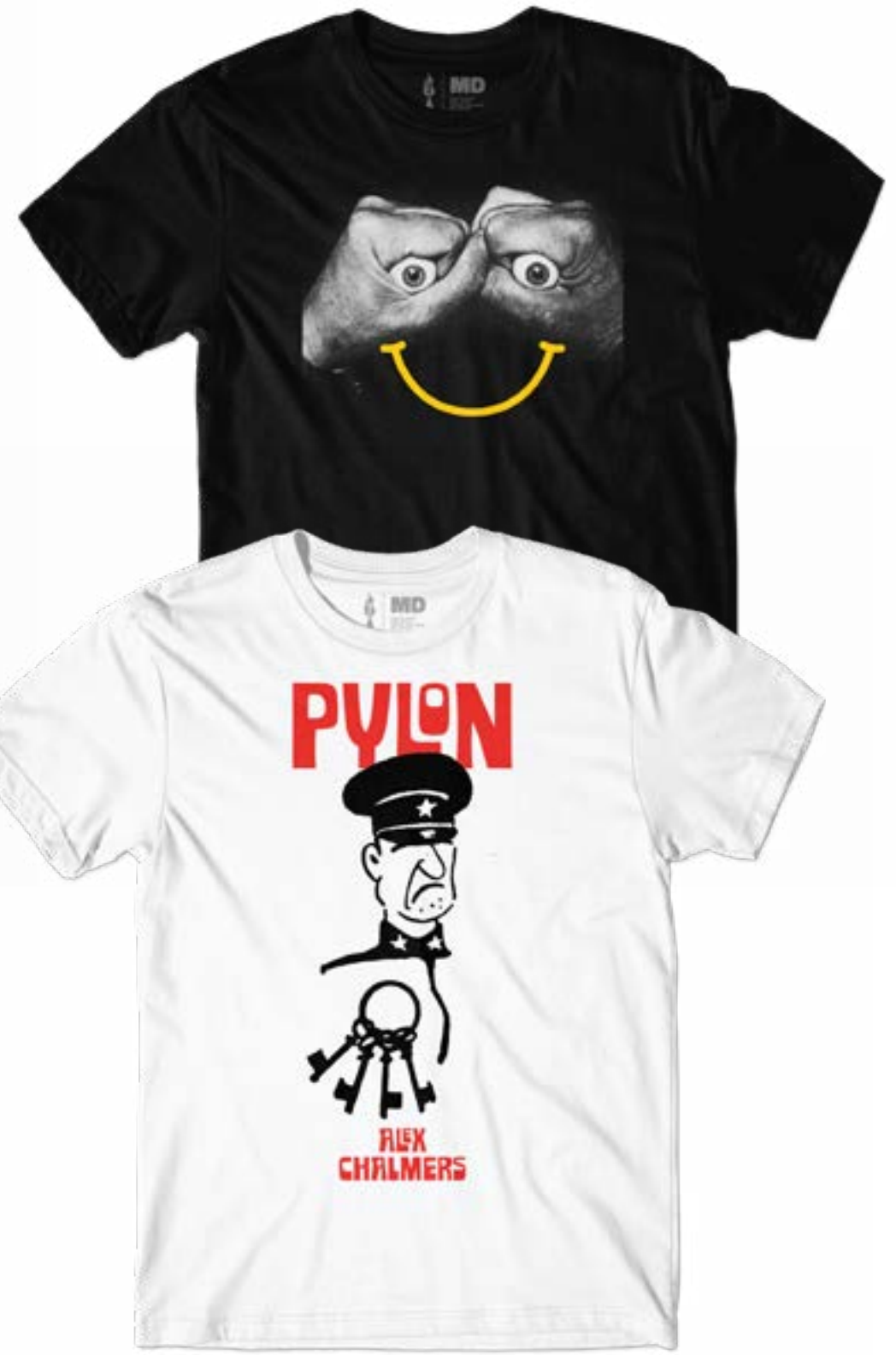
SMILE ON TEE 100% COTTON T-SHIRT COLOR: BLACK AVAILABLE SIZES: SMALL - XXL