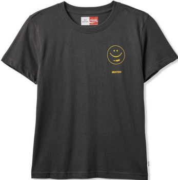
WASHED BLACK 22534-WABLK