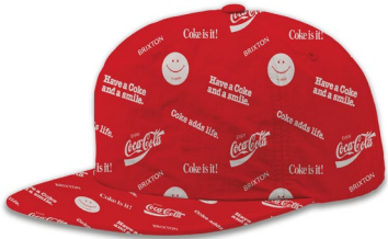
COKE RED 11496-CKERD

MEDIUM PROFILE = STRUCTURED 5-PANEL FLAT BILL O/S DELIVERY 2