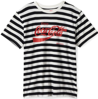
BLACK CLASSIC WASH 22521-BLCCW