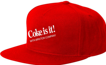
COKE RED 11498-CKERD