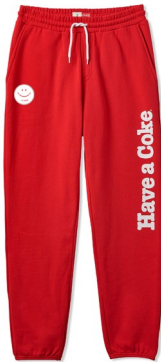
COKE RED 04923-CKERD