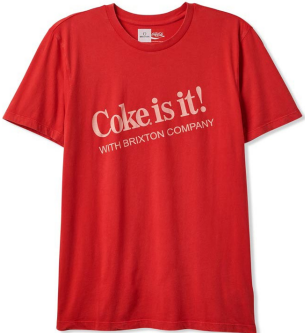
COKE RED WORN WASH 22522-CKRWW