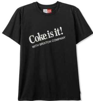
BLACK WORN WASH 22522-BKWOW