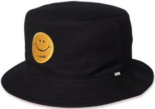
BLACK/COKE RED 11499-BKCKR