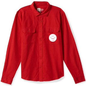
COKE RED 01370-CKERD