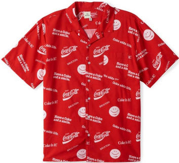
COKE RED 01371-CKERD