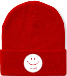
COKE RED 11501-CKERD