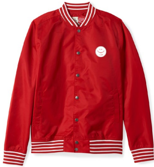
COKE RED 03429-CKERD