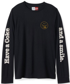
BLACK WORN WASH 22525-BKWOW