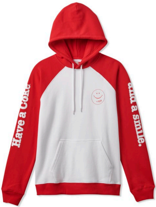
COKE RED 22527-CKERD