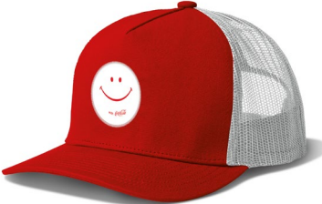
COKE RED 11497-CKERD