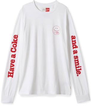
WHITE WORN WASH 22525-WHTWW