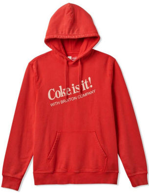
COKE RED WORN WASH 22526-CKRWW