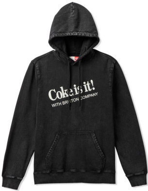
BLACK WORN WASH 22526-BKWOW