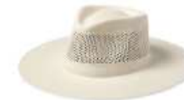
PANAMA WHITE 11531-PANWT