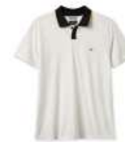
OFF WHITE/BLACK 22617-OFFBK