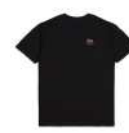
BLACK/CASA RED/WHITE 16172-BLCRW