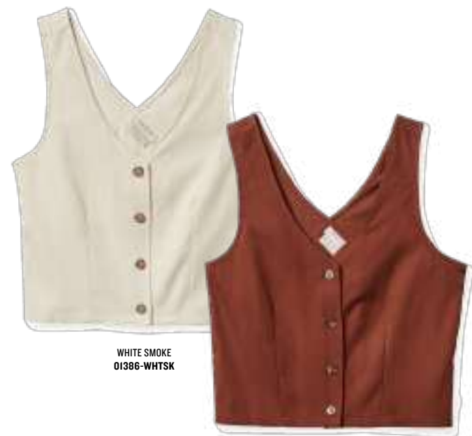
WHITE SMOKE 01386-WHTSK