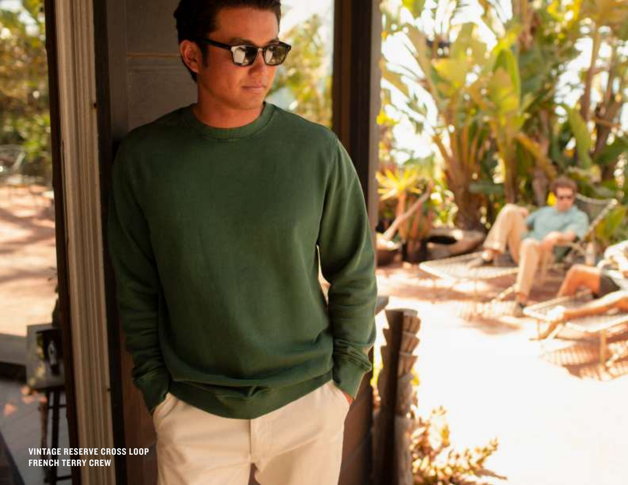
VINTAGE RESERVE CROSS LOOP FRENCH TERRY CREW