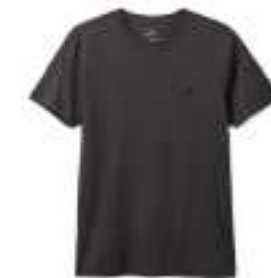
BLACK SOL WASH 22497-BKSWH