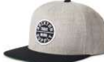
*LIGHT HEATHER GREY/BLACK 10777-LHGBK