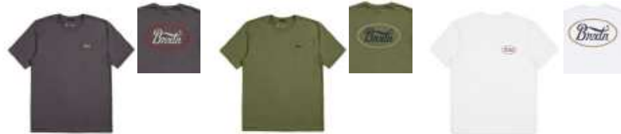
CHARCOAL/CASA RED/WHITECAP 16803-CHCRW