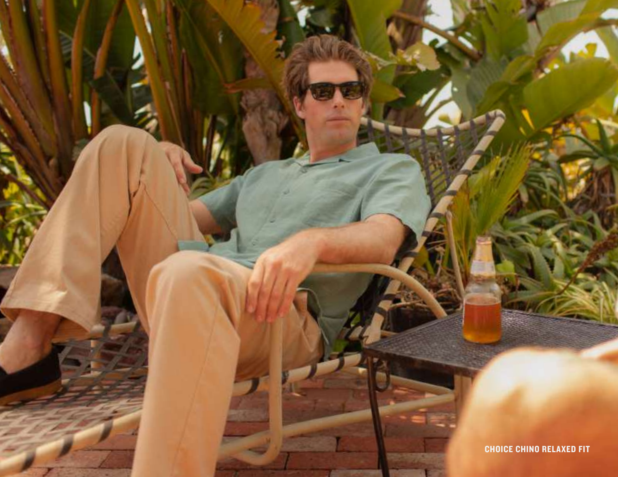
CHOICE CHINO RELAXED FIT