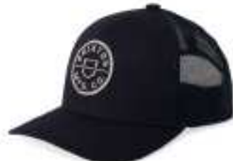
WASHED NAVY/NAVY 10921-WSNVY