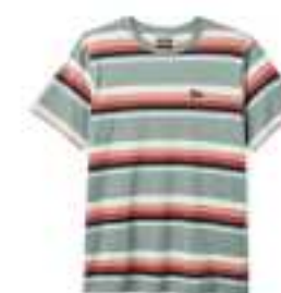
CHINOIS GREEN/TERRACOTTA/OFF WHITE 22616-CGTOW