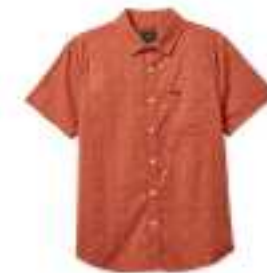
TERRACOTTA PYRAMID 01218-TRCPY