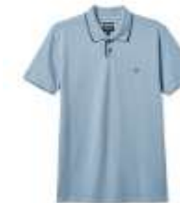
DUSTY BLUE/WASHED NAVY 22617-DSBWN