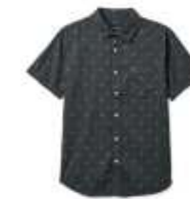
WASHED BLACK PYRAMID 01218-WHBPY