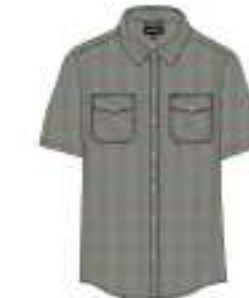
CHINOIS GREEN/RED CLAY 01414-CHGRC