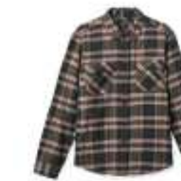
BLACK/CHARCOAL/OFF WHITE 01213-BKCOU