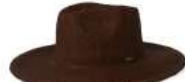
DARK EARTH 11613-DKEAR