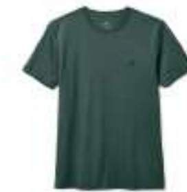
TREKKING GREEN SOL WASH 22497-TKGSW