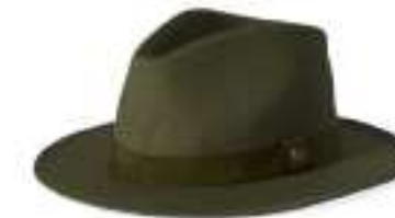
OLIVE SURPLUS 11617-OLVSP