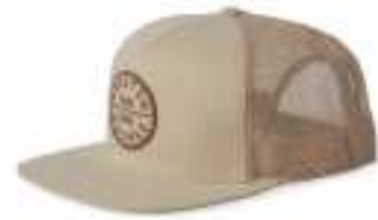
OAT MILK/OAT MILK 11627-OAMOM