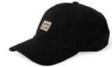
*BLACK VINTAGE WASH 11588-BLKVV