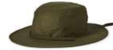
OLIVE SURPLUS 11648-OLVSP