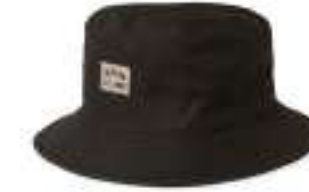
BLACK SOL WASH 11619-BKSWH