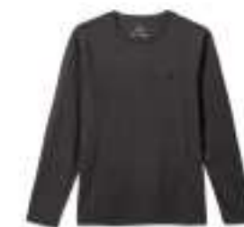
BLACK SOL WASH 22498-BKSWH