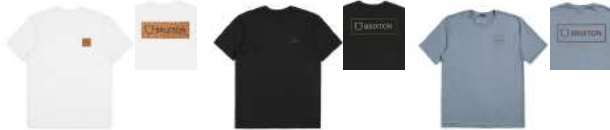
WHITE/TERRACOTTA/WASHED NAVY 16450-WHTWN