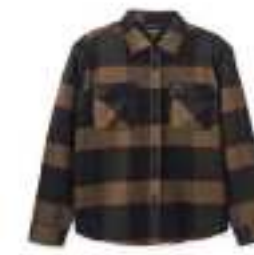
*HEATHER GREY/CHARCOAL 01213-HTGCH