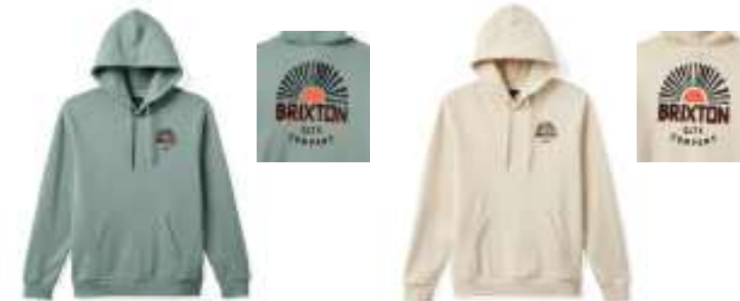
CHINOIS GREEN 22590-CHSGN