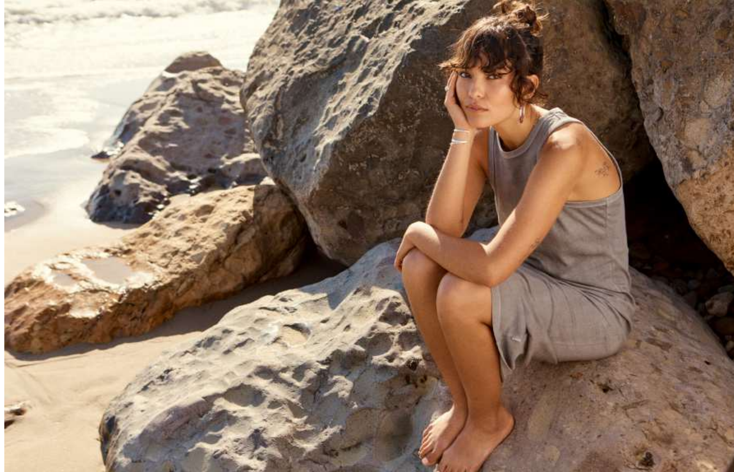
CAREFREE TANK DRESS