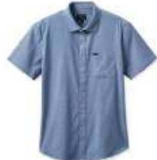
LIGHT BLUE CHAMBRAY 01217-LBLCH