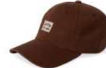
SEPIA VINTAGE WASH 11588-SEPVW