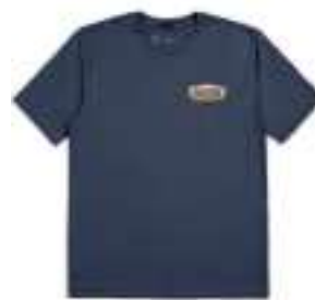
WASHED NAVY/SEPIA 16962-WHNSP