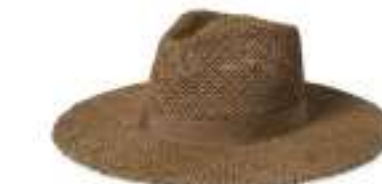
TAN/TAN SEAGRASS 11622-TNTNS