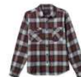
WASHED NAVY/DUSTY BLUE 01391-WHNDDB