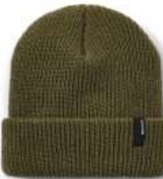
*MILITARY OLIVE 10782-MILOL