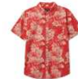
CASA RED/OATMILK FLORAL 01218-CSROF