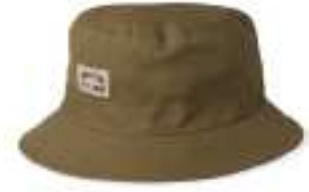
SAND SOL WASH 11619-SNDSW