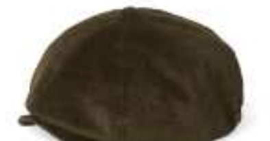
MOSS GREEN 10770-MSGRN