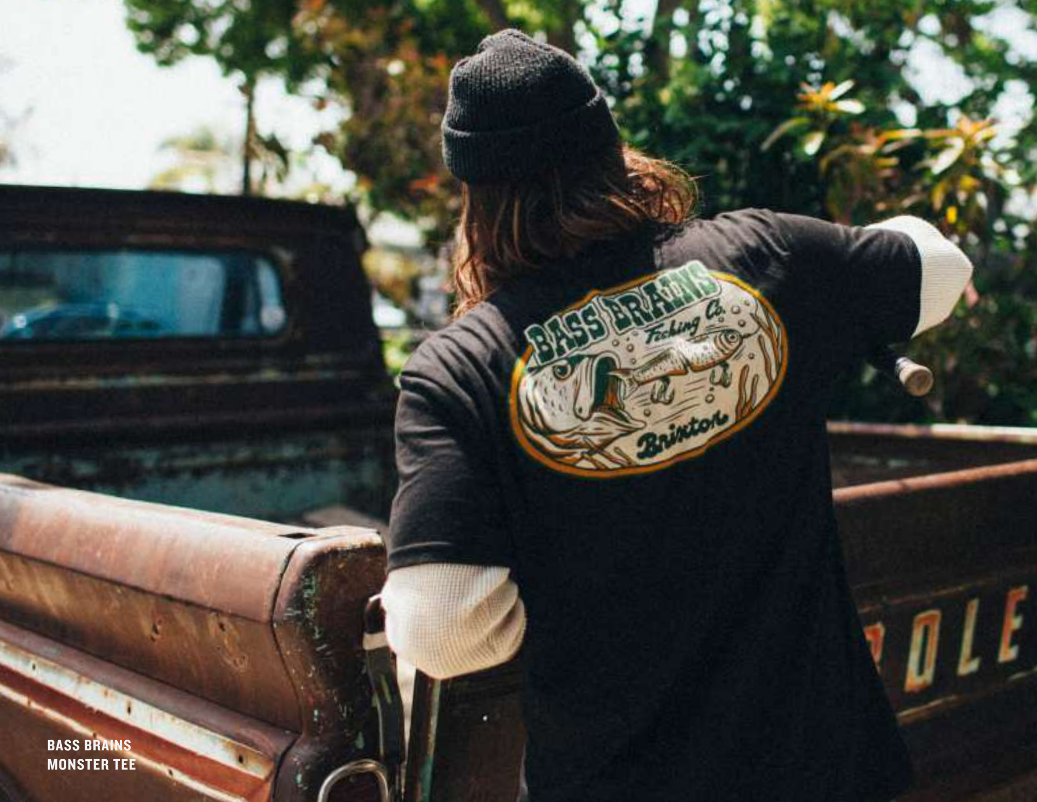
BASS BRAINS MONSTER TEE