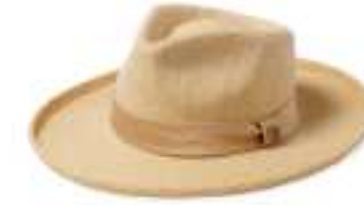
NATURAL/OAT MILK 11621-NTLOM