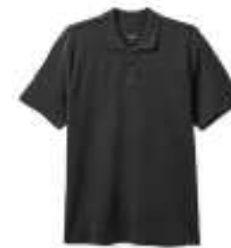
WASHED BLACK 22600-WABLK