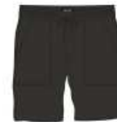
WASHED BLACK 04959-WABLK