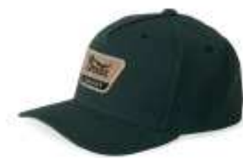
TREKKING GREEN/SAND 10980-TKGSD