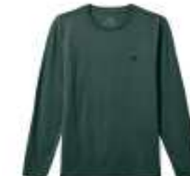
TREKKING GREEN SOL WASH 22498-TKGSW