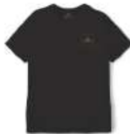
BLACK/CASA RED/SAND 16428-BLCRS