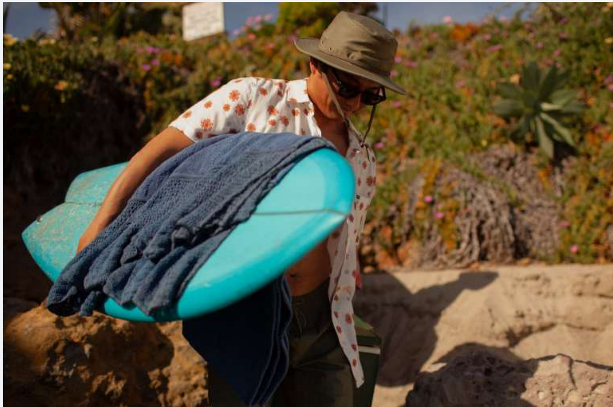
FEATURED: COOLMAX® PACKABLE SAFARI BUCKET HAT