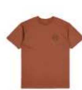
TERRACOTTA/WASHED BLACK 16493-TRCWB