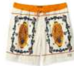
MEXICO CITY JAGUAR 16": 04930-MXCJG 18": 04942-MXCJG