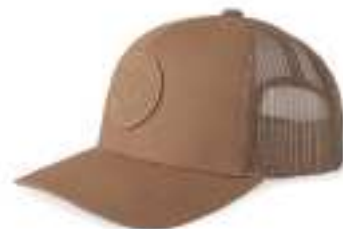
OAT MILK/OAT MILK 10921-OAMOM