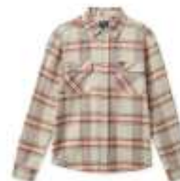
WHITE SMOKE/YELLOW/CASA RED 01213-WSYCR