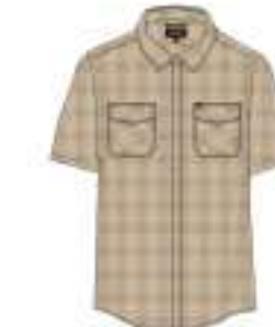
SAND/OFF WHITE 01414-SNDOW