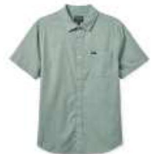
CHINOIS GREEN SOL WASH 01393-CHGSW