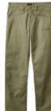
OLIVE SURPLUS 04920-OLVSP