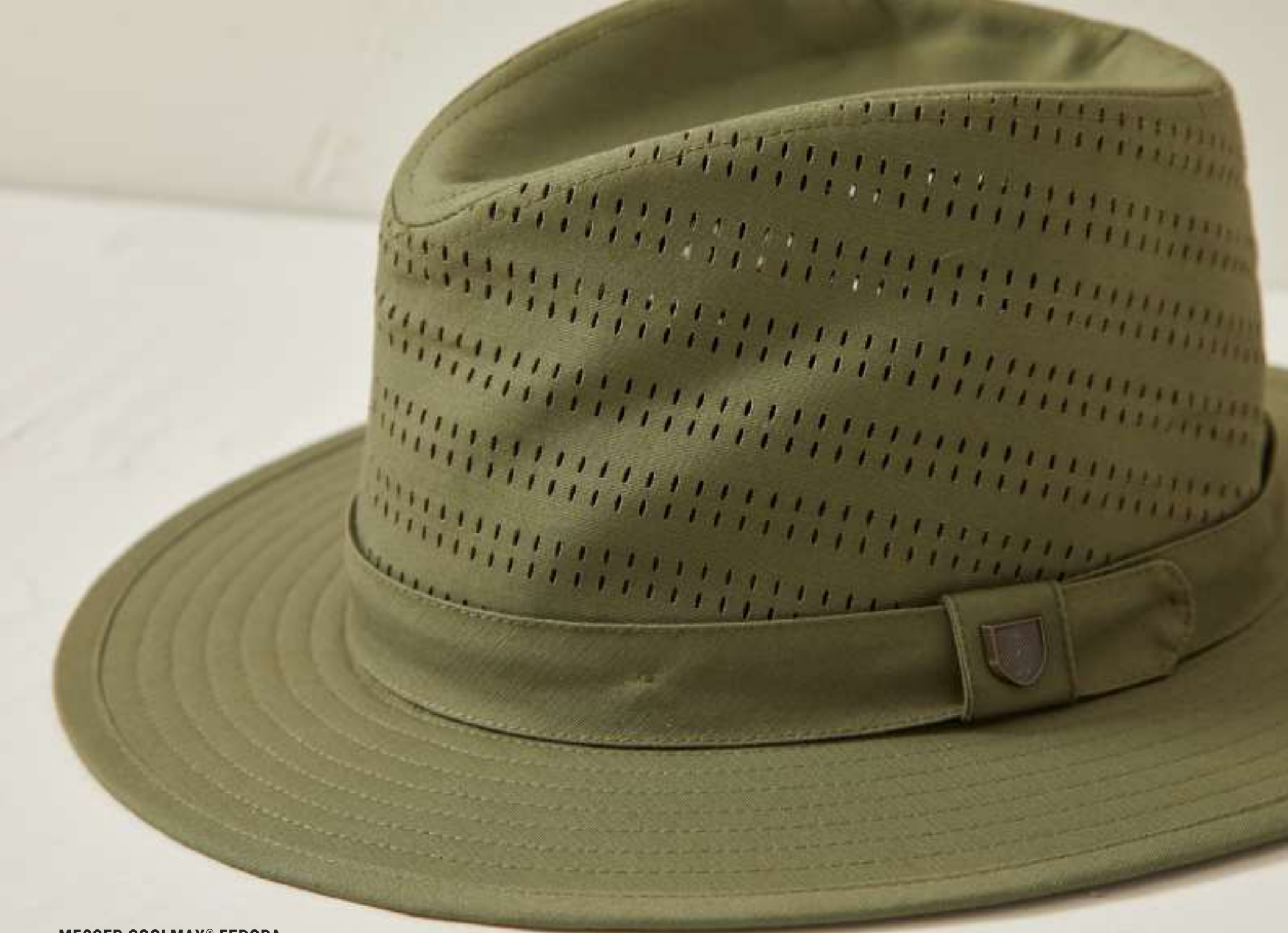
MESSER COOLMAX® FEDORA