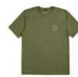
SEA KELP 17092-SEKLP