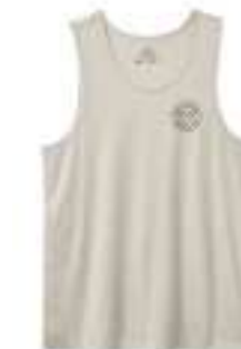
BEIGE/TREKKING GREEN/BLACK 22353-BGTGB