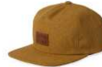
COPPER VINTAGE WASH 11632-CPVWW