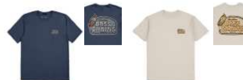
WASHED NAVY 17137-WANAV