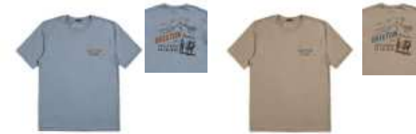
DUSTY BLUE 17087-DUSBL