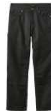
*WASHED BLACK 04920-WABLK