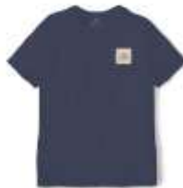
WHITE/WASHED NAVY/SEPIA 16428-WTWN