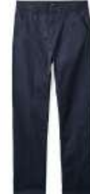
WASHED NAVY 04871-WANAV