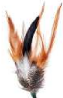
*BURNT ORANGE/BLACK/MAHOGANY 05515-BTOBM