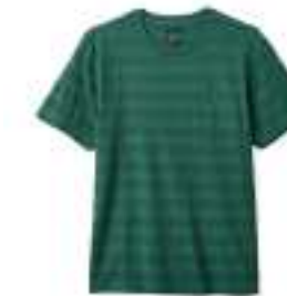
TREKKING GREEN 22601-TRKGN