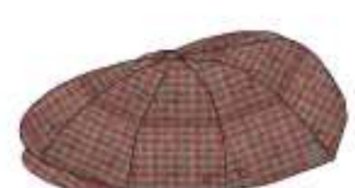
CRANBERRY JUICE/SEPIA 11638-CRJSP