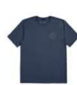
WASHED NAVY/CHINOIS GREEN/ACACIA 16493-WNCGA