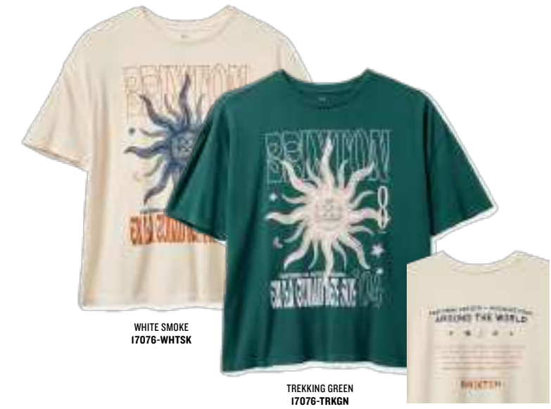
WHITE SMOKE 17076-WHTSK