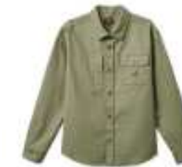
OLIVE SURPLUS 01368-OLVSP