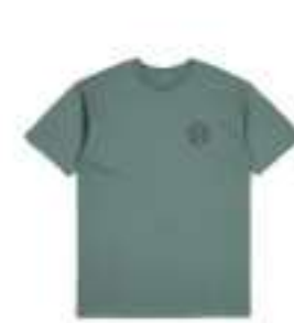
CHINOIS GREEN/WASHED NAVY/SEPIA 16493-CGWNS