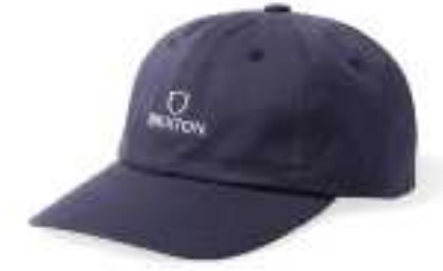
WASHED NAVY VINTAGE WASH 10731-WNVW