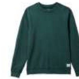
TREKKING GREEN SOL WASH 22593-TKGSW