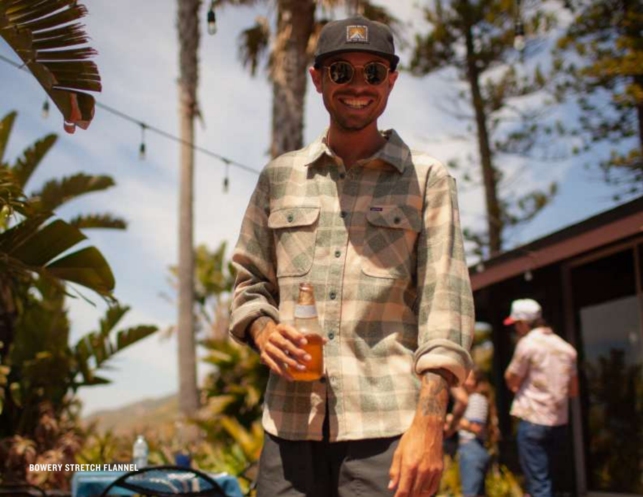
BOWERY STRETCH FLANNEL