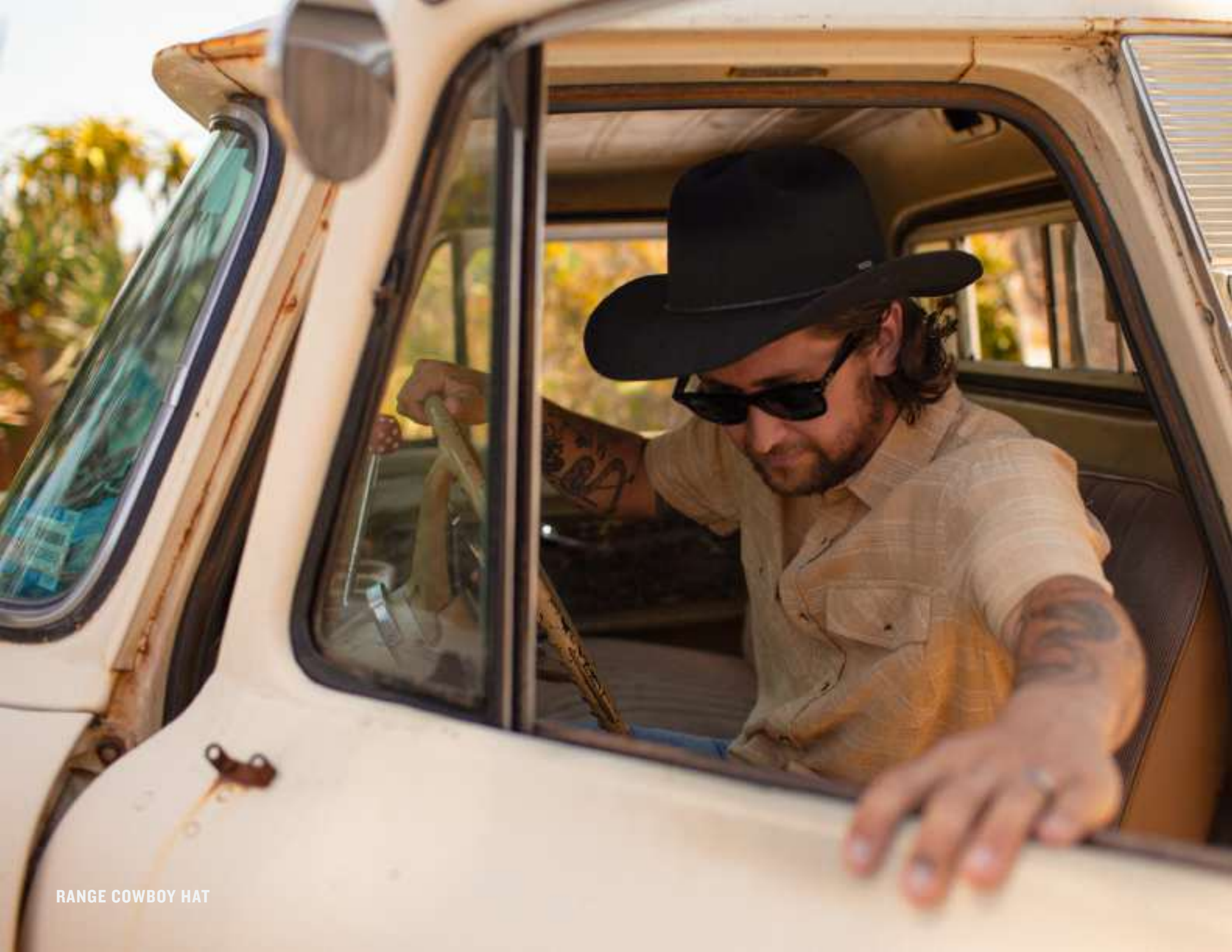
RANGE COWBOY HAT