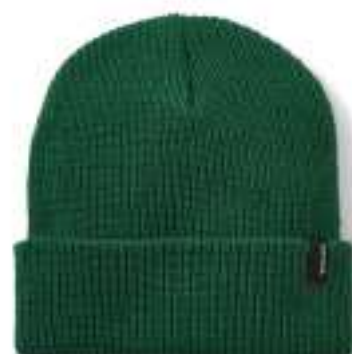
*HUNTER GREEN 10782-HUNTG