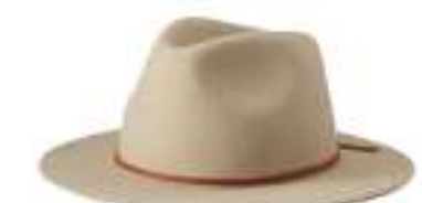
*LIGHT TAN 10761-LTTAN