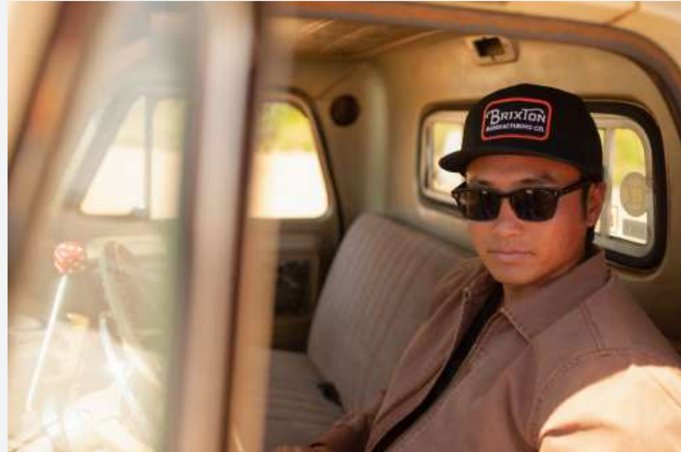
GRADE TRUCKER HAT