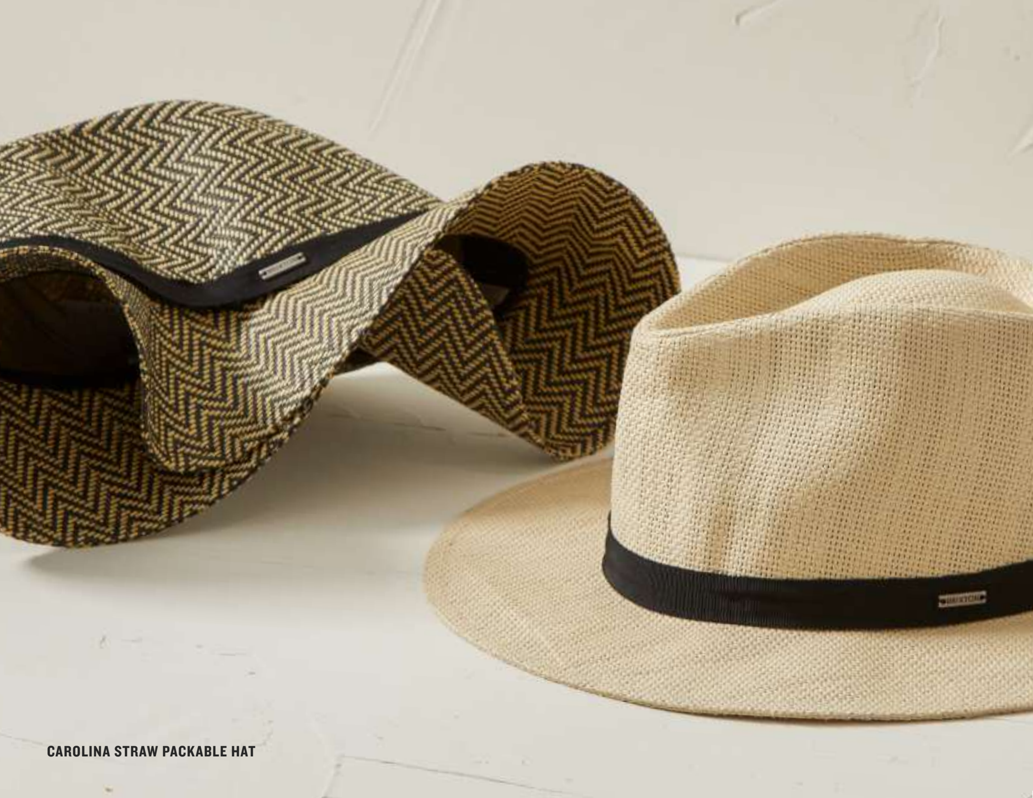
CAROLINA STRAW PACKABLE HAT