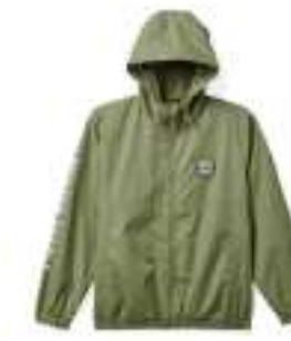
OLIVE SURPLUS 03292-OLVSP