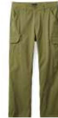
OLIVE SURPLUS 04966-OLVSP