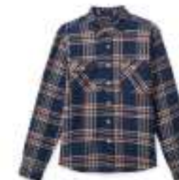
WASHED NAVY/OFF WHITE/TERRACOTTA 01213-WHNOT