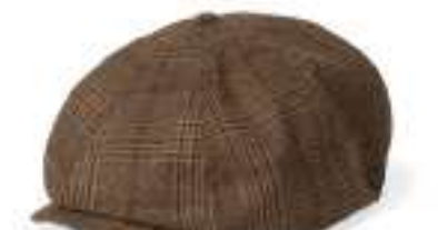
SAND/OAT MILK 11638-SNDOM