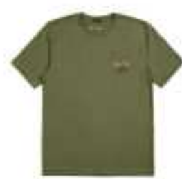
SEA KELP 17089-SEKLP