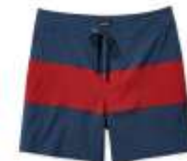
WASHED NAVY/CRANBERRY JUICE 04961-WHNCJ