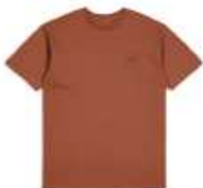
TERRACOTTA/WASHED BLACK 16428-TRCWB