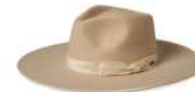
WHITECAP SATIN 11209-WHCPS