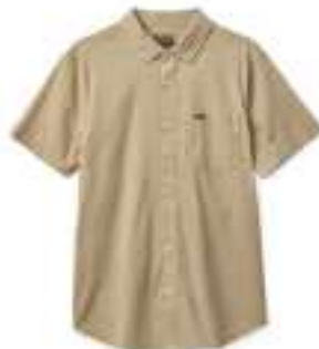
OAT MILK SOL WASH 01393-OTMSW