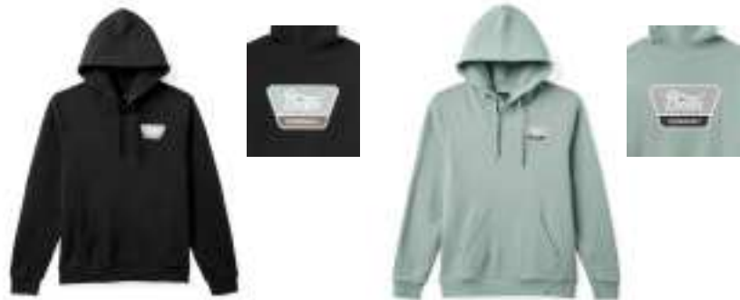
BLACK/CHINOIS GREEN/SEPIA 22337-BKCGS