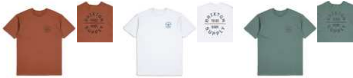
TERRACOTTA/WASHED BLACK/CRANBERRY JUICE 16410-TRWBC