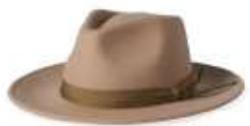
OAT MILK/KHAKI 11453-OTMKH