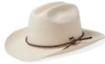
OFF WHITE 11647-OFFWH