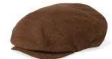
BROWN/LIGHT BROWN 11023-BWNLB