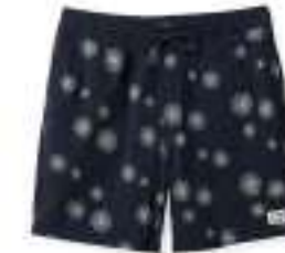
WASHED NAVY SOL 16": 04930-WHNVS 18": 04942-WHNVS