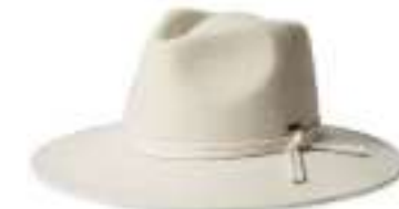
*OFF WHITE 10628-OFFWH