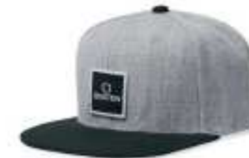
*HEATHER GREY/BLACK 11199-HTGBK