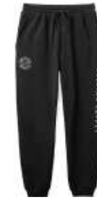
BLACK/CHINOIS GREEN/WHITE 04918-BKCGW