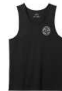
BLACK/APRICOT CRUSH/WHITE 22353-BKACW