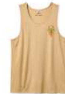
OAT MILK 22598-OATMK