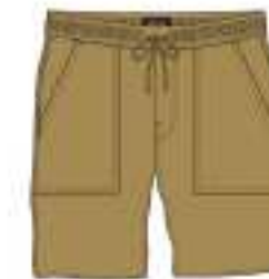
OLIVE SURPLUS 04959-OLVSP