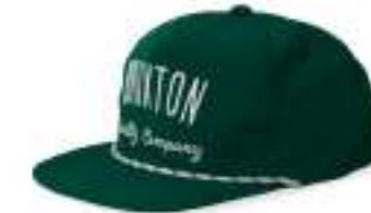
TREKKING GREEN 11631-TRKGN