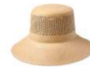
CATALINA SAND 11532-CATSD