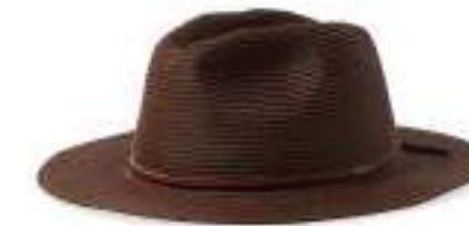
*DARK EARTH 10823-DKEAR