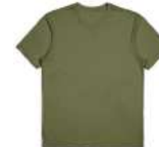
SEA KELP 22097-SEKLP