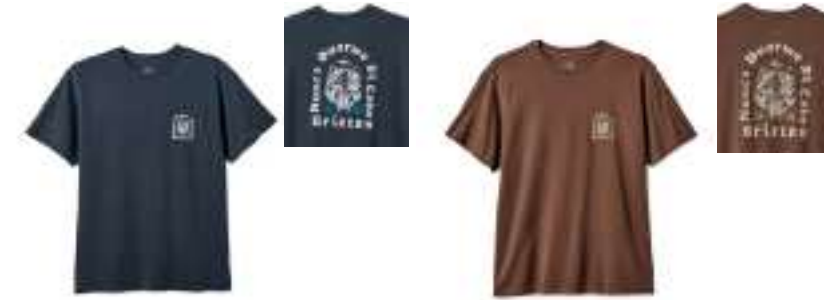
BLACK WORN WASH 17082-BKWOW