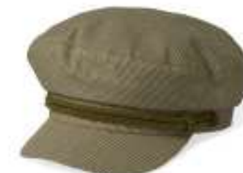
SEA KELP/OAT MILK 10772-SEKOM