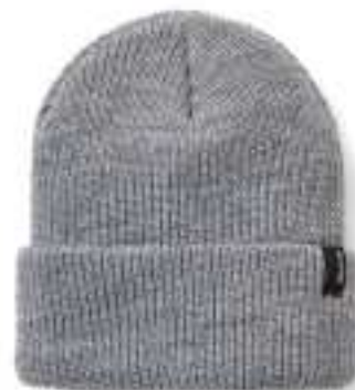
*LIGHT HEATHER GREY 10782-LHTGY