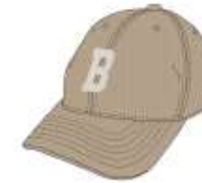
SAND CORD 11158-SNDCD