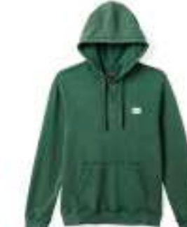
TREKKING GREEN SOL WASH 22594-TKGSW