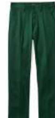
TREKKING GREEN 04888-TRKGN