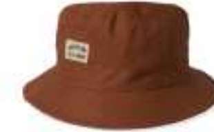
TERRACOTTA SOL WASH 11619-TRTSW