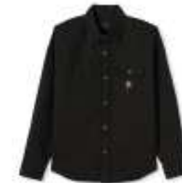
*WASHED BLACK 01368-WABLK