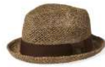
TAN/BROWN SEAGRASS 10767-TNBR