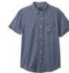
WASHED NAVY/WHITE TILE 01218-WNVWT