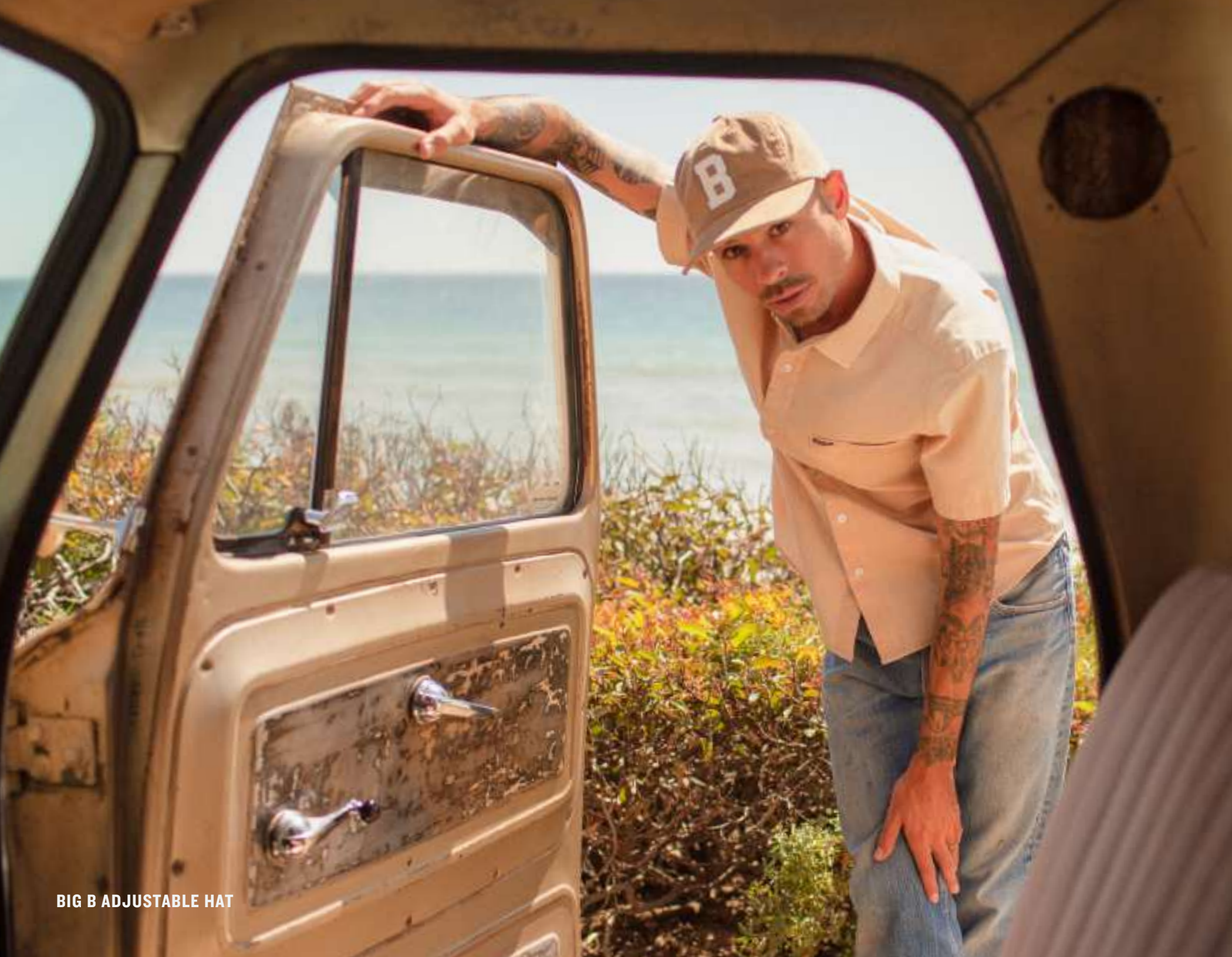
BIG B ADJUSTABLE HAT