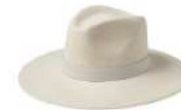
PANAMA WHITE 11530-PANWT