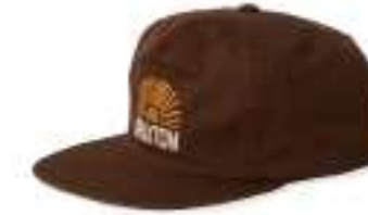
BROWN SOL WASH 11629-BWNSW