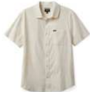
OFF WHITE 01217-OFFWH