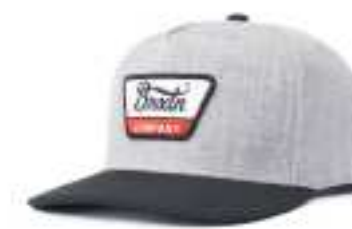
HEATHER GREY/BLACK 10980-HTGBK