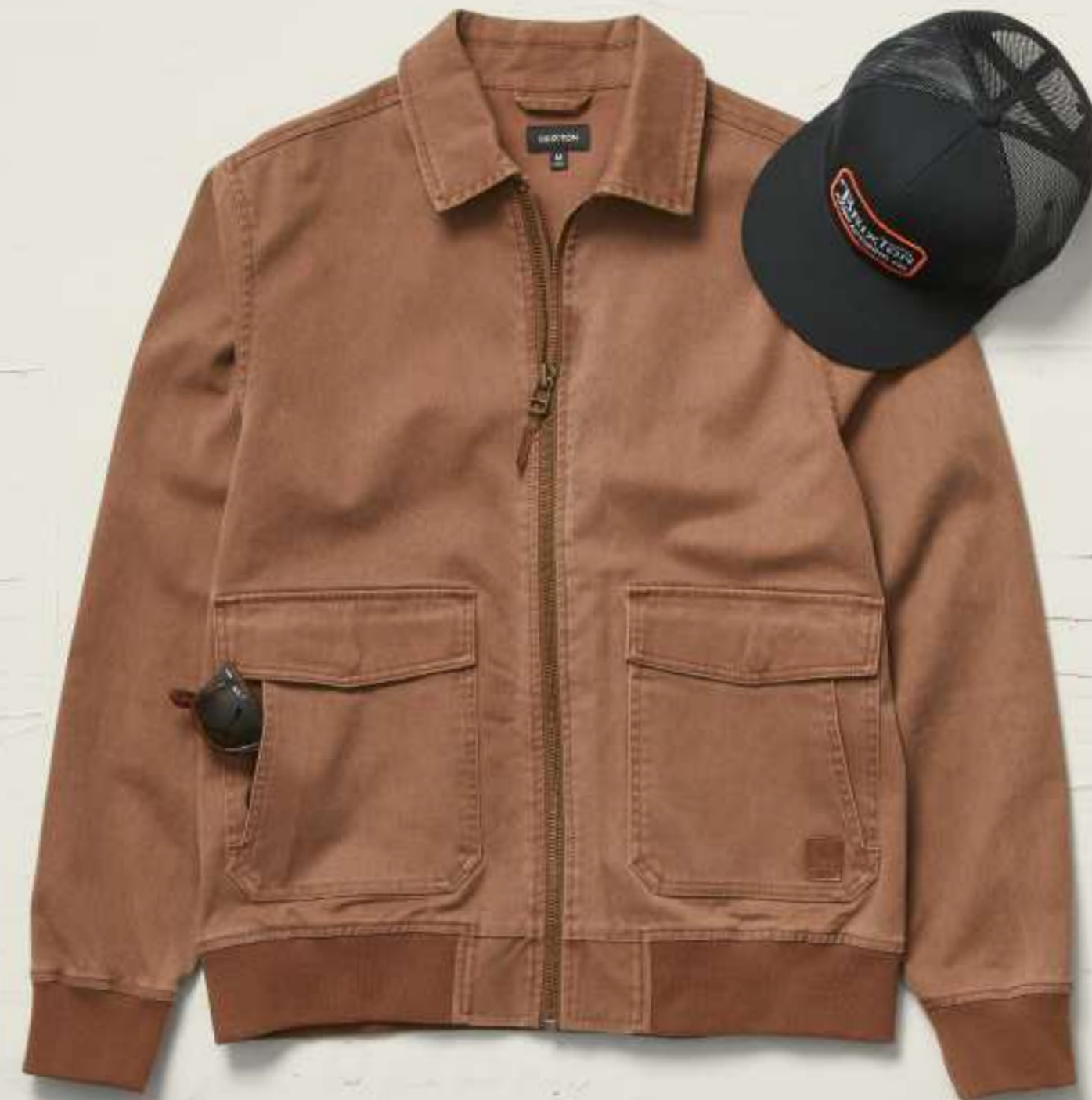
DILLINGER STATION JACKET