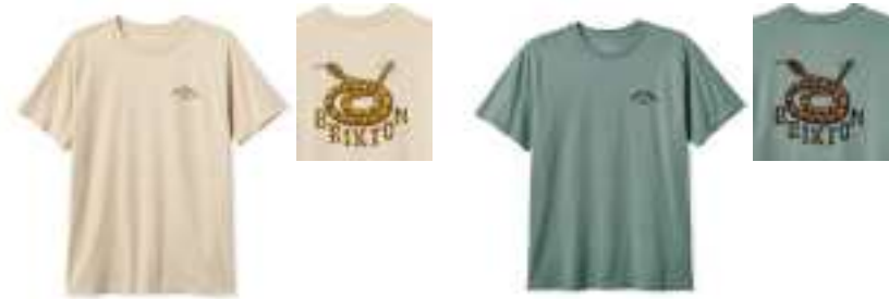
CREAM CLASSIC WASH 16434-CRMCW