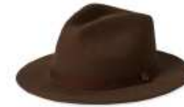
DARK EARTH 10607-DKEAR