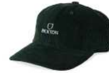
BLACK/WHITE VINTAGE WASH 10731-BKVVW