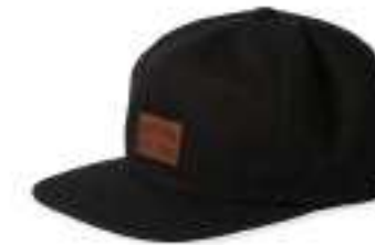
BLACK VINTAGE WASH 11632-BLKVV