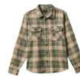
TREKKING GREEN/OATMILK 01364-TKGOM