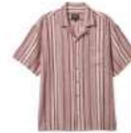
CRANBERRY JUICE/OFF WHITE 01397-CRJOW