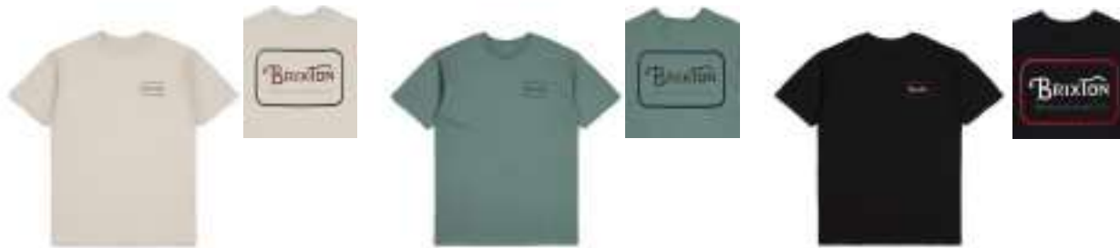
CREAM/TREKKING GREEN/SEPIA 17118-CMTGS