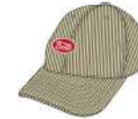
SAND/SEA KELP 11225-SNDSK