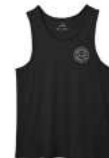
CHINOIS GREEN/WHITE/BLACK 22353-CGWTB