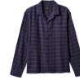
WASHED NAVY/TERRACOTTA 01392-WNTSW