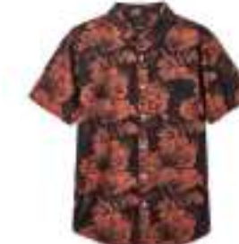
WASHED BLACK/TERRACOTTA FLORAL 01218-WHBTFF