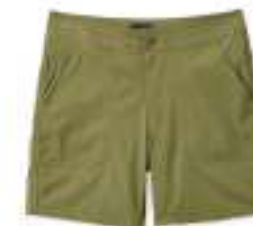
OLIVE SURPLUS 04962-OLVSP