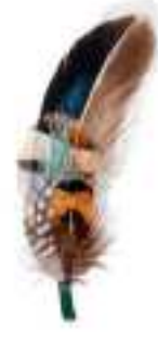
*BISON/MOJAVE/BURNT ORANGE 05515-BSMBO