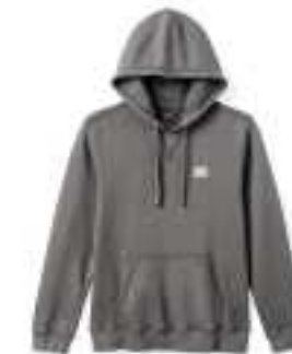
CHARCOAL SOL WASH 22594-CRCWSW