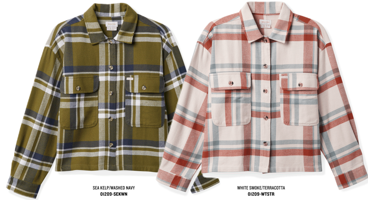
SEA KELP/WASHED NAVY 01209-SEKWN