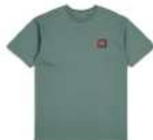
CHINOIS GREEN/CHARCOAL/TERRACOTTA 16428-CHGCT