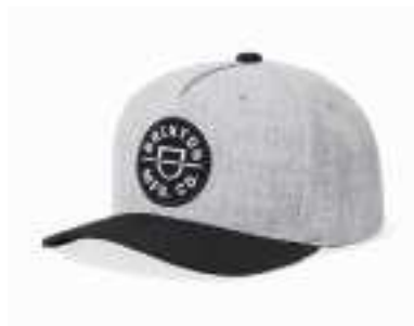
*HEATHER GREY/BLACK 11001-HTGBK