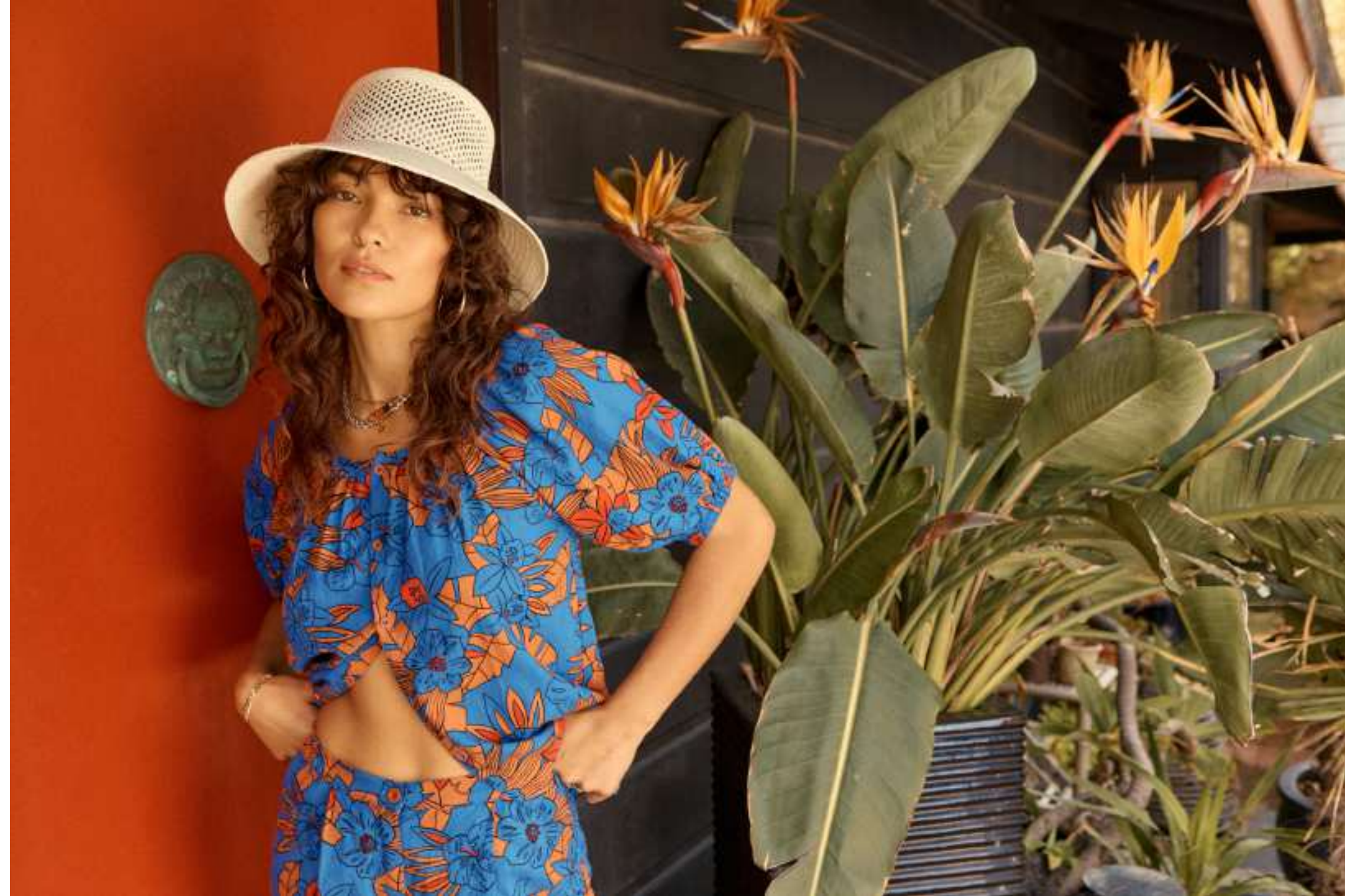
MERCADO LINEN SHIRT