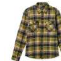
GREEN KELP/SAND/BLACK 01213-GRKSB