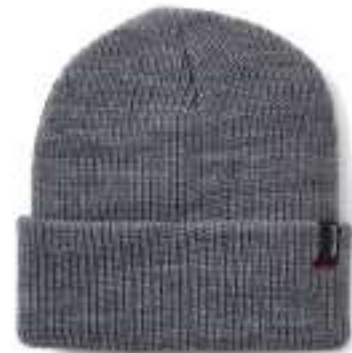
*HEATHER GREY 10782-HTGRY