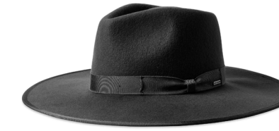
*BLACK SATIN 11209-BLKSN