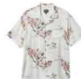
OFF WHITE/MAP 01323-OFWMP