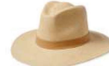
CATALINA SAND 11530-CATSD