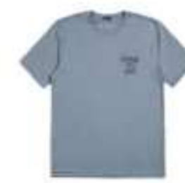
DUSTY BLUE 17093-DUSBL