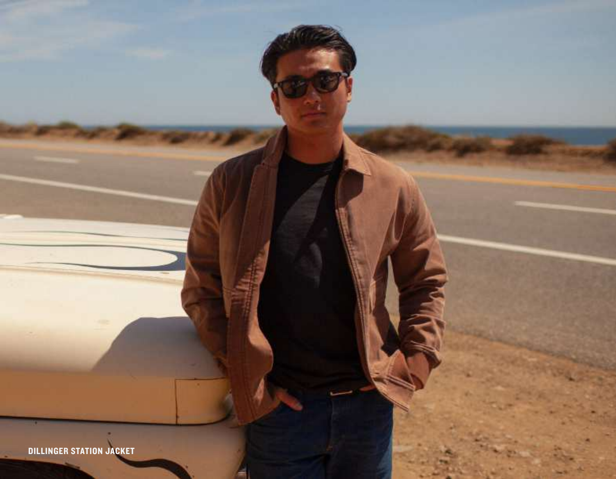
DILLINGER STATION JACKET