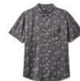
CHARCOAL SOL 01354-CHRC