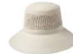
PANAMA WHITE 11532-PANWT