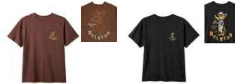
SEPIA WORN WASH 17140-SEPWW