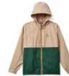
SAND/PINE NEEDLE 03418-SNDPN