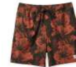
WASHED BLACK/TERRACOTTA FLORAL 16": 04930-WHTF 18": 04942-WHTF