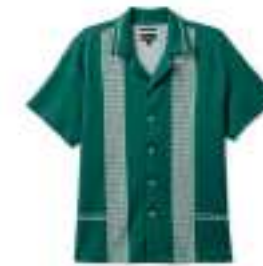
TREKKING GREEN 01398-TRKGN