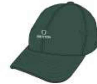
TREKKING GREEN VINTAGE WASH 10731-TKGVW