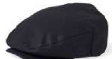
WASHED NAVY 10771-WANAV