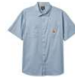
DUSTY BLUE 01394-DUSBL