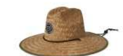
TAN/OLIVE SURPLUS 11026-TNOLS