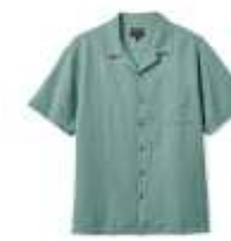
CHINOIS GREEN 01410-CHSGN