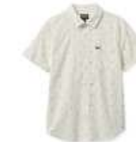
OFF WHITE PYRAMID 01218-OFWPY