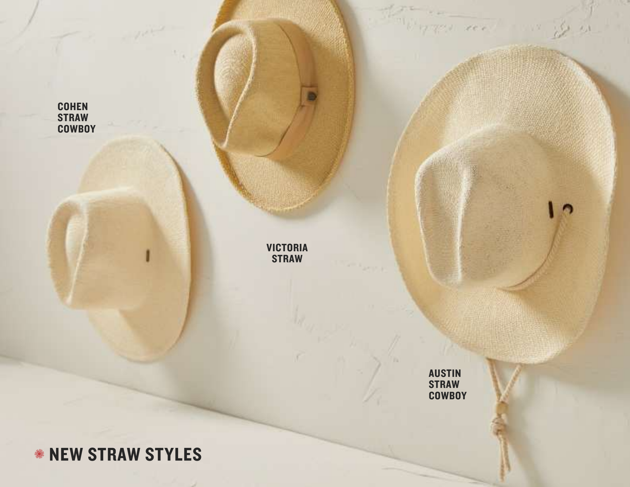
COHEN STRAW COWBOY