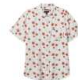
OFF WHITE SOL 01354-OFWSL