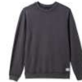
CHARCOAL SOL WASH 22593-CRCWSW