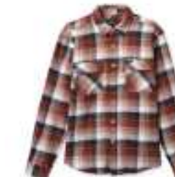
WASHED NAVY/SEPIA/OFF WHITE 01213-WNSOW