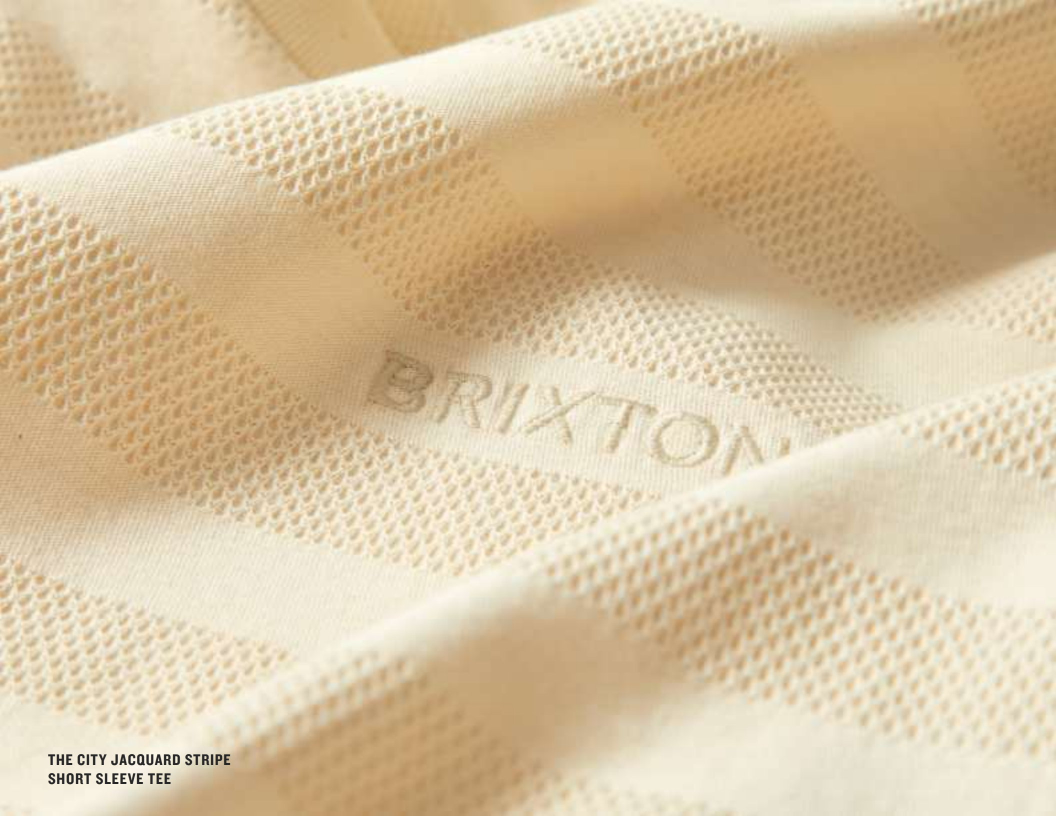
THE CITY JACQUARD STRIPE SHORT SLEEVE TEE