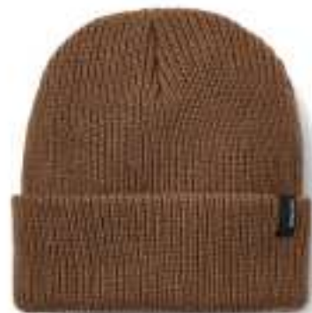
*COYOTE BROWN 10782-COYOT