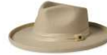
OFF WHITE/OFF WHITE SATIN 11511-OWOWS