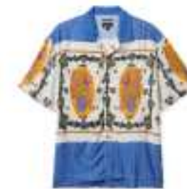
MEXICO CITY JAGUAR 01399-MXCJG