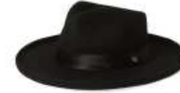
BLACK/BLACK SATIN 11511-BKBLS