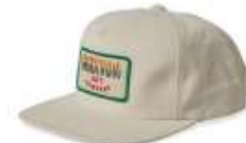
OFF WHITE SOL WASH 11633-OWSLW