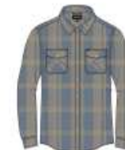
FLINT STONE BLUE/SAND 01415-FLSBS