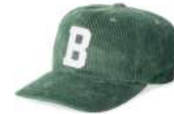
*EMERALD CORD 11158-EMRDC