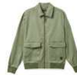
OLIVE SURPLUS 03405-OLSSW