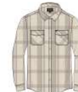
WHITECAP/CINDER GREY 01415-WCCGY