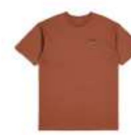
TERRACOTTA/WASHED BLACK/SAND 16172-TRWB