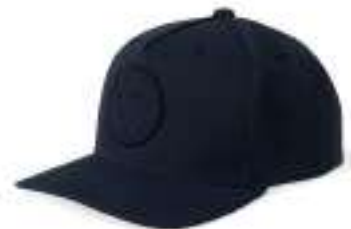
WASHED NAVY/WASHED NAVY 11001-WANWN