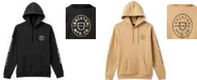
BLACK/CHINOIS GREEN/WHITE 22021-BKCGW