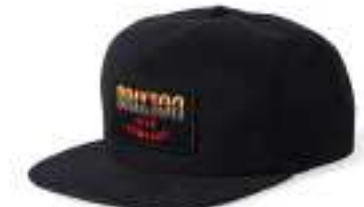
BLACK SOL WASH 11633-BKSWH