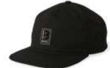
WASHED BLACK 11635-WABLK