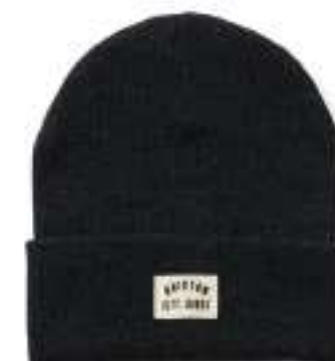
*WASHED BLACK 11508-WABLK