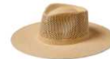
CATALINA SAND 11531-CATSD