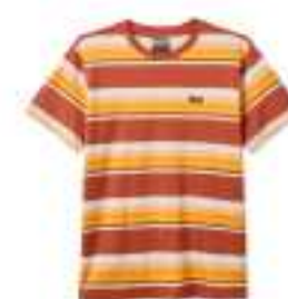
OFF WHITE/SEPIA/KELP GREEN 22616-OWSKP