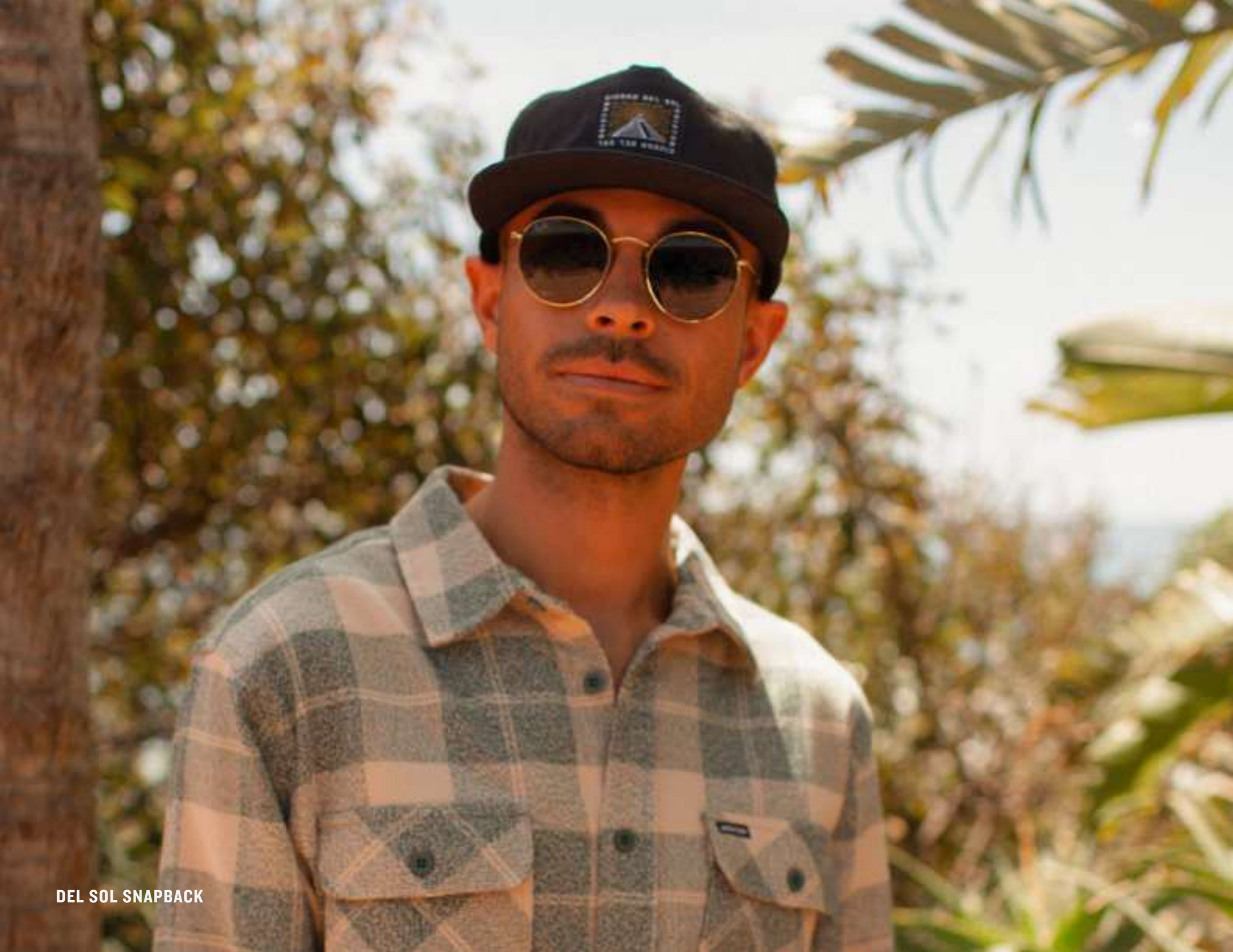
DEL SOL SNAPBACK