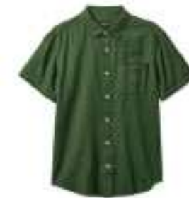
TREKKING GREEN TILE 01218-TRKGT