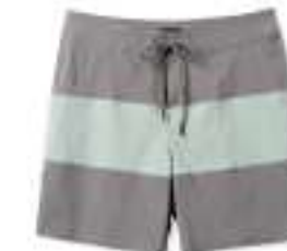
CHARCOAL/CHINOIS GREEN 04961-CHCG