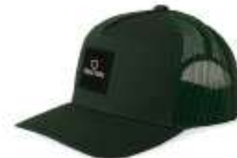
TREKKING GREEN/TREKKING GREEN 10867-TKGTG