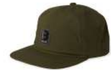
OLIVE SURPLUS 11635-OLVSP