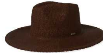
DARK EARTH 11613-DKEAR