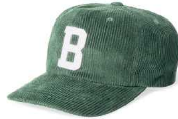
*EMERALD CORD 11158-EMRDC