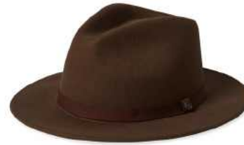
DARK EARTH 10607-DKEAR