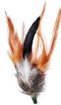
*BURNT ORANGE/BLACK/MAHOGANY 05515-BTOBM