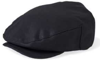
WASHED NAVY 10771-WANAV