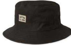
BLACK SOL WASH 11619-BKSWH