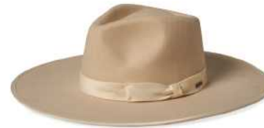
WHITECAP SATIN 11209-WHCPS