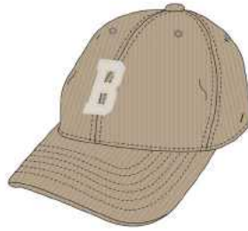
SAND CORD 11158-SNDCC