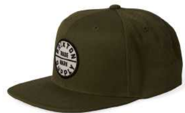
OLIVE SURPLUS/WHITECAP 10777-OLSWC