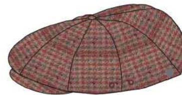
CRANBERRY JUICE/SEPIA 11638-CRJSP