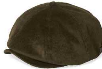
MOSS GREEN 10770-MSGRN