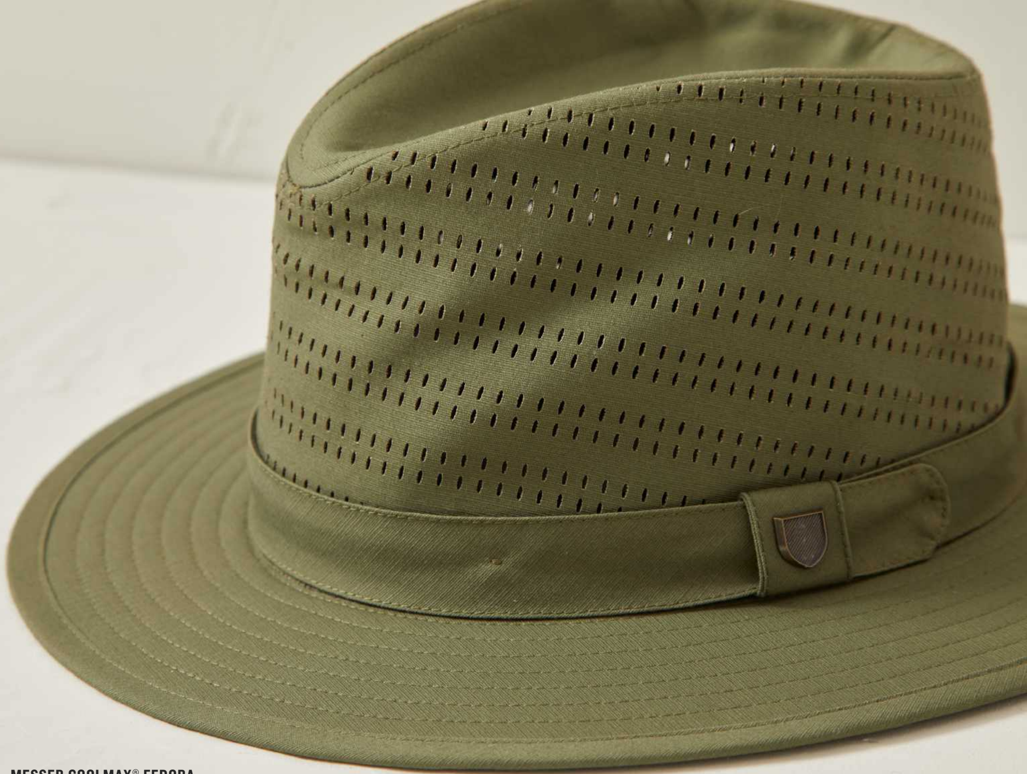
MESSER COOLMAX® FEDORA