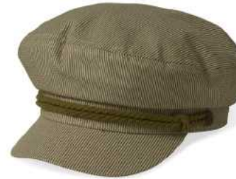
SEA KELP/OAT MILK 10772-SEKOM