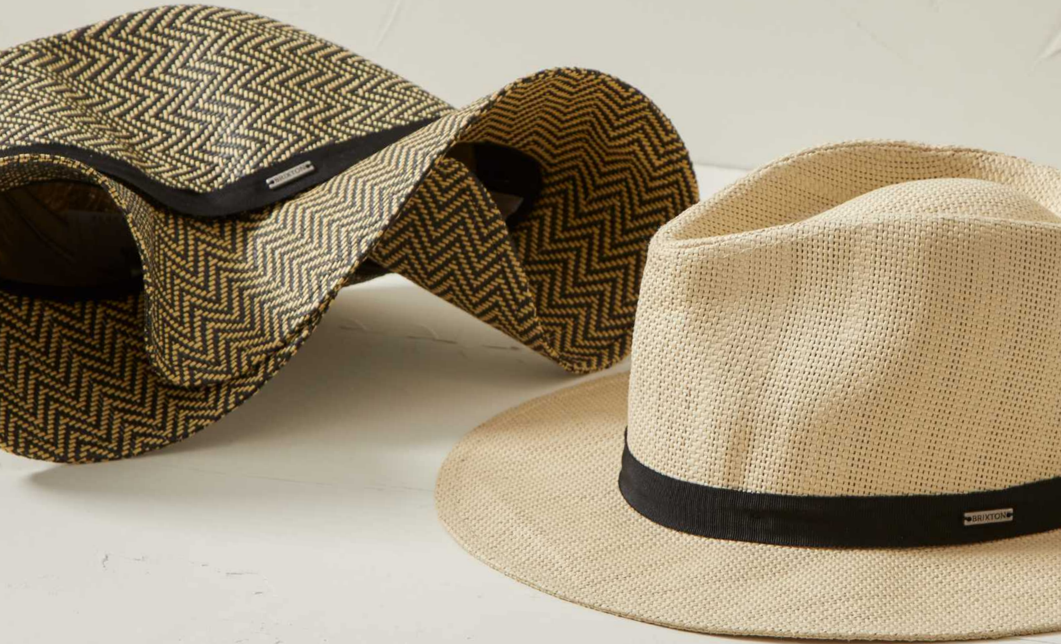
CAROLINA STRAW PACKABLE HAT