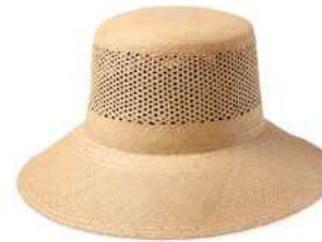
CATALINA SAND 11532-CATSD