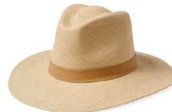
CATALINA SAND 11530-CATSD