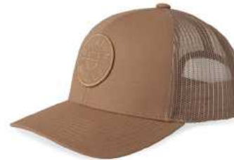
OAT MILK/OAT MILK 10921-OAMOM