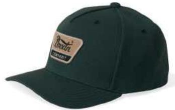
TREKKING GREEN/SAND 10980-TKGSD