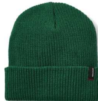
*HUNTER GREEN 10782-HUNGT