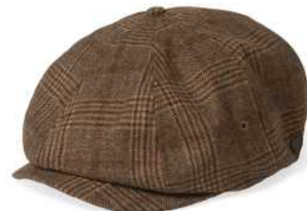
SAND/OAT MILK 11638-SNDOM