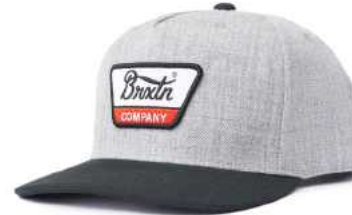
HEATHER GREY/BLACK 10980-HTGBK