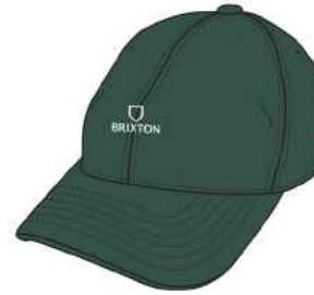
TREKKING GREEN VINTAGE WASH 10731-TKGVW