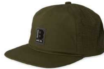
OLIVE SURPLUS 11635-OLVSP