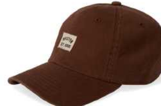
SEPIA VINTAGE WASH 11588-SEPVW