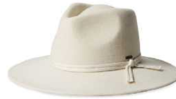
*OFF WHITE 10628-OFFWH