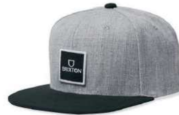
*HEATHER GREY/BLACK 11199-HTGBK