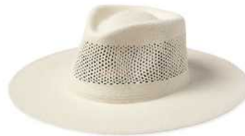
PANAMA WHITE 11531-PANWT