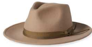
OAT MILK/KHAKI 11453-OTMKH