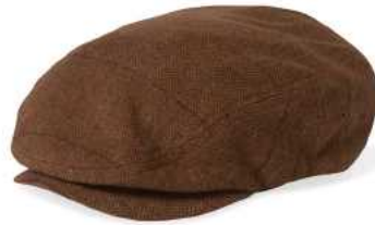
BROWN/LIGHT BROWN 11023-BWNLB