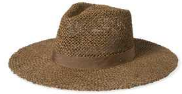
$40/$80 TAN/TAN SEAGRASS 10784-TNTNS