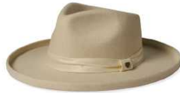
OFF WHITE/OFF WHITE SATIN 11511-OWOWS