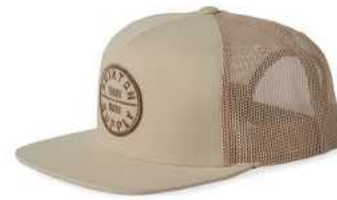
OAT MILK/OAT MILK 11627-OAMOM