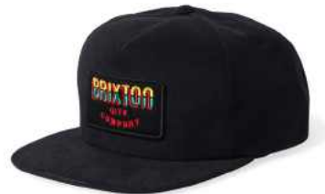
BLACK SOL WASH 11633-BKSWH