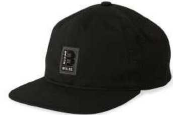
WASHED BLACK 11635-WABLK