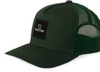
TREKKING GREEN/TREKKING GREEN 10867-TKGTG