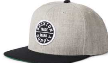
*LIGHT HEATHER GREY/BLACK 10777-LHGBK