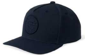
WASHED NAVY/WASHED NAVY 11001-WANWN