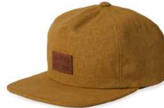
COPPER VINTAGE WASH 11632-CPVWW