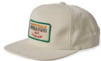
OFF WHITE SOL WASH 11633-OWSLW