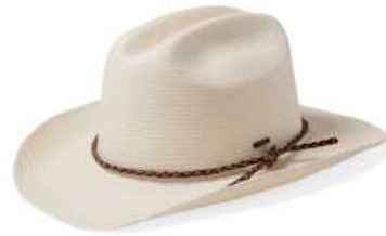
OFF WHITE 11647-OFFWH