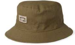
SAND SOL WASH 11619-SNDSW