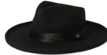
BLACK/BLACK SATIN 11511-BKBLS