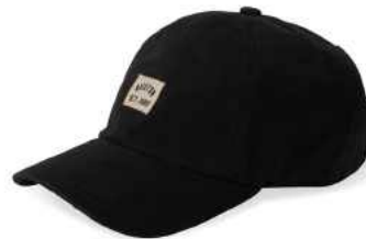
*BLACK VINTAGE WASH 11588-BLKVVW