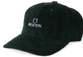
BLACK/WHITE VINTAGE WASH 10731-BKVVW