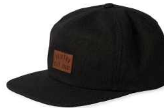
BLACK VINTAGE WASH 11632-BLKVW