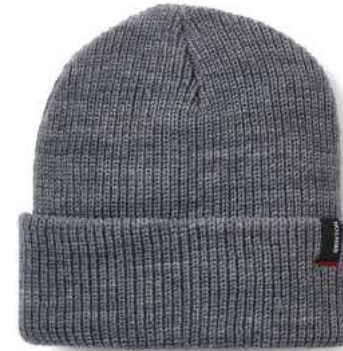
*HEATHER GREY 10782-HTGRY