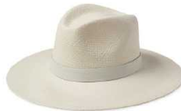
PANAMA WHITE 11530-PANWT