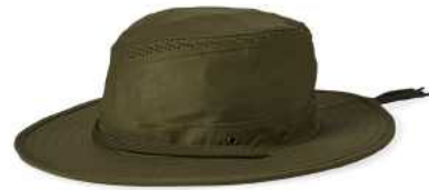
OLIVE SURPLUS 11648-OLVSP