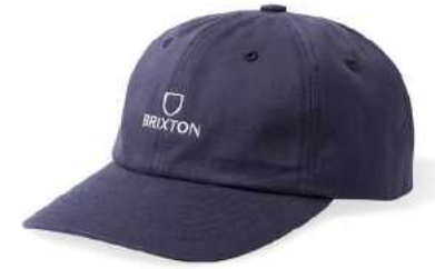
WASHED NAVY VINTAGE WASH 10731-WHNVW