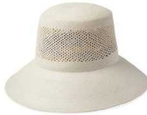
PANAMA WHITE 11532-PANWT