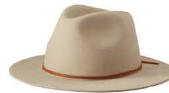
*LIGHT TAN 10761-LTTAN