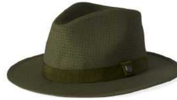
OLIVE SURPLUS 11617-OLVSP