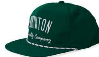
TREKKING GREEN 11631-TRKGN