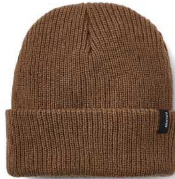
*COYOTE BROWN 10782-COYOT