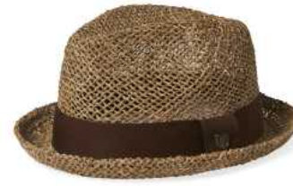
TAN/BROWN SEAGRASS 10767-TNBR