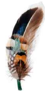
*BISON/MOJAVE/BURNT ORANGE 05515-BSMBO