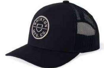
WASHED NAVY/NAVY 10921-WSNVY