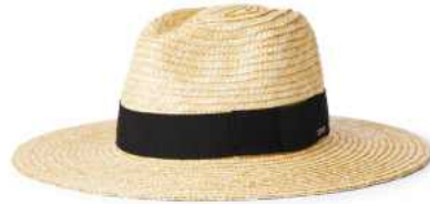
$35/$70 HONEY 10784-HONEY