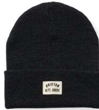
*WASHED BLACK 11508-WABLK