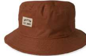
TERRACOTTA SOL WASH 11619-TRTSW