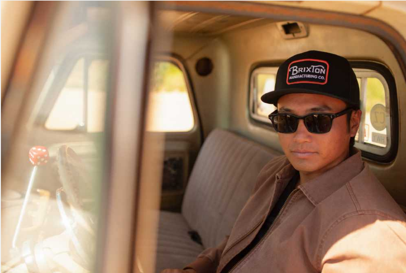
GRADE TRUCKER HAT