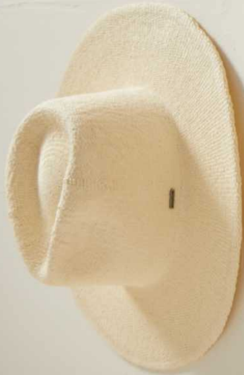
COHEN STRAW COWBOY