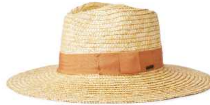
$35/$70 HONEY/LION 10784-HONLN