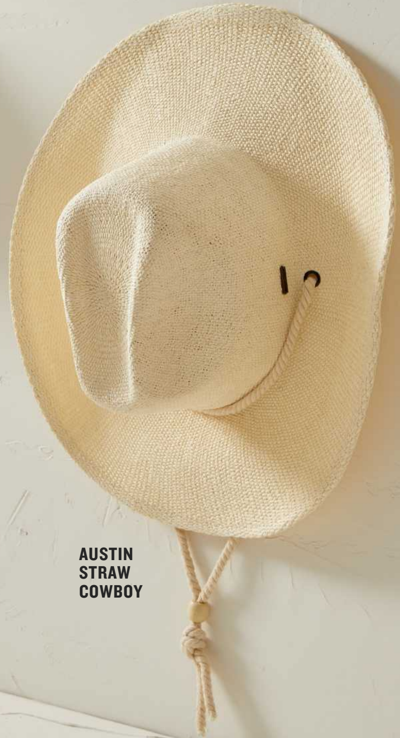
AUSTIN STRAW COWBOY