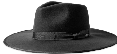
*BLACK SATIN 11209-BLKSN