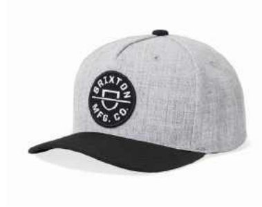
*HEATHER GREY/BLACK 11001-HTGBK