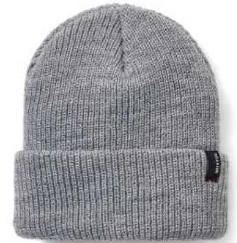
*LIGHT HEATHER GREY 10782-LHTGY