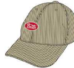
SAND/SEA KELP 11225-SNDSK