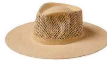
CATALINA SAND 11531-CATSD