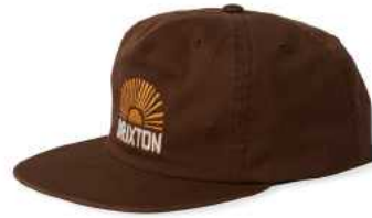
BROWN SOL WASH 11629-BWNSW