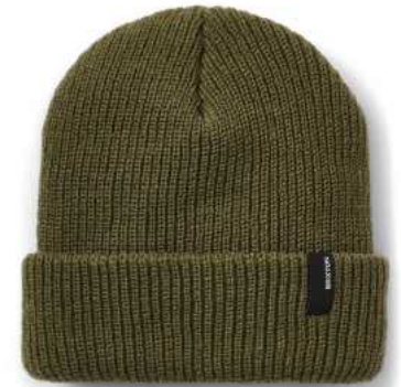
*MILITARY OLIVE 10782-MIOL