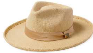
NATURAL/OAT MILK 11621-NTLOM