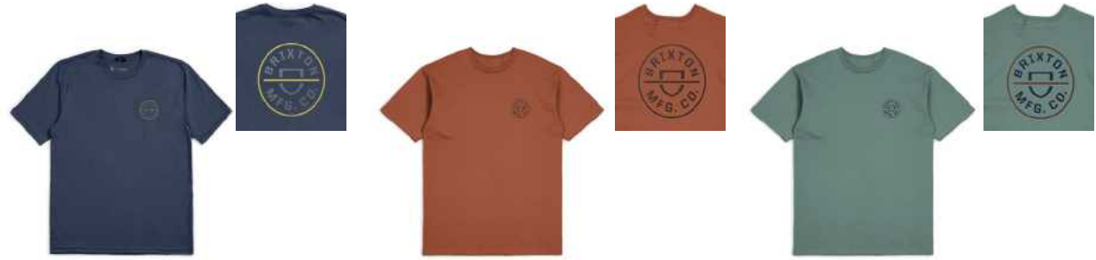
WASHED NAVY/CHINOIS GREEN/ACACIA 16493-WNCGA