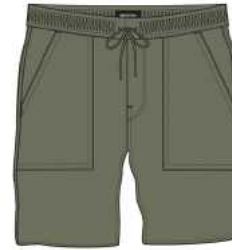
OLIVE SURPLUS 04959-OLVSP