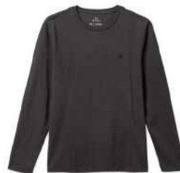
BLACK SOL WASH 22498-BKSWH