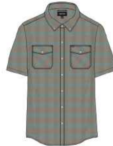
CHINOIS GREEN/RED CLAY 01414-CHGRC