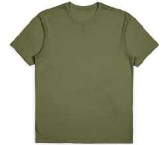
SEA KELP 22097-SEKLP