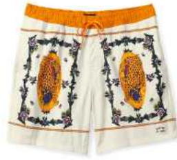
MEXICO CITY JAGUAR 16": 04930-MXCJG 18": 04942-MXCJG