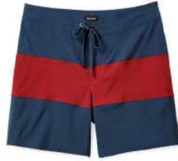
WASHED NAVY/CRANBERRY JUICE 04961-WHNCJ