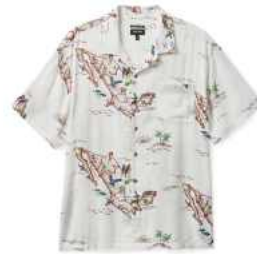
OFF WHITE/MAP 01323-OFWMP