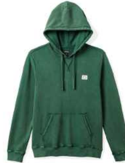
TREKKING GREEN SOL WASH 22594-TKGSW