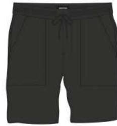
WASHED BLACK 04959-WABLK