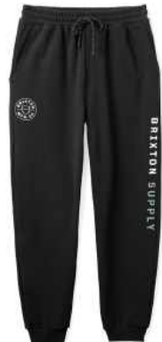
BLACK/CHINOIS GREEN/WHITE 04918-BKCGW