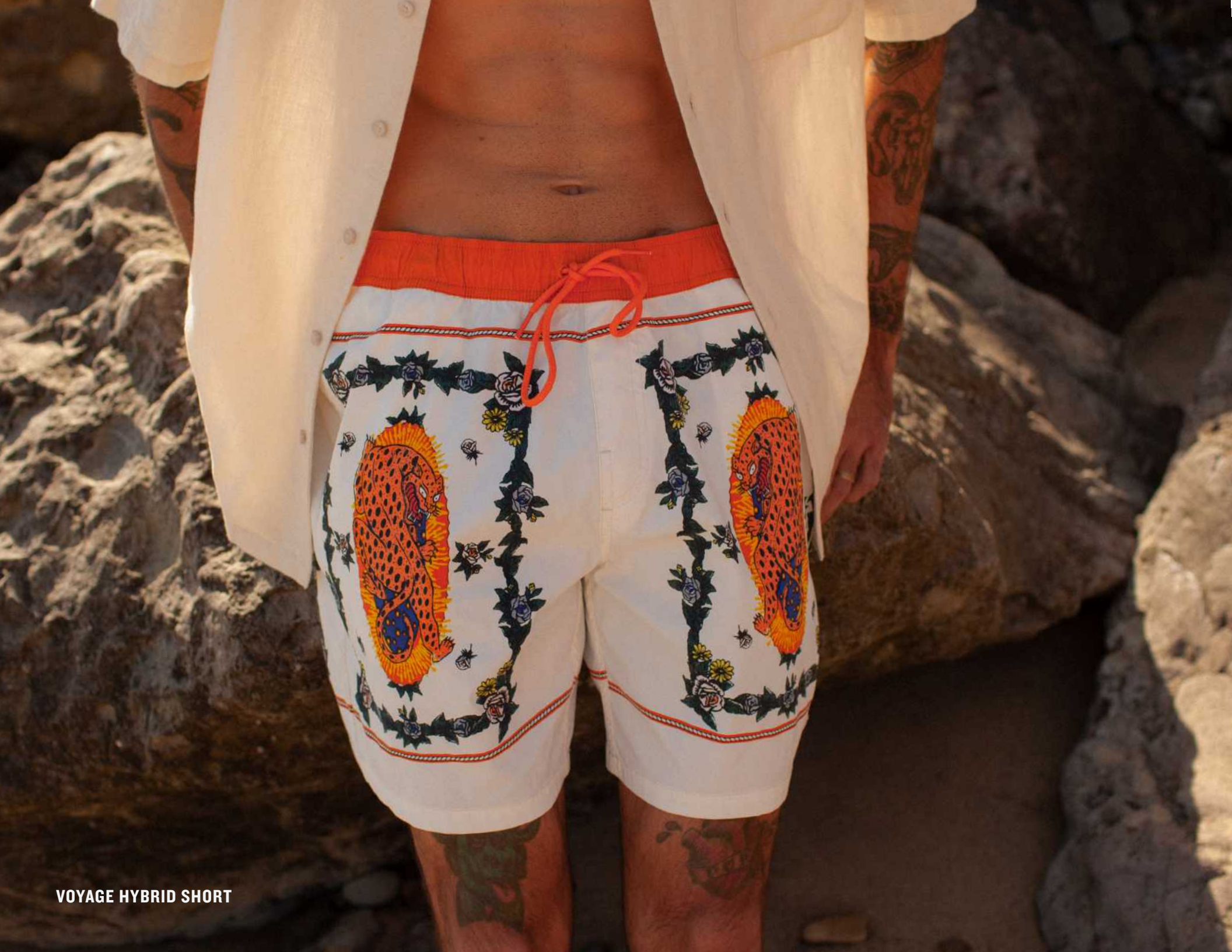
VOYAGE HYBRID SHORT