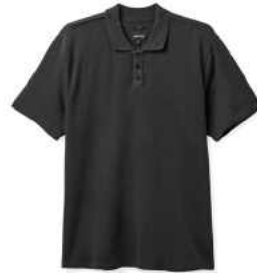
WASHED BLACK 22600-WABLK