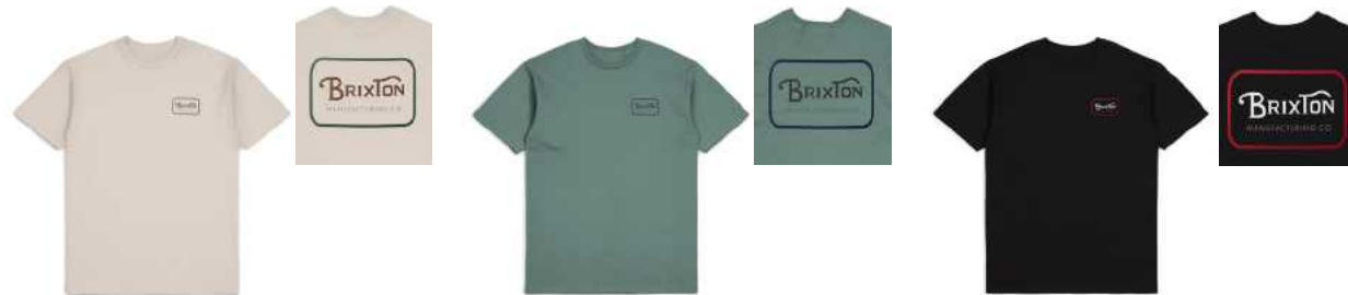
CREAM/TREKKING GREEN/SEPIA 17118-CMTGS