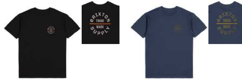
BLACK/WHITECAP/PERSIMMON ORANGE 16410-BKWPO