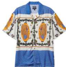
MEXICO CITY JAGUAR 01399-MXCJG