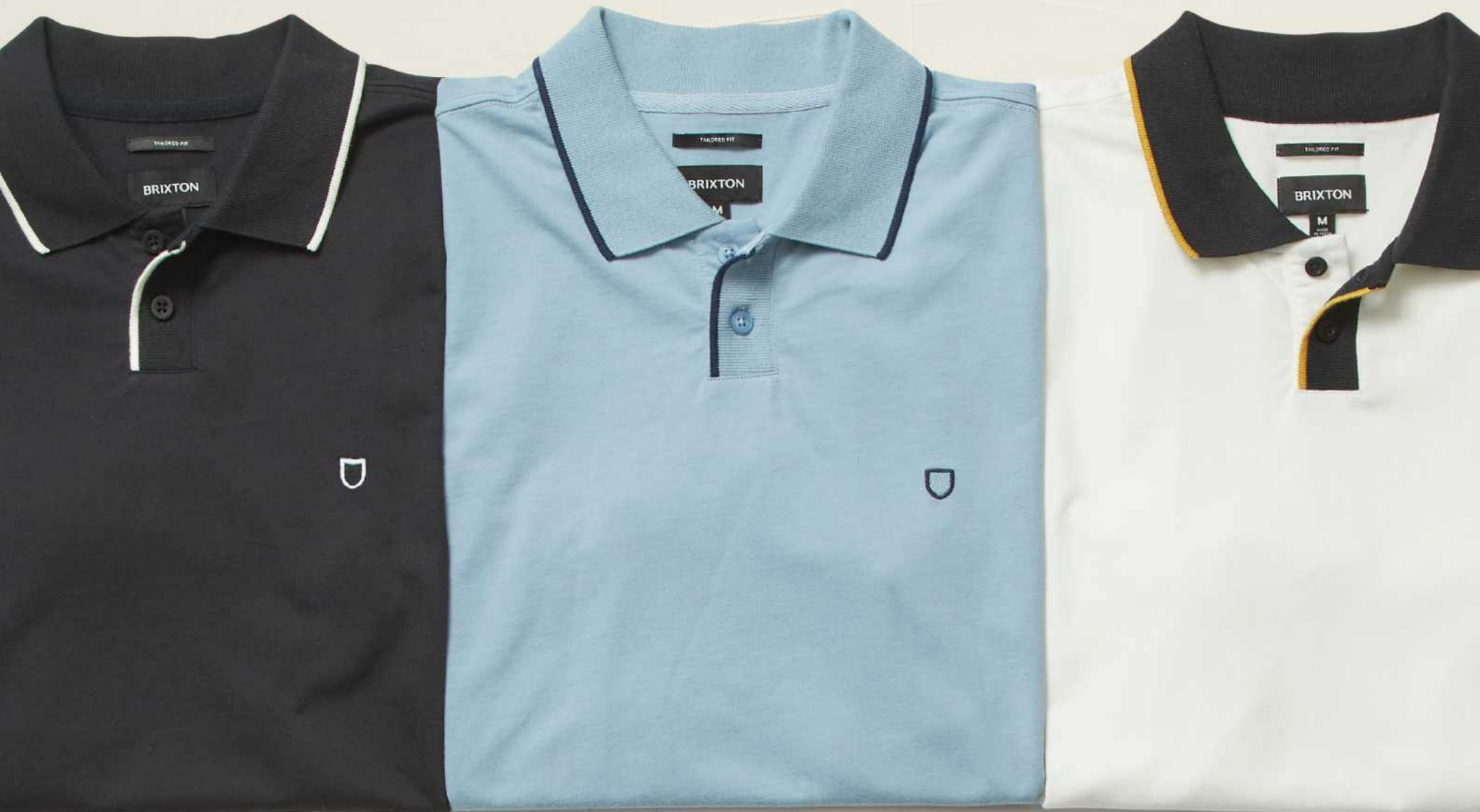
MOD FLEX POLO