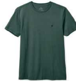
TREKKING GREEN SOL WASH 22497-TKGSW