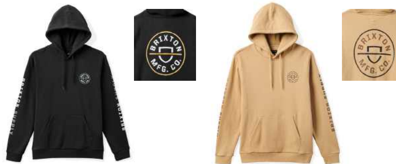
BLACK/CHINOIS GREEN/WHITE 22021-BKCGW