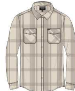
WHITECAP/CINDER GREY 01415-WCCGY