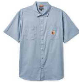
DUSTY BLUE 01394-DUSBL