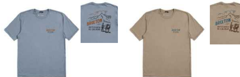
DUSTY BLUE 17087-DUSBL