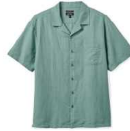
CHINOIS GREEN 01410-CHSGN