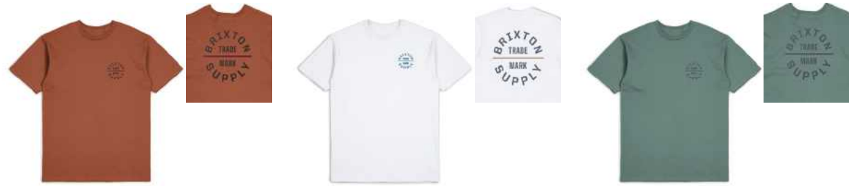
TERRACOTTA/WASHED BLACK/CRANBERRY JUICE 16410-TRWBC