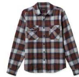
WASHED NAVY/DUSTY BLUE 01391-WHND8