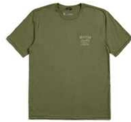
SEA KELP 17092-SEKLP