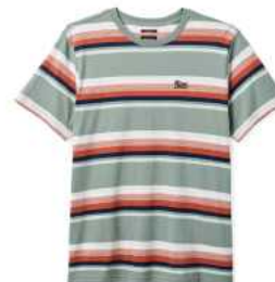
CHINOIS GREEN/TERRACOTTA/OFF WHITE 22616-CGTOW