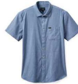
LIGHT BLUE CHAMBRAY 01217-LBLCH