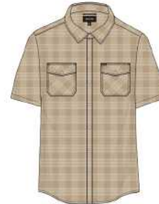
SAND/OFF WHITE 01414-SNDOW