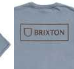
WHITE/TERRACOTTA/WASHED NAVY 16450-WHTWN