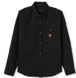
*WASHED BLACK 01368-WABLK