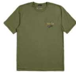
SEA KELP 17089-SEKLP