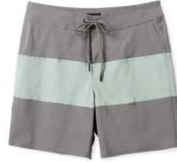
CHARCOAL/CHINOIS GREEN 04961-CHCG