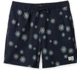
WASHED NAVY SOL 16": 04930-WHNVS 18": 04942-WHNVS