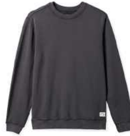
CHARCOAL SOL WASH 22593-CRCSW