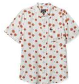
OFF WHITE SOL 01354-OFWSL