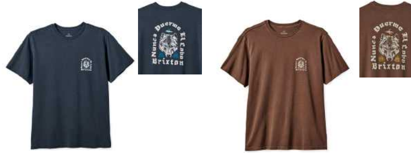
BLACK WORN WASH 17082-BKWOW