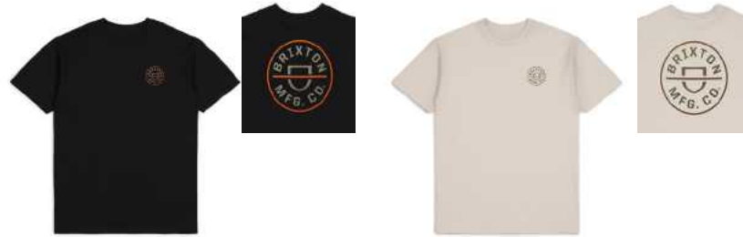
BLACK/PERSIMMON ORANGE/SAND 16493-BLPOS