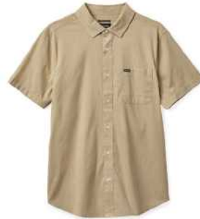
OAT MILK SOL WASH 01393-OTMSW