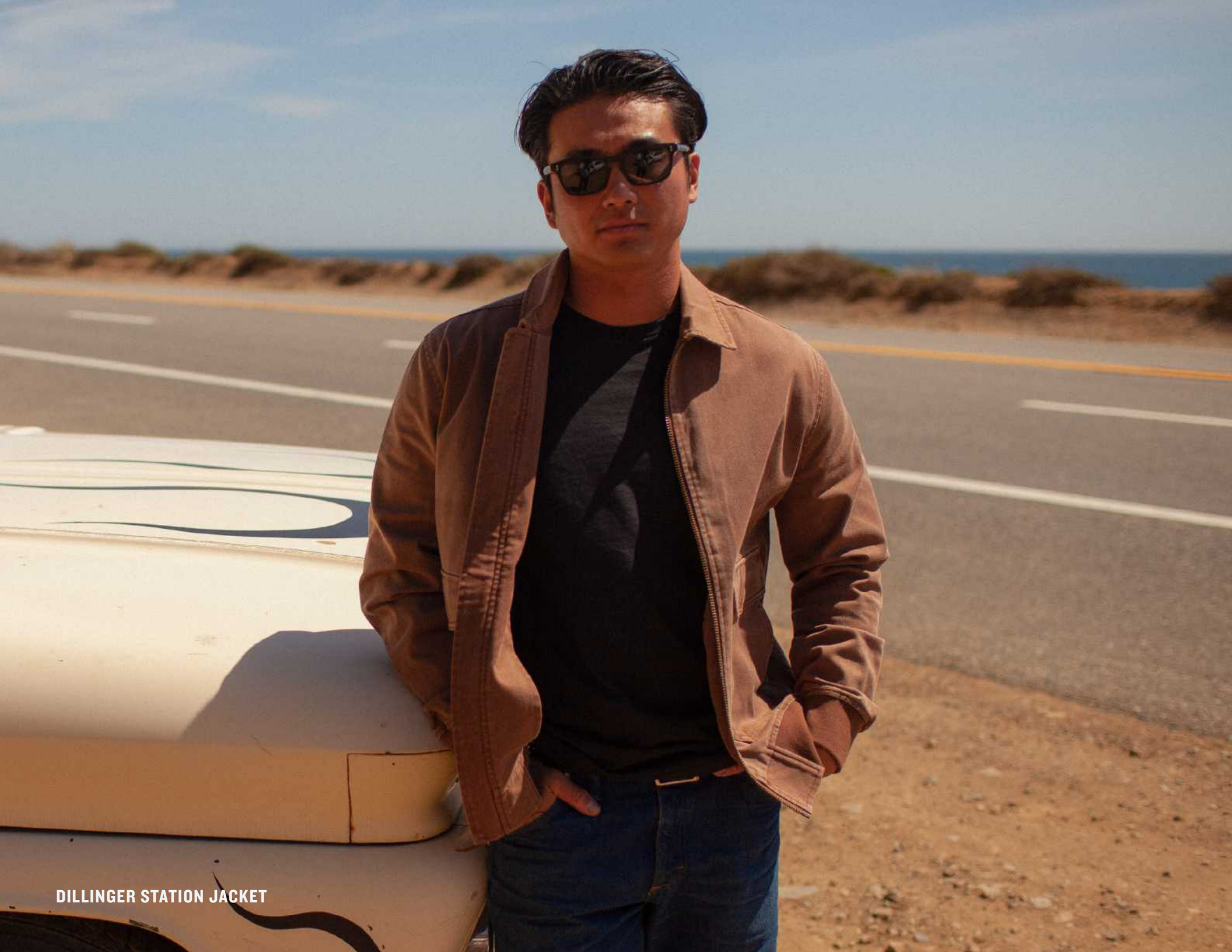
DILLINGER STATION JACKET