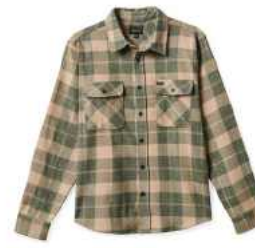
TREKKING GREEN/OATMILK 01364-TKGOM