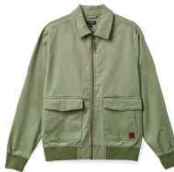
OLIVE SURPLUS 03405-OLSSW