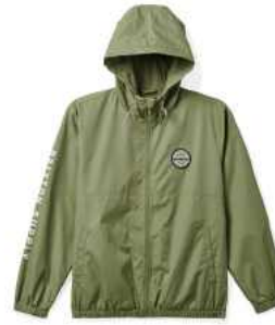
OLIVE SURPLUS 03292-OLVSP