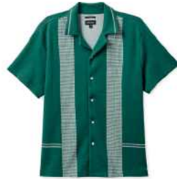
TREKKING GREEN 01398-TRKGN