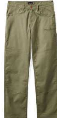
OLIVE SURPLUS 04920-OLVSP