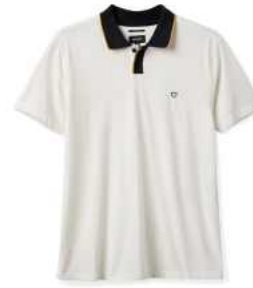
OFF WHITE/BLACK 22617-OFFBK