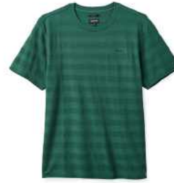
TREKKING GREEN 22601-TRKGN