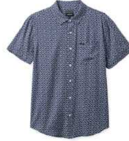
WASHED NAVY/WHITE TILE 01218-WNVWT