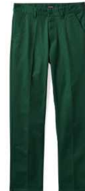
TREKKING GREEN 04888-TRKGN