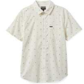
OFF WHITE PYRAMID 01218-OFWPY