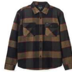
*HEATHER GREY/CHARCOAL 01213-HTGCH