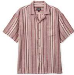
CRANBERRY JUICE/OFF WHITE 01397-CRJOW