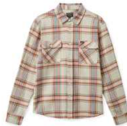
WHITE SMOKE/YELLOW/CASA RED 01213-WSYCR