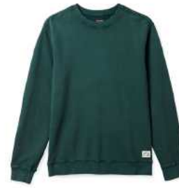
TREKKING GREEN SOL WASH 22593-TKGSW