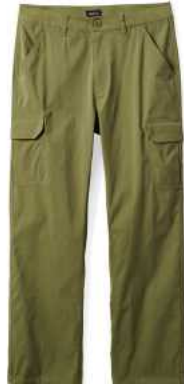
OLIVE SURPLUS 04966-OLVSP