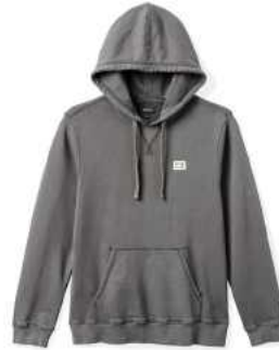
CHARCOAL SOL WASH 22594-CRCSW