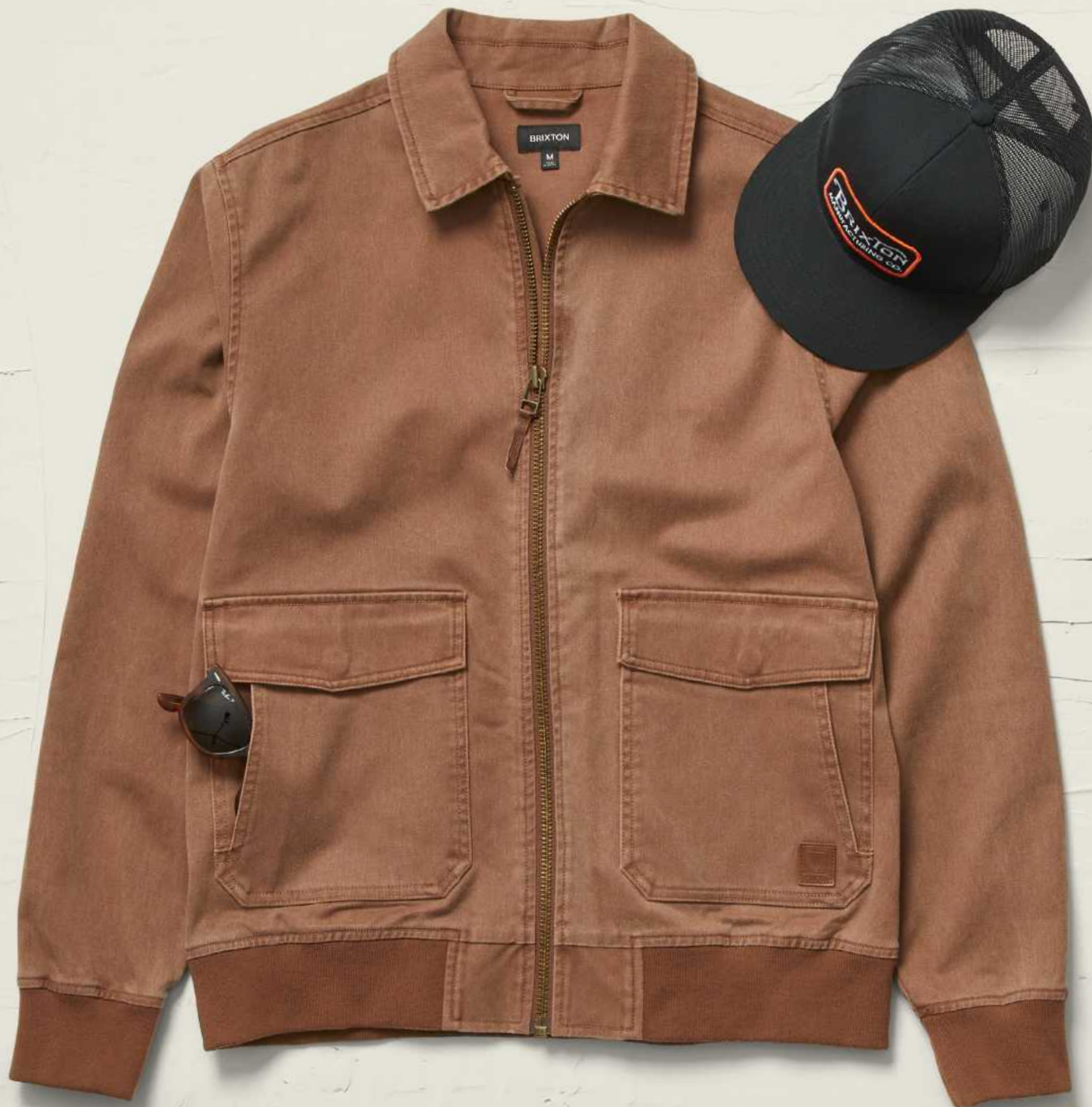
DILLINGER STATION JACKET