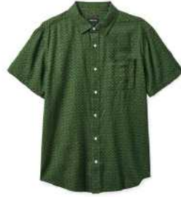
TREKKING GREEN TILE 01218-TRKGT