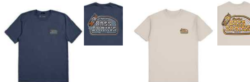
WASHED NAVY 17137-WANAV