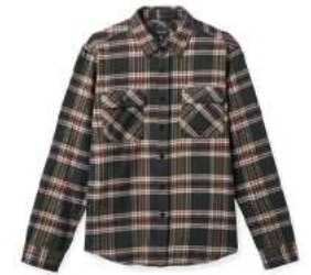
BLACK/CHARCOAL/OFF WHITE 01213-BKOW