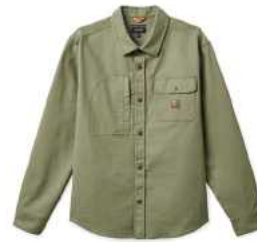
OLIVE SURPLUS 01368-OLVSP