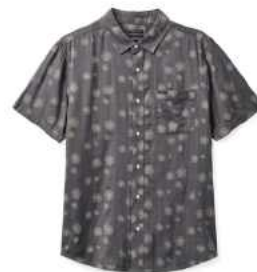
CHARCOAL SOL 01354-CHRCS