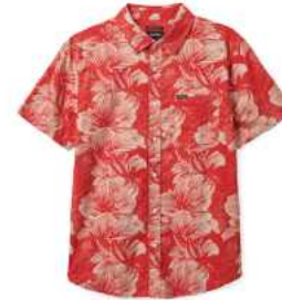
CASA RED/OATMILK FLORAL 01218-CSR0F