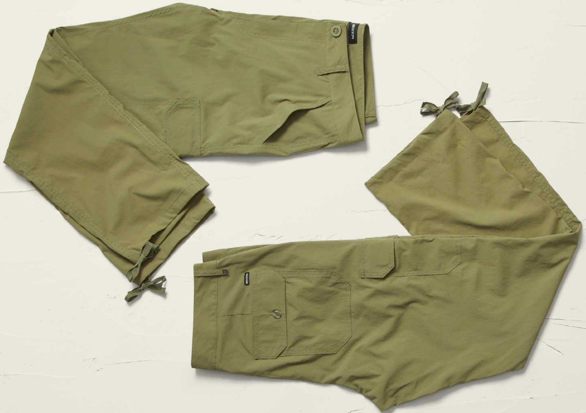
WAYPOINT RIPSTOP CARGO PANT