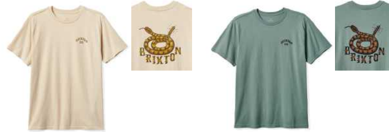
CREAM CLASSIC WASH 16434-CRMCW