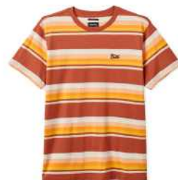
OFF WHITE/SEPIA/KELP GREEN 22616-OWSKP