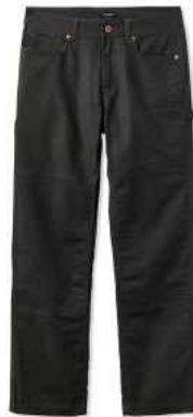
*WASHED BLACK 04920-WABLK