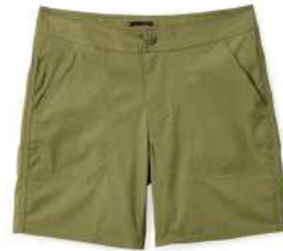
OLIVE SURPLUS 04962-OLVSP