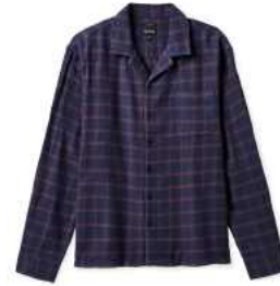
WASHED NAVY/TERRACOTTA 01392-WNTSW