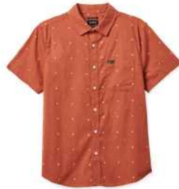
TERRACOTTA PYRAMID 01218-TRCPY