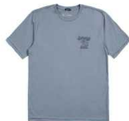
DUSTY BLUE 17093-DUSBL