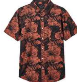
WASHED BLACK/TERRACOTTA FLORAL 01218-WHBTf