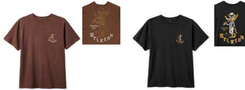
SEPIA WORN WASH 17140-SEPWD