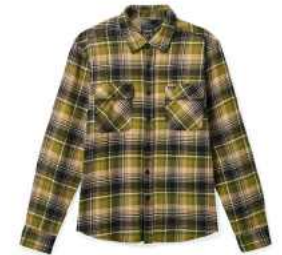
GREEN KELP/SAND/BLACK 01213-GRKSB