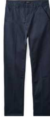
WASHED NAVY 04871-WANAV