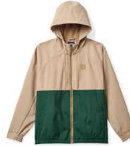
SAND/PINE NEEDLE 03418-SNDPN