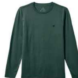
TREKKING GREEN SOL WASH 22498-TKGSW