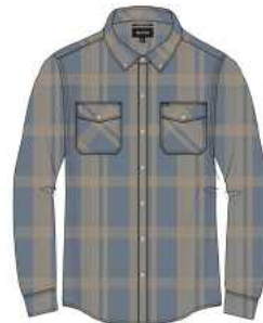
FLINT STONE BLUE/SAND 01415-FLSBS