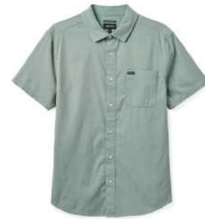
CHINOIS GREEN SOL WASH 01393-CHGSW