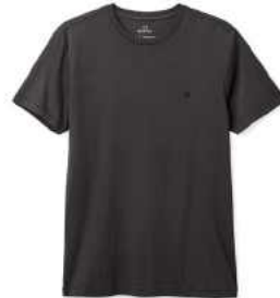
BLACK SOL WASH 22497-BKSWH