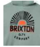
CHINOIS GREEN 22590-CHSGN