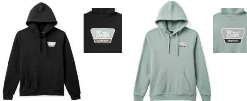
BLACK/CHINOIS GREEN/SEPIA 22337-BKCGS