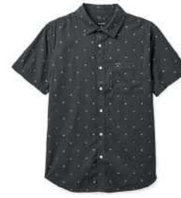
WASHED BLACK PYRAMID 01218-WHBPY