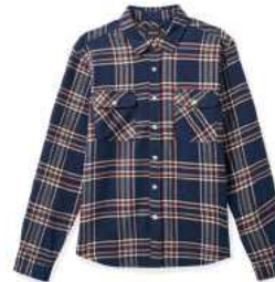
WASHED NAVY/OFF WHITE/TERRACOTTA 01213-WHNOT