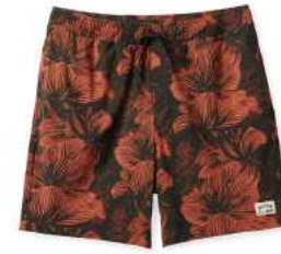
WASHED BLACK/TERRACOTTA FLORAL 16": 04930-WHBTf 18": 04942-WHBTf