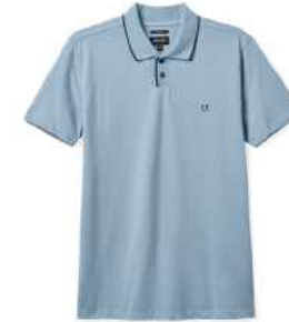
DUSTY BLUE/WASHED NAVY 22617-DSBWN