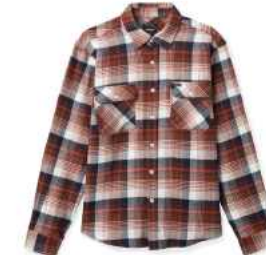
WASHED NAVY/SEPIA/OFF WHITE 01213-WNSOW