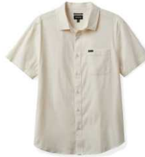
OFF WHITE 01217-OFFWH