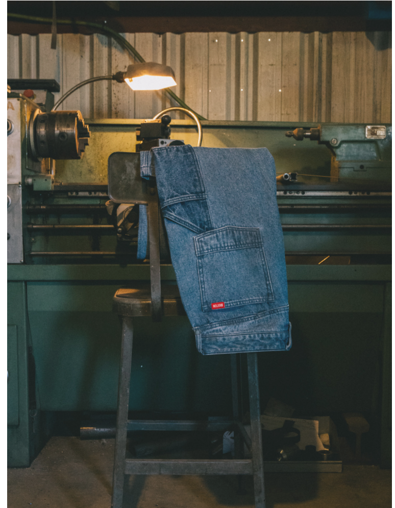
RESERVE ASSEMBLY CARPENTER PANT