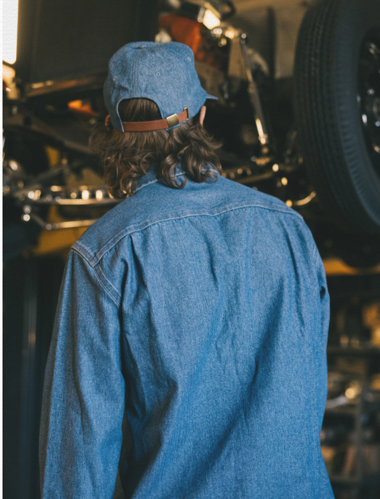
RESERVE ASSEMBLY SNAPBACK