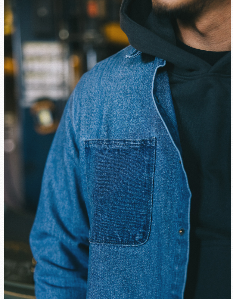
RESERVE ASSEMBLY OVERSHIRT