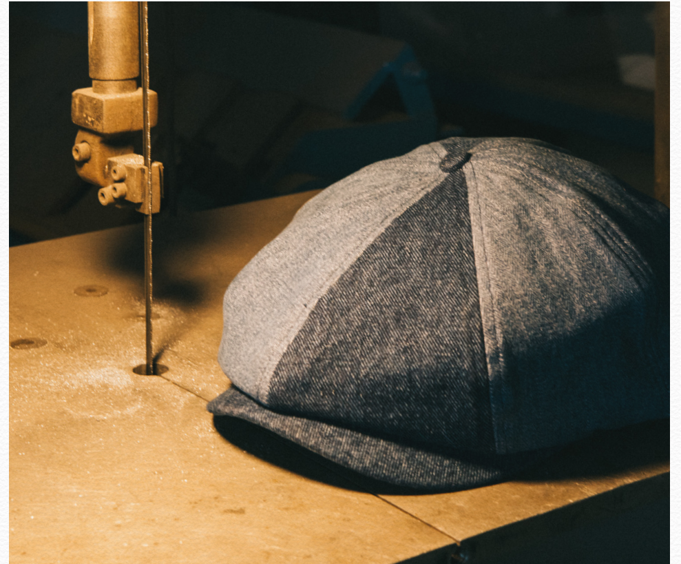
RESERVE ASSEMBLY BROOD NEWSBOY CAP