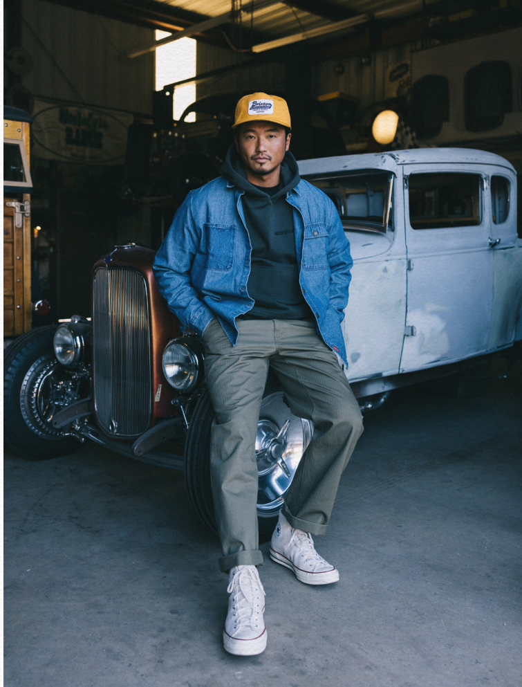
RESERVE ASSEMBLY OVERSHIRT