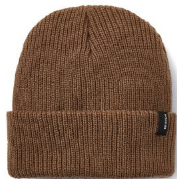
**COYOTE BROWN 10782-COYOT