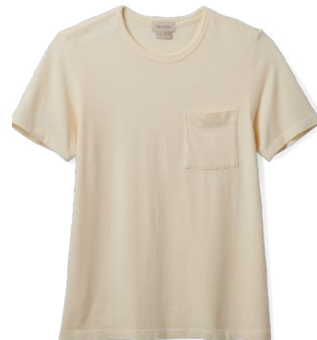
*WHITE SMOKE 22679-WHTSK