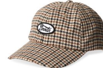
SAND/BLACK HOUNDSTOOTH 11225-SNDBH