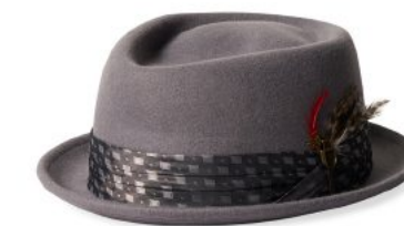
LIGHT GREY/GREY DIAMOND 10764-LGGGD