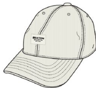
OFF WHITE 11588-OFFWH