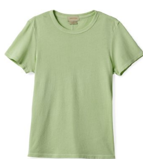
LIGHT MATCHA 22604-LGTMT