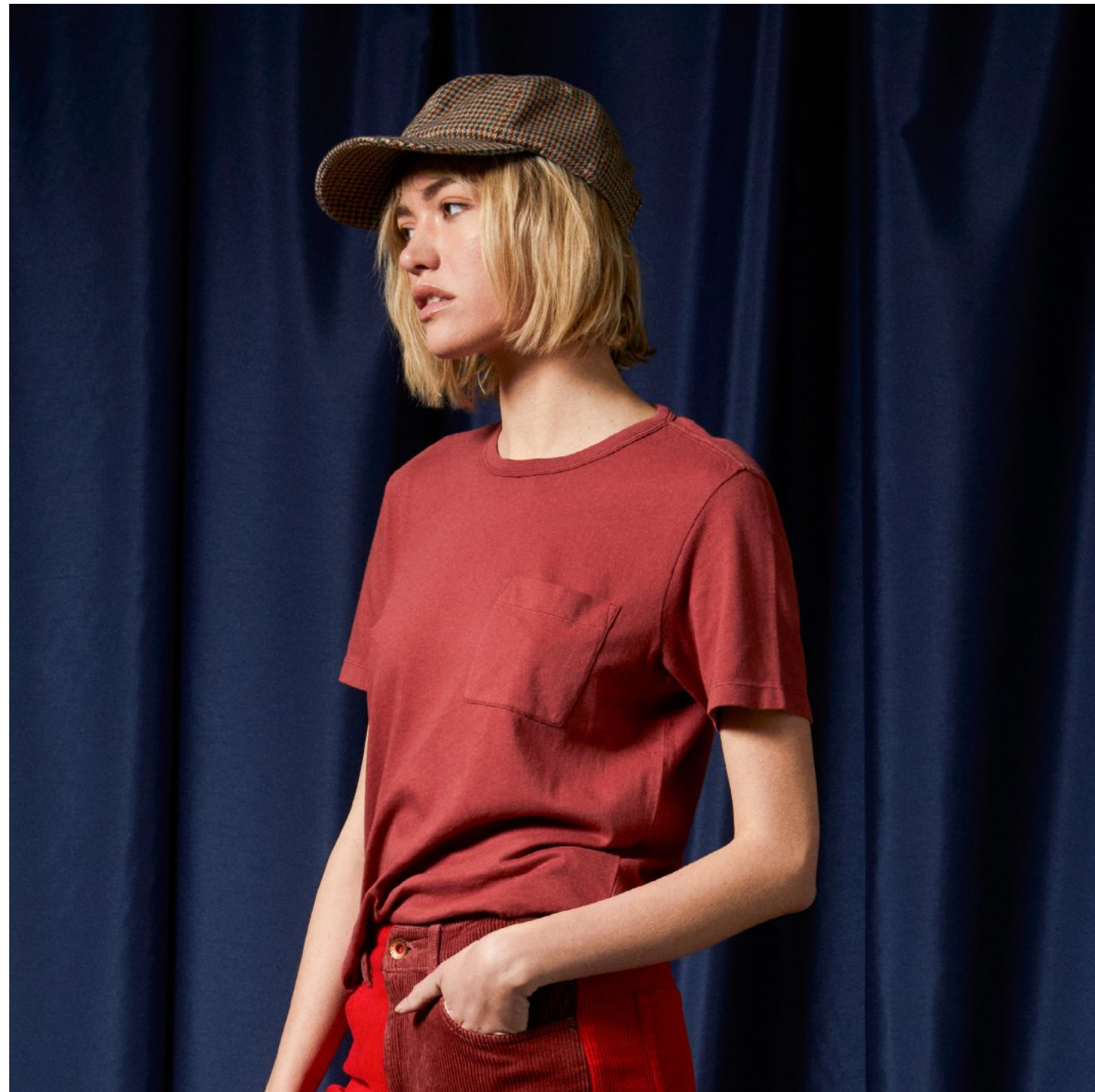
SHELBY ADJUSTABLE HAT