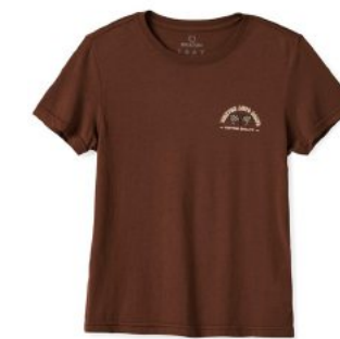
PINECONE BROWN WORN WASH 22719-PNBWW