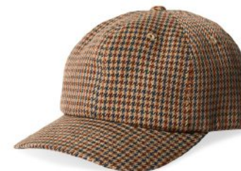
SAND HOUNDSTOOTH 11721-SNDHT