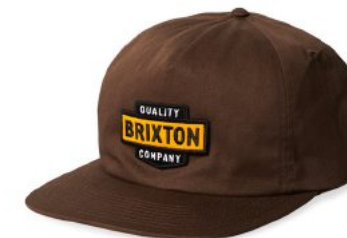
PINECONE BROWN 11690-PNCBN