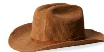
TOBACCO BROWN CORD 11709-TBCBC