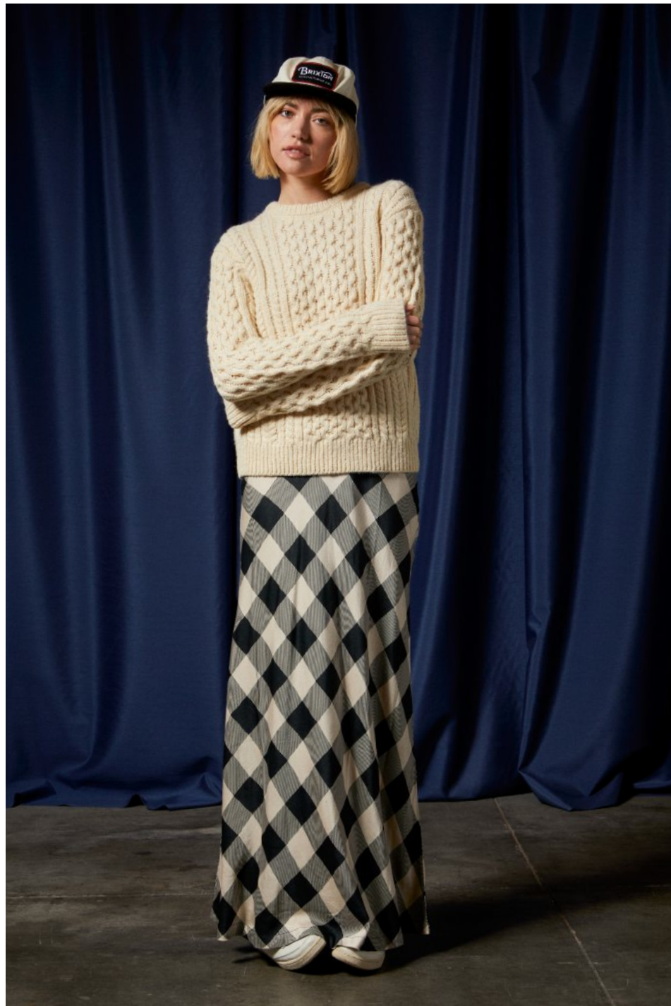
SILKY FULL LENGTH SKIRT