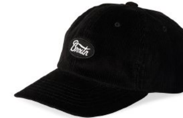
BLACK CORD 11225-BKCRD