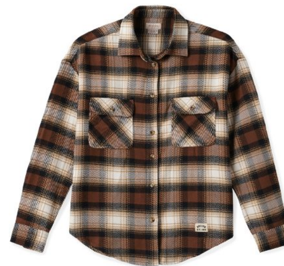
GARDEN TOPIARY/WASHED COPPER 01424-GDTWC