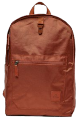
**DARK BRICK 05556-DRBRK