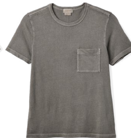
*WASHED BLACK 22679-WABLK