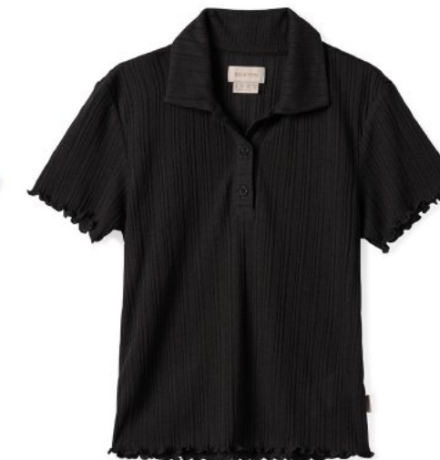
WASHED BLACK 22708-WBLK