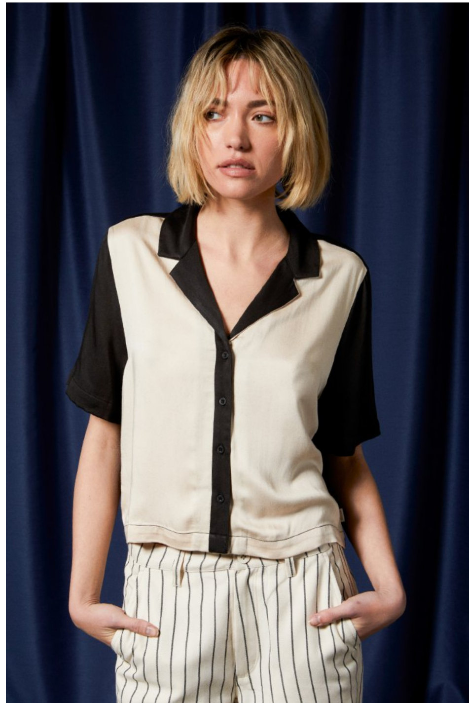
SILKY S/S BOWLING SHIRT