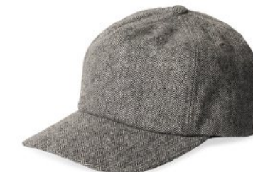
GREY/BLACK HERRINGBONE 11721-GRYBH