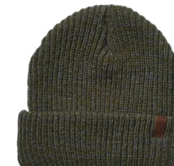
*MILITARY OLIVE/CHARCOAL 11684-MIOCH