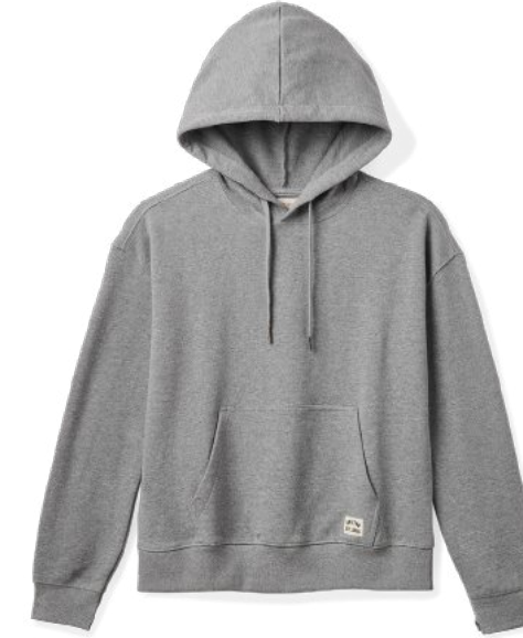
*HEATHER GREY 22687-HTGRY