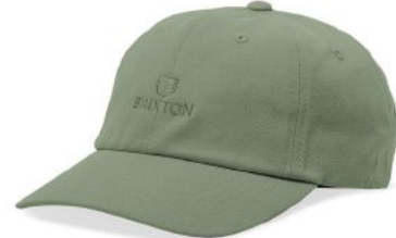
*OLIVE/OLIVE RINSE 11776-OLOLR