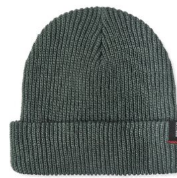
**DARK FOREST 10782-DRKFO