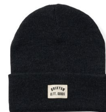
**WASHED BLACK 11508-WABLK