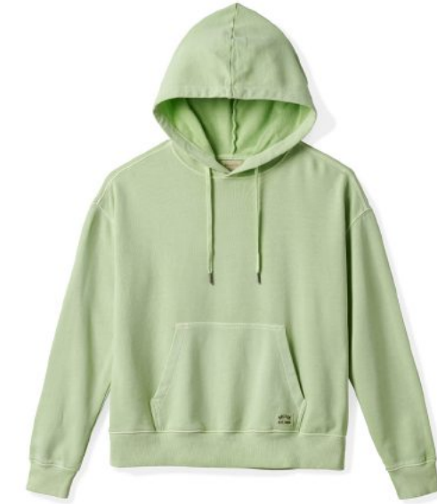
LIGHT MATCHA 22687-LGTMT