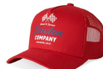
CASA RED 11847-CSARD