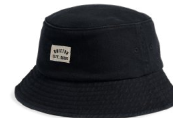
*BLACK SOL WASH 11619-BKSWH