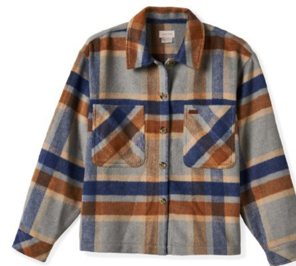
WASHED COPPER 01433-WSHCP