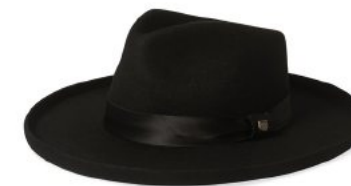
*BLACK/BLACK SATIN 11511-BKBLS