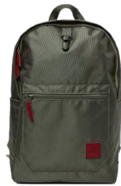
**OLIVE SURPLUS 05556-OLVSP