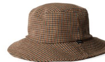
SAND/LIGHT BLUE 11712-SNDLB