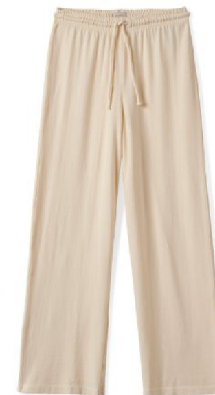
WHITE SMOKE 04999-WHTSK