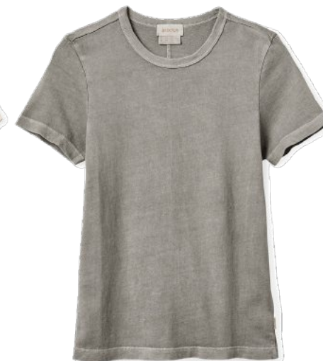
*WASHED BLACK 22604-WABLK