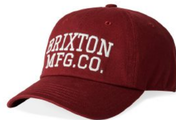
SYRAH RED 11845-SYHRD