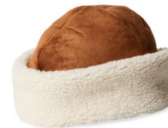
TOFFEE/OFF WHITE 11009-TFEOW