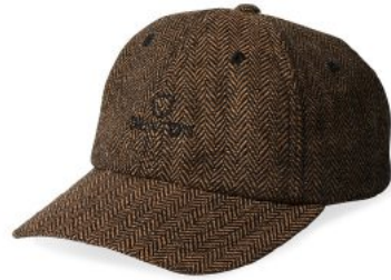
BROWN/KHAKI HERRINGBONE 10731-BRNKH