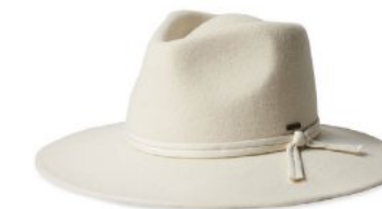
*OFF WHITE 10628-OFFWH