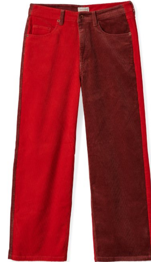
COWHIDE/MARS RED CORD 04985-CWMRC