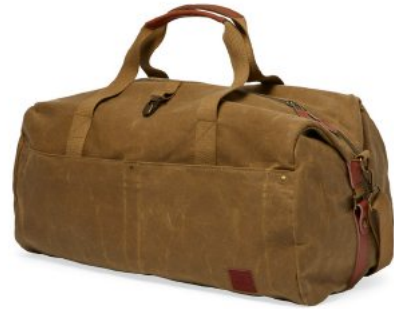
**OLIVE BROWN 05549-OLVBN