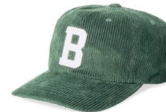
*EMERALD CORD 11158-EMRDC