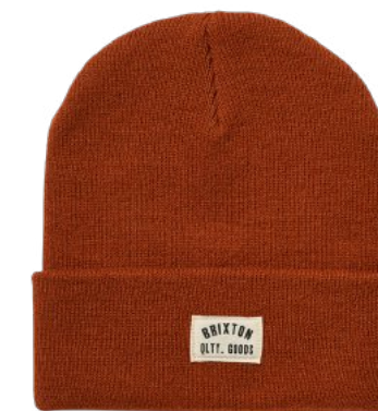
**RUST ORANGE 11508-RSTOG