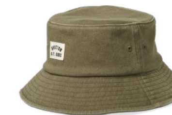
*VETIVER SOL WASH 11619-VTVSW