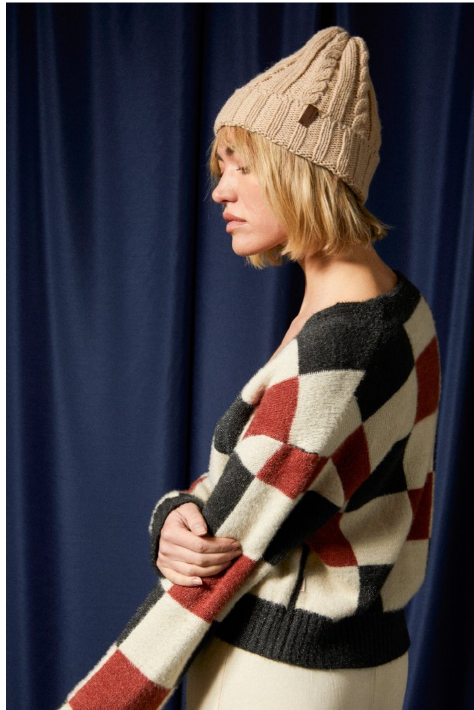
CONTINENTAL CABLE KNIT BEANIE