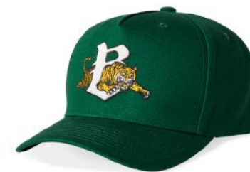
HUNTER GREEN 11846-HUNTG