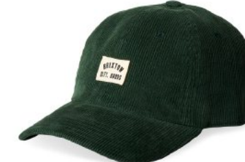
EMERALD CORD 11588-EMRDC