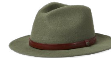
*LIGHT MOSS 10763-LGTMS