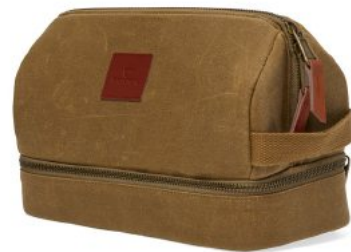
**OLIVE BROWN 05550-OLVBN