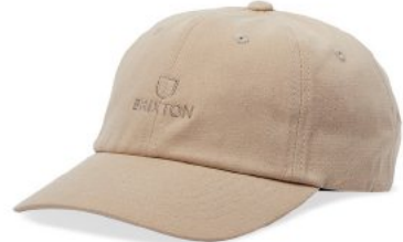
*SAND/SAND RINSE 11776-SDSDR