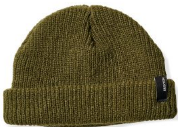
*MILITARY OLIVE 11207-MILOL