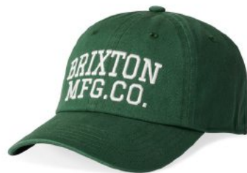
DEEP FOREST 11845-DPFRT