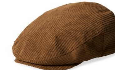
PINECONE BROWN 10771-PNCBN