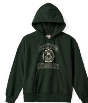
DEEP FOREST 22721-DPFRT