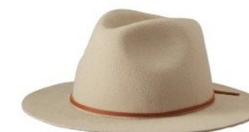
*LIGHT TAN 10761-LTTAN