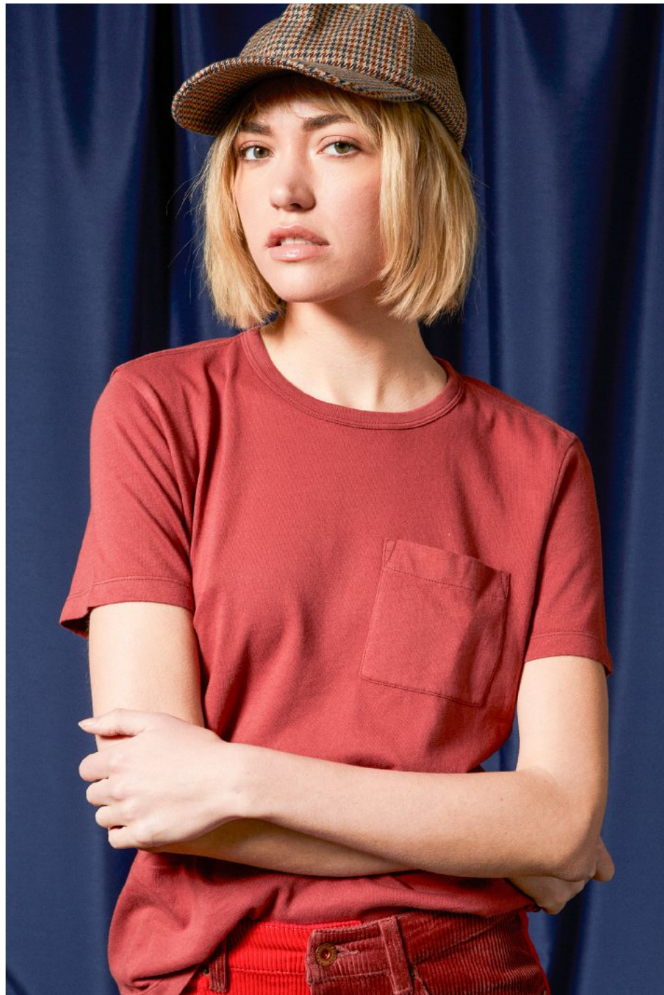
CAREFREE ORGANIC GARMENT DYE PERFECT TEE