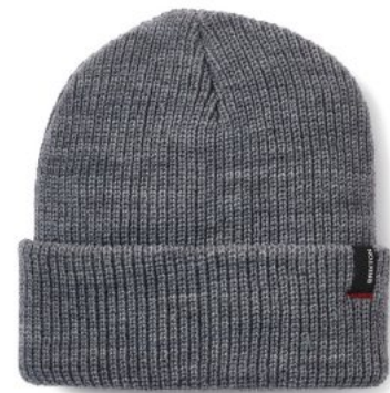
**HEATHER GREY 10782-HTGRY