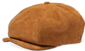
TOFFEE SUEDE 10614-TOFSD