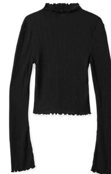
WASHED BLACK 22709-WBLK