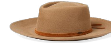
*TOBACCO BROWN 11785-TBCBN