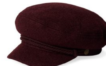
RED MAHOGANY 10772-RDMHG