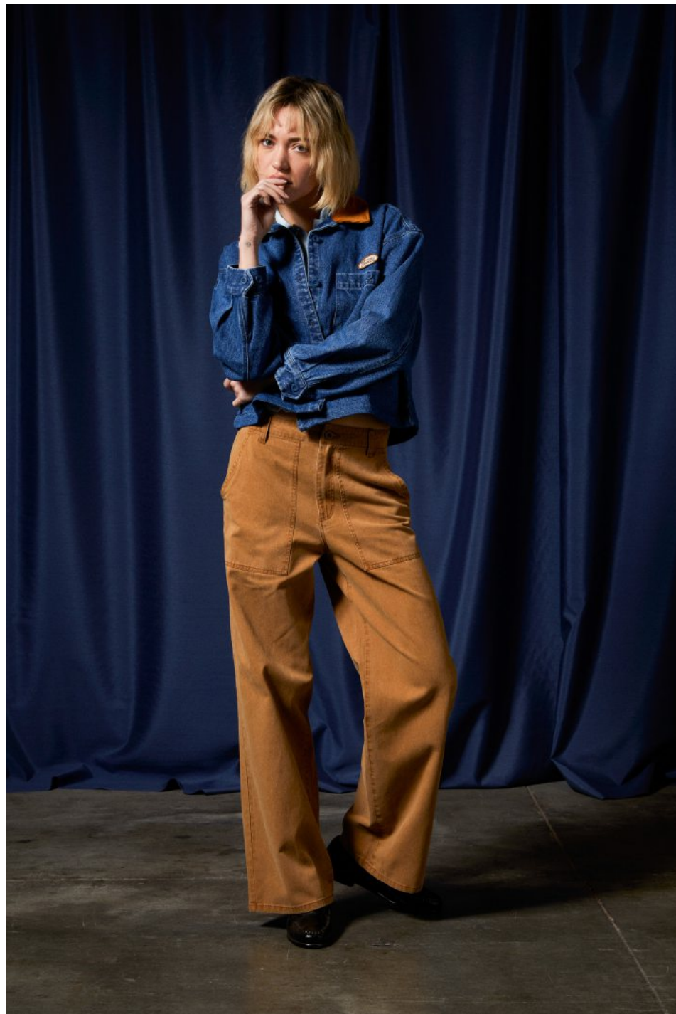
VINTAGE MILITARY LIGHTWEIGHT PANT