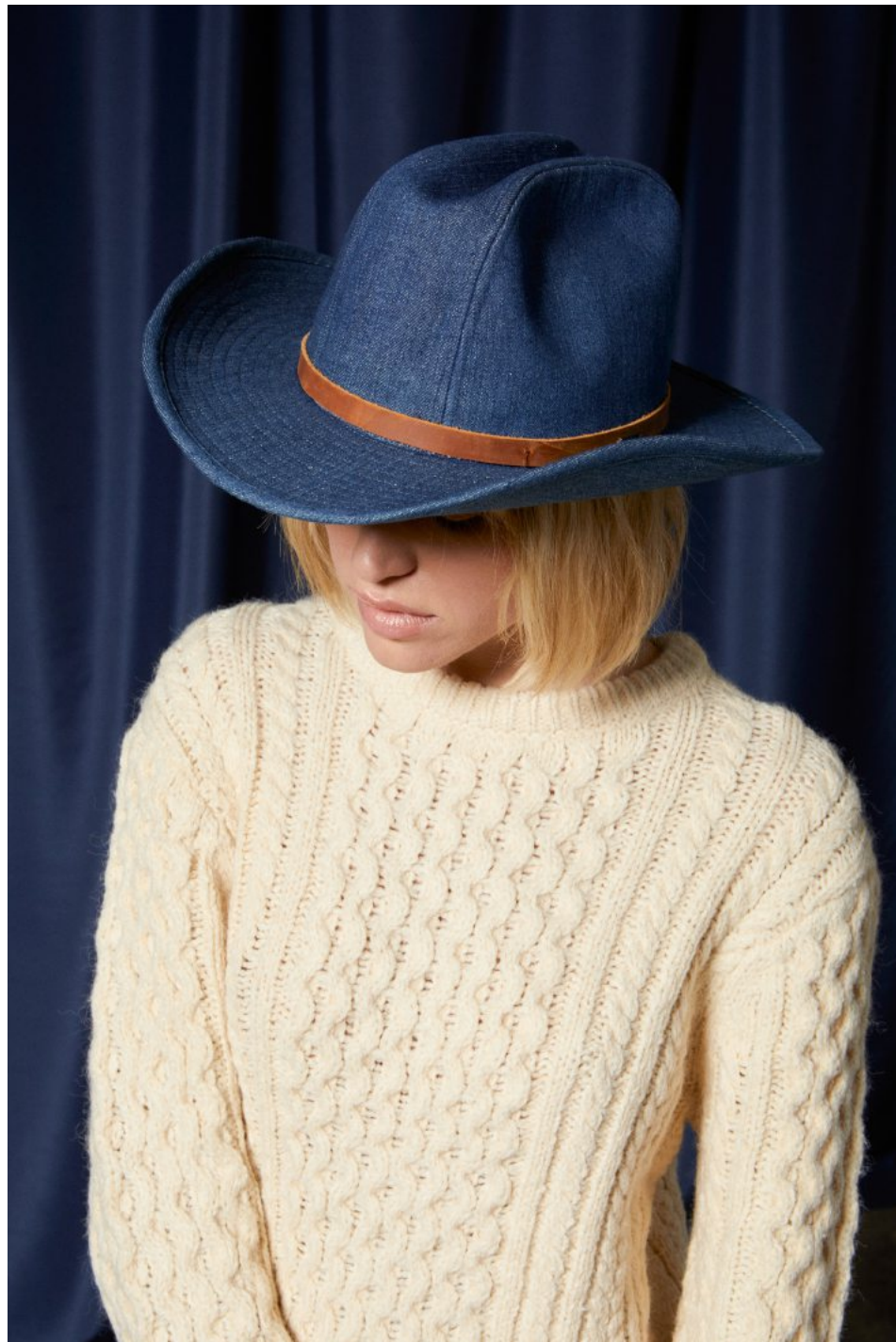
RANGE 70'S COWBOY HAT