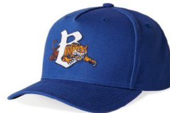
ROYAL BLUE 11846-ROBLU