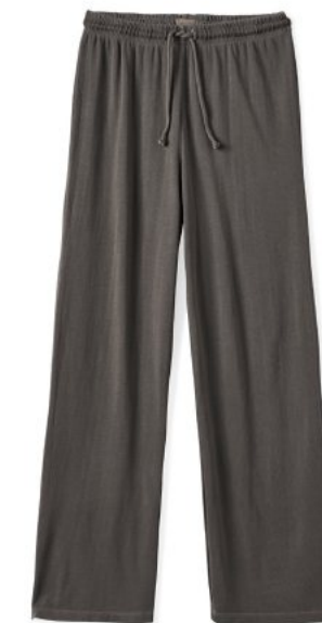
WASHED BLACK 04999-WABLK