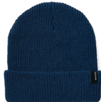
**DARK DENIM 10782-DKDEN