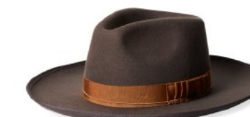
DARK GREY/COPPER 11040-DKGCP