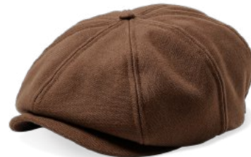
*PINECONE BROWN 11752-PNCBN