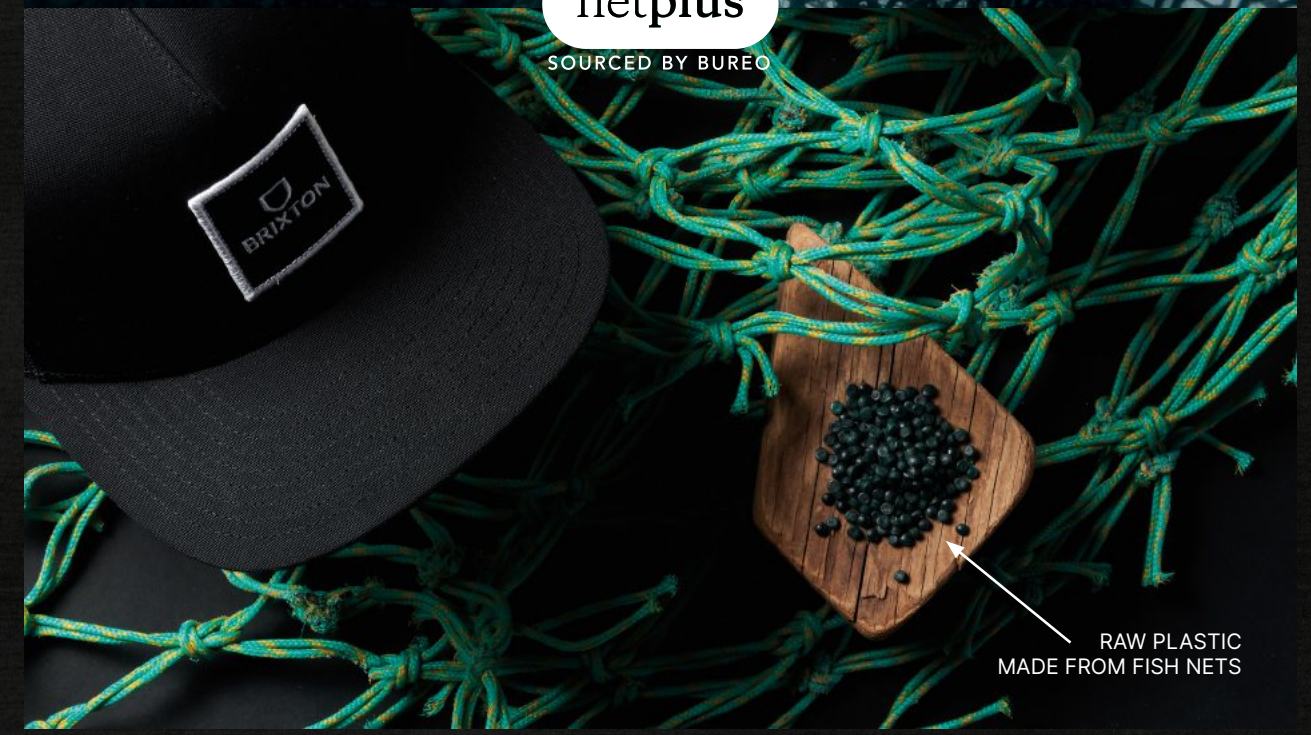
RAW PLASTIC MADE FROM FISH NETS