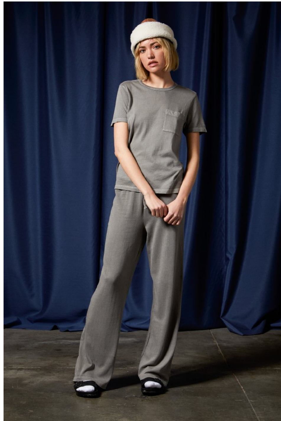
CAREFREE ORGANIC GARMENT DYE LOUNGE PANT