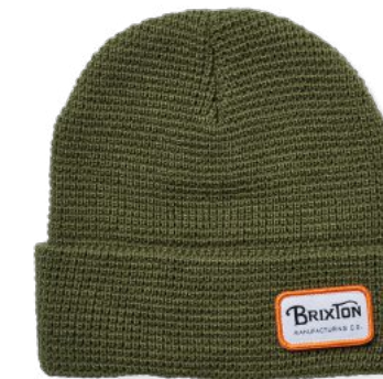
*MILITARY OLIVE 11681-MIOL