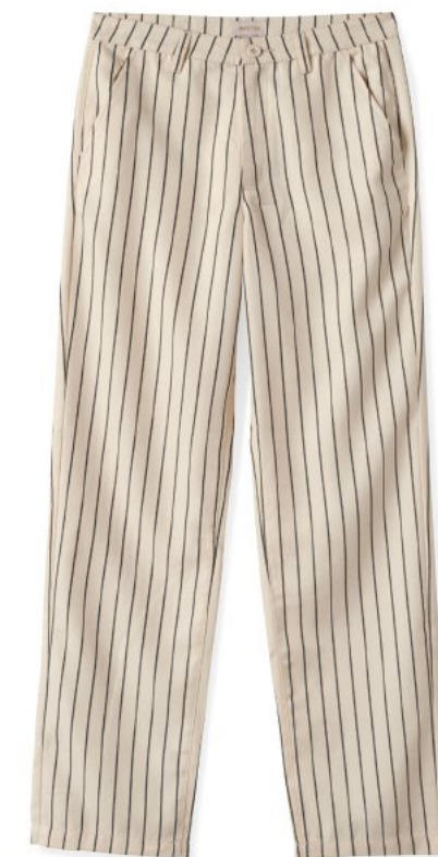
WHITECAP/WASHED BLACK PINSTRIPE 04983-WCWBP