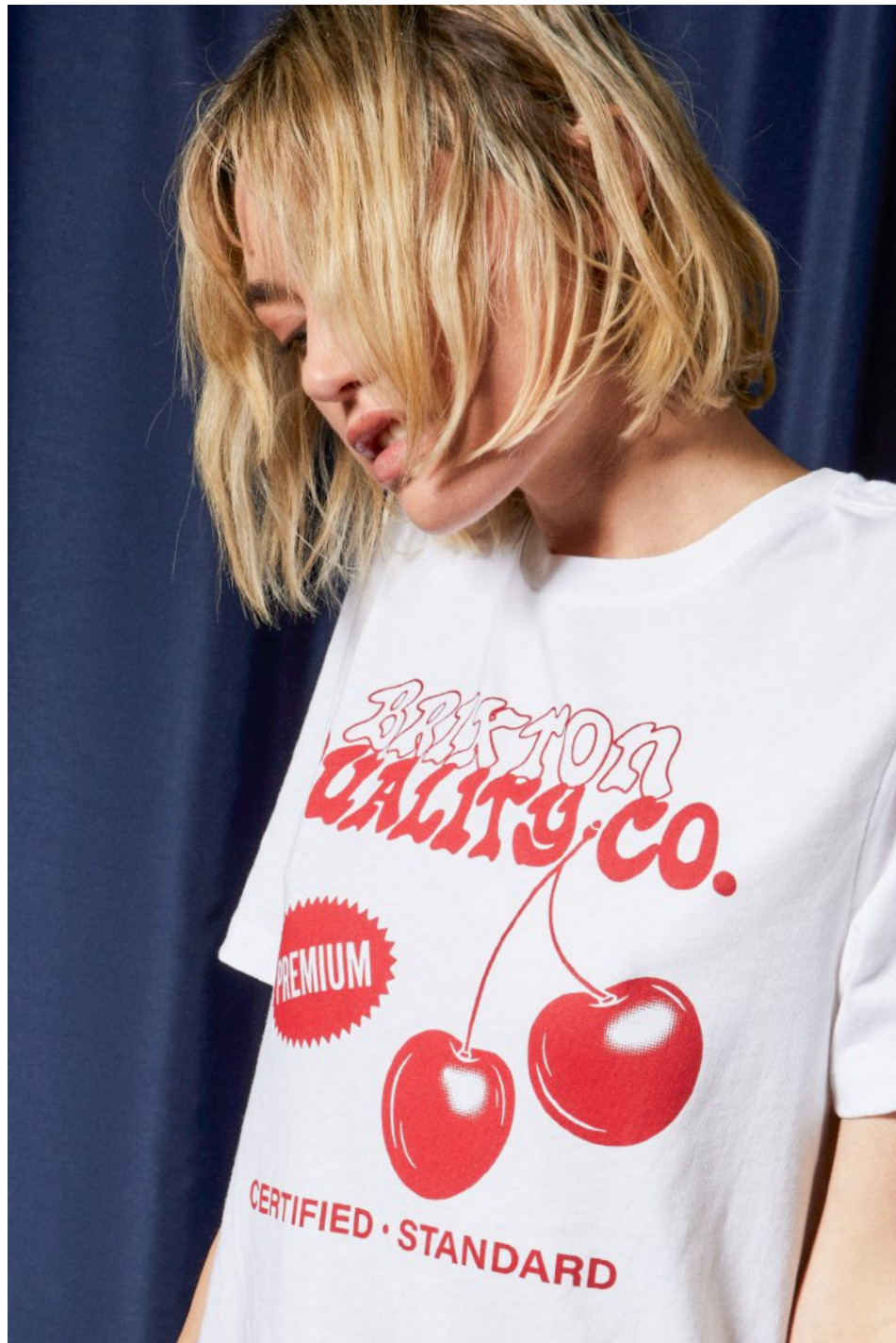
PREMIUM CHERRY VINTAGE CREW TEE