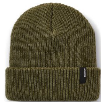
**MILITARY OLIVE 10782-MILOL