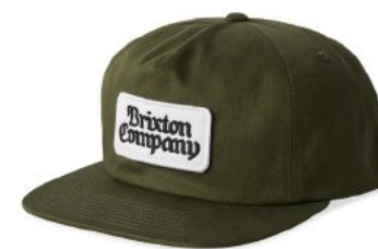
DARK OLIVE 11689-DKOLI