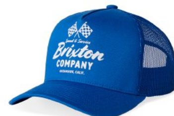
NAUTICAL BLUE 11847-NUCBU