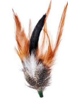
**BURNT ORANGE/BLACK/MAHOGANY 05515-BTOBM