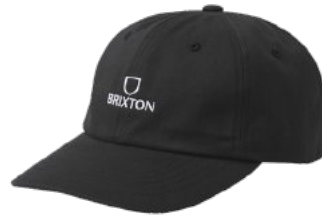
**BLACK/WHITE RINSE 11776-BLKWR