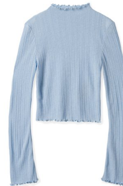
GLACIAL BLUE 22709-GLCBL