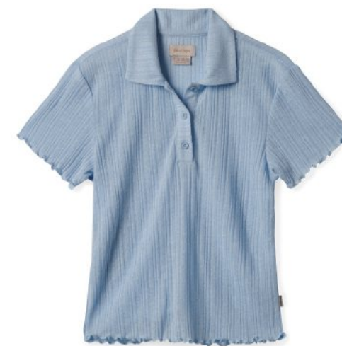
GLACIAL BLUE 22708-GLCBL