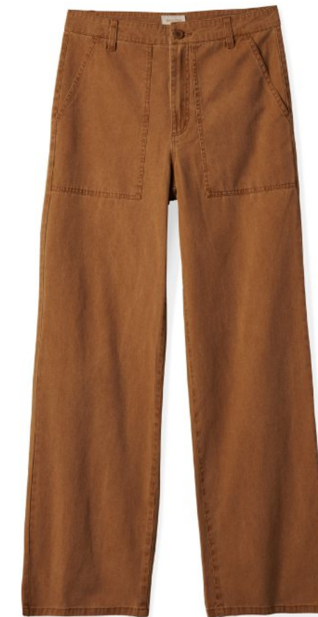
WASHED COPPER 04986-WSHCP