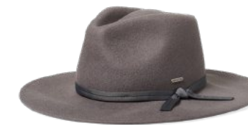
*DARK GREY 10628-DKGRY