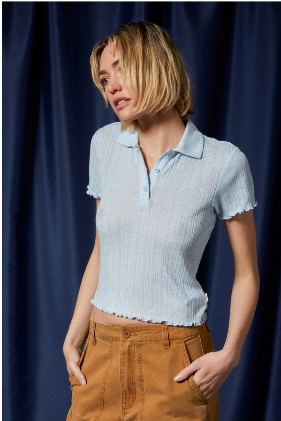
NOVELTY RIBBED S/S POLO