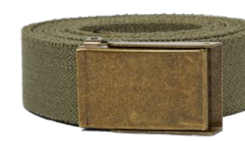
**OLIVE SURPLUS 05557-OLVSP