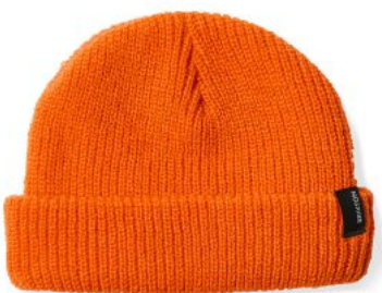
*ATHLETIC ORANGE 11207-ATHOR