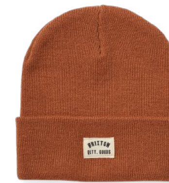
**ROSE GOLD 11508-ROSGD