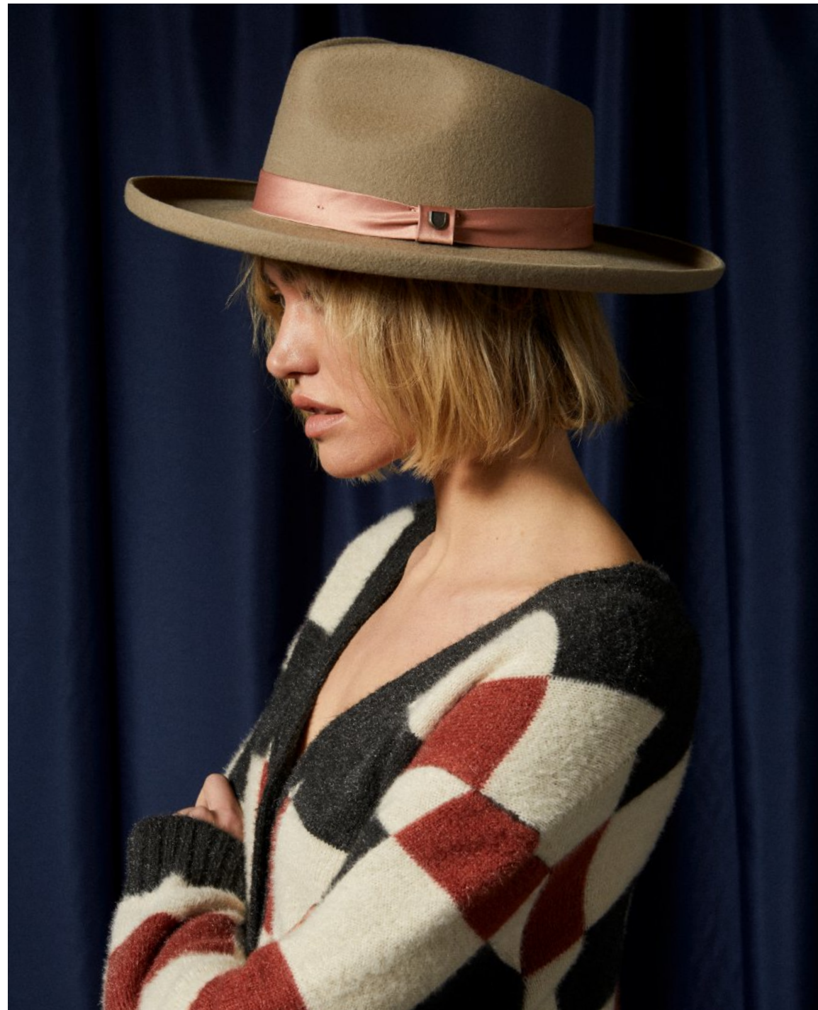
VICTORIA FELT FEDORA