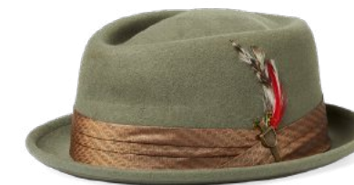
*LIGHT MOSS/COFFEE DIAMOND 10764-LGMCD