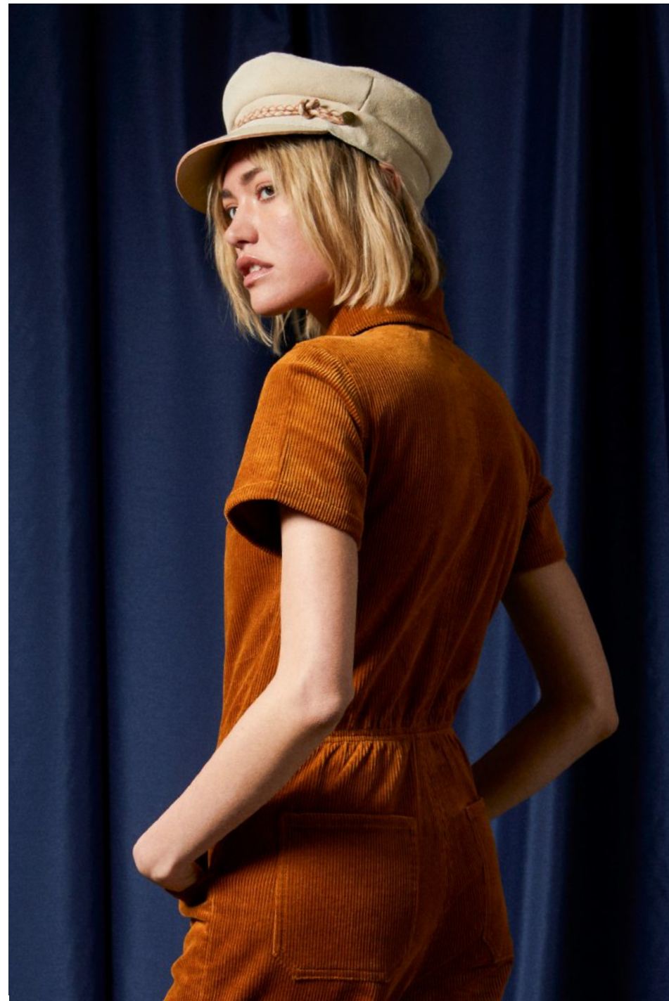
KAYLA RESERVE CAP