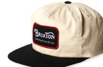
OFF WHITE/BLACK 11697-OFFBK