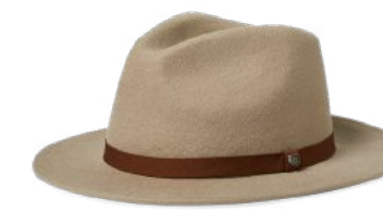
*TIMBERWOLF/LIGHT BROWN 10607-TMWLB