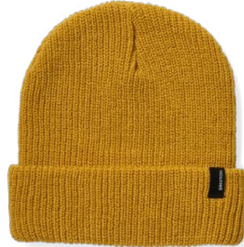
**SAUTERNE YELLOW 10782-STRYW