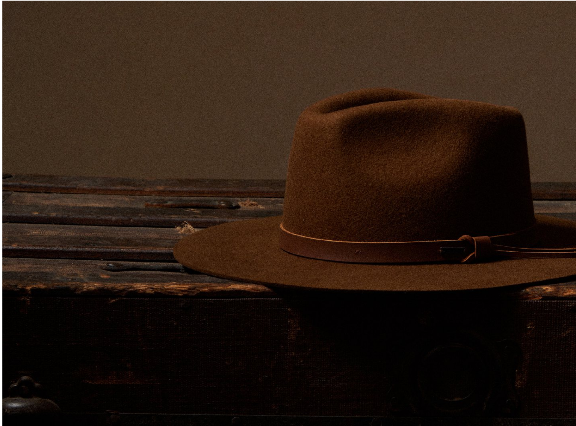
HAWKINS WTHR GUARD™ COWBOY HAT