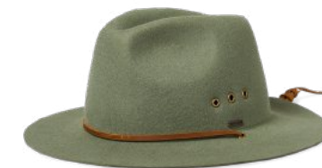
**LIGHT MOSS 11732-LGTMS