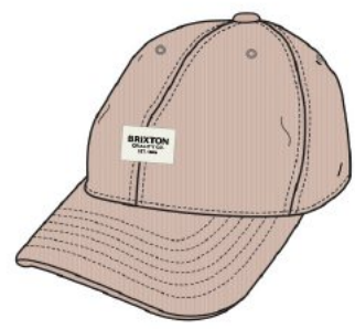
ROSE DUST 11588-ROSDT