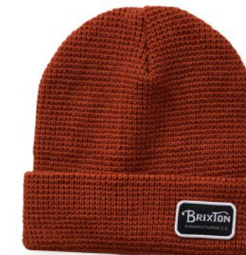
RUST ORANGE 11681-RSTOG