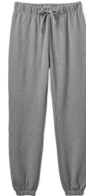
*HEATHER GREY 04993-HTGRY