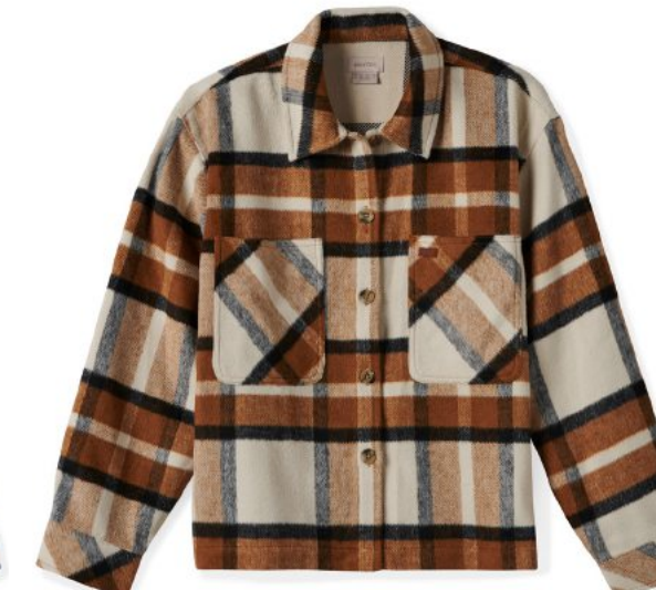
DARK DENIM 01433-DKDEN