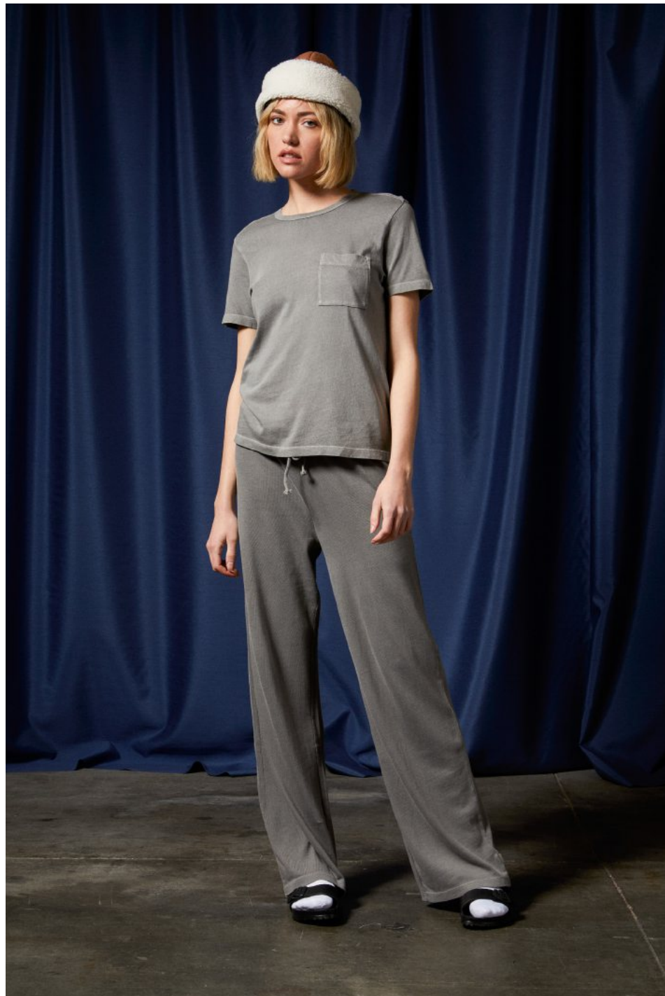
CAREFREE ORGANIC GARMENT DYE PERFECT TEE