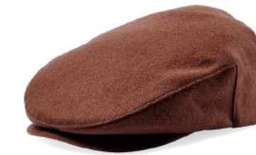
*TOBACCO BROWN 11753-TBCBN