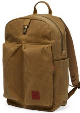
**OLIVE BROWN 05548-OLVBN