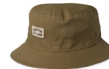
*SAND SOL WASH 11619-SNSDW