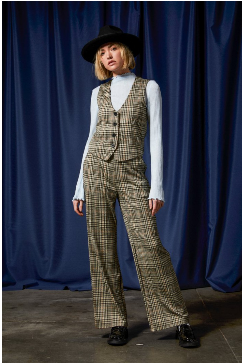
MENSWEAR PLAID LEISURE VEST & TROUSER