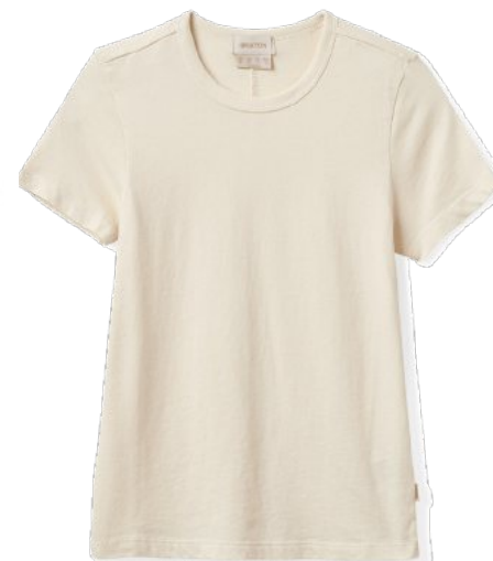
*WHITE SMOKE 22604-WHTSK