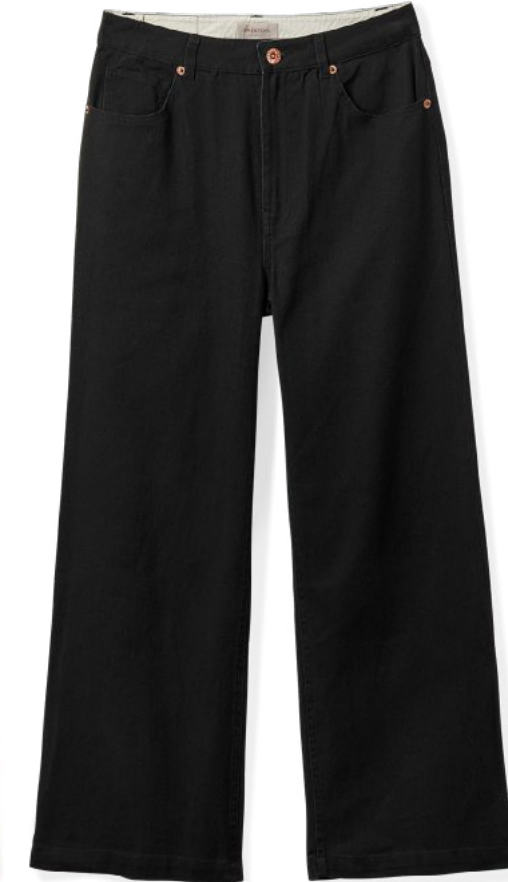
*WASHED BLACK 04985-WABLK