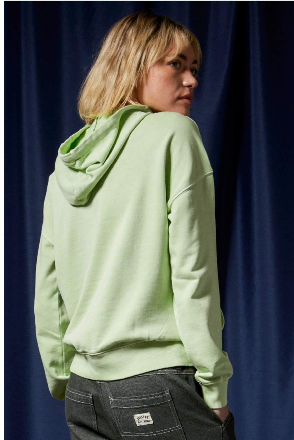
CROSS LOOP FRENCH TERRY HOODIE