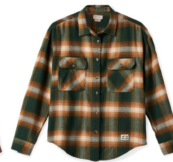
PINECONE BROWN/BLACK/SAND 01424-PNBBS