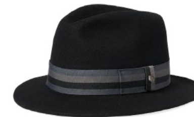
*BLACK/GREY CHARCOAL 11705-BLKGC