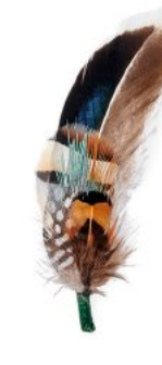
**BISON/MOJAVE/BURNT ORANGE 05515-BSMBO