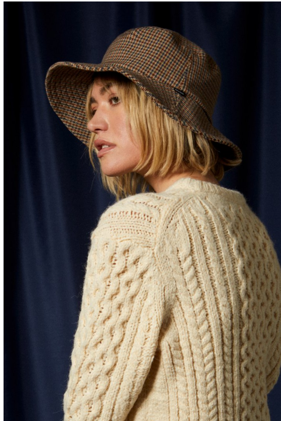
EZRA PACKABLE BUCKET HAT