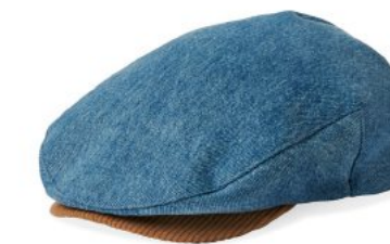
DENIM RINSE/WOODSMOKE 10771-DMRWS