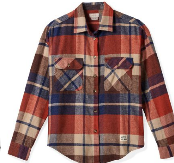
NAVY/MARS RED/WHITECAP 01424-NVMRW