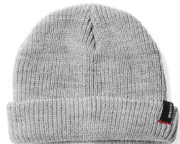
*LIGHT HEATHER GREY 11207-LHTGY