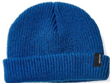
*JOE BLUE 11207-JOBLU