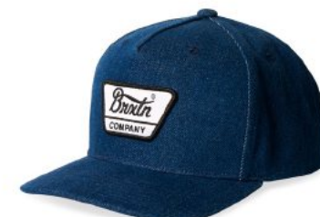
DENIM RINSE 10980-DNMRS