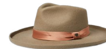
*TIMBERWOLF/ROSE GOLD SATIN 11511-TMWRG