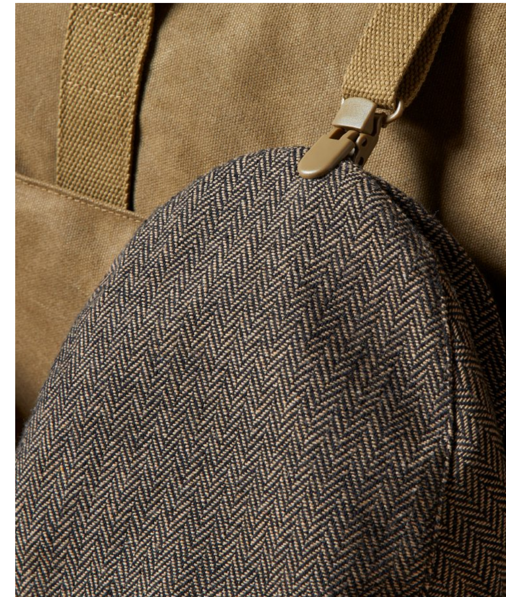
BUILT-IN HAT CLIP