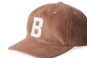
OATMEAL POLAR FLEECE 11158-OMLPF