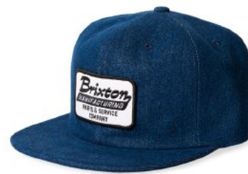
DENIM RINSE 11685-DNMR5