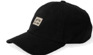
*BLACK VINTAGE WASH 11588-BLKVW