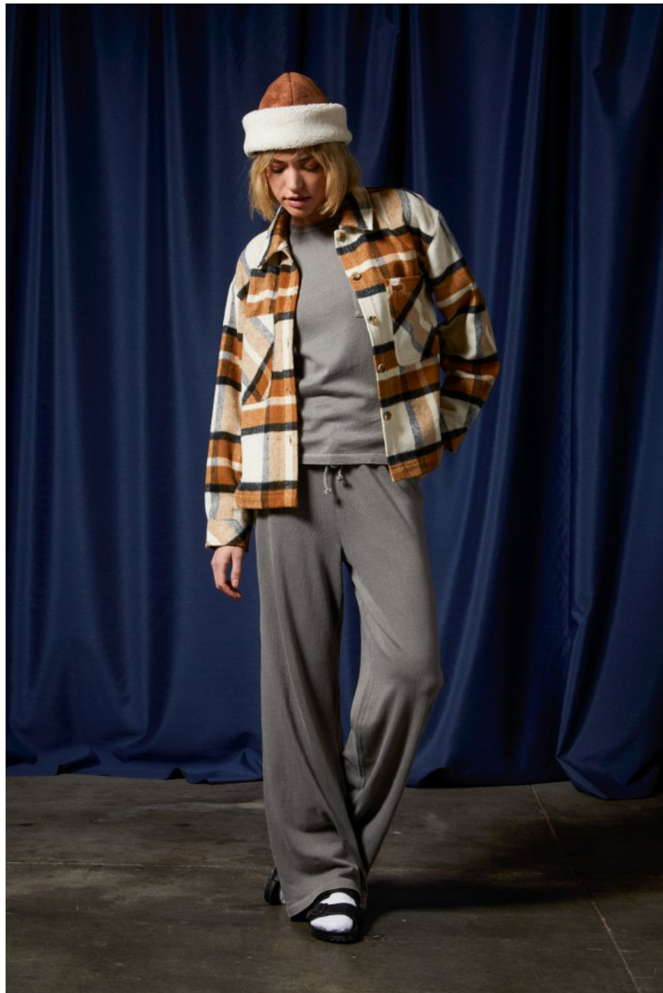
BOWERY WOMEN'S SOFT BRUSHED FLANNEL