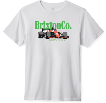
WHITE/NEON GREEN 17276-WHNEG