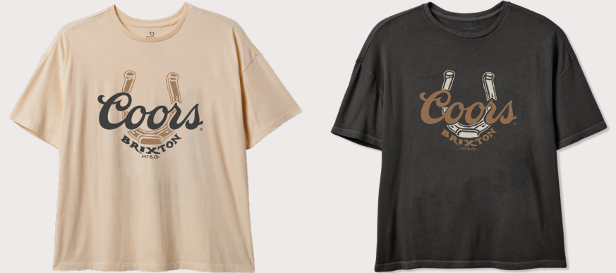
WASHED CREAM 17308-WSCRM