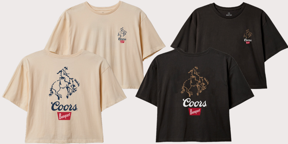
WASHED CREAM 17307-WSCRM