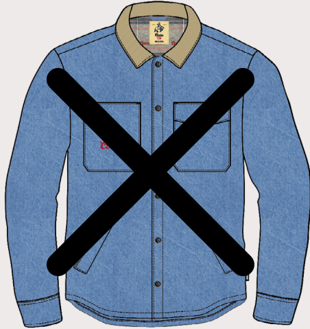
WASHED DENIM 03461-WADNM